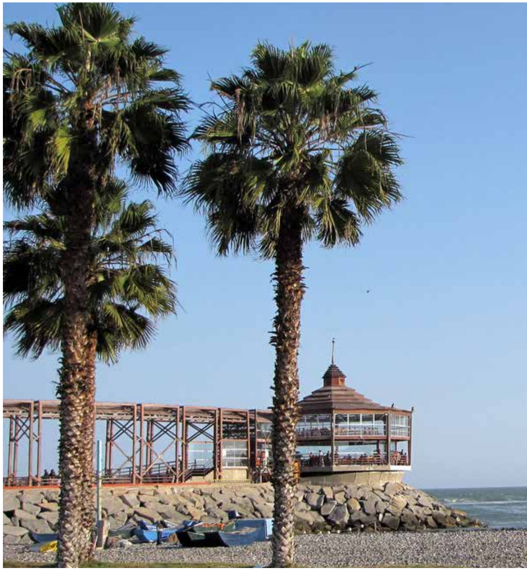
La Punta - Callao