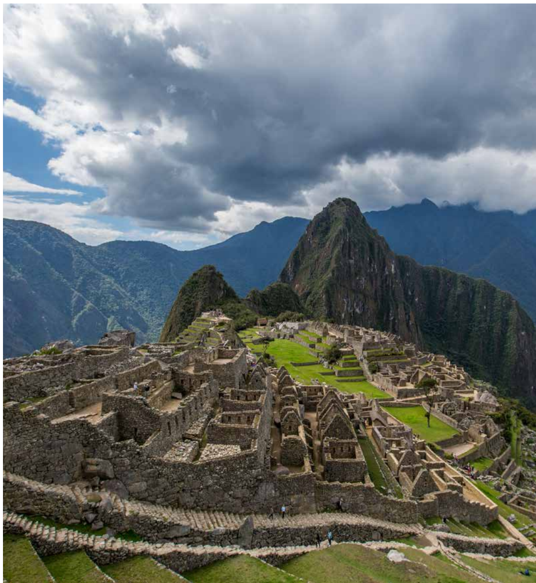
Machu Picchu Citadel