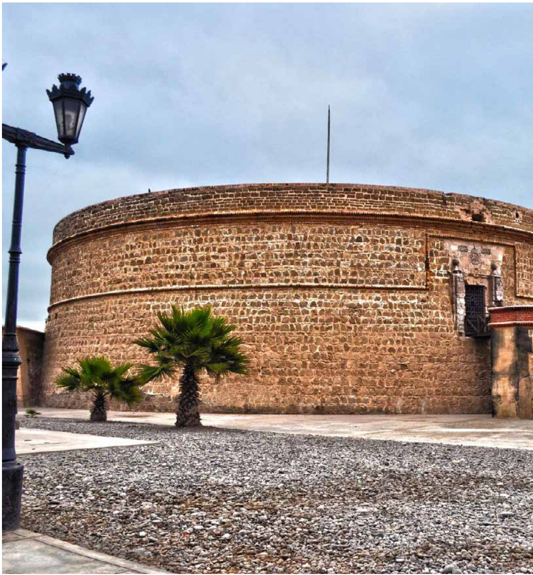
Real Felipe Fortress