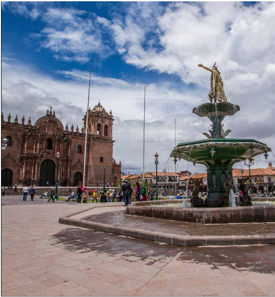
Plaza de Armas