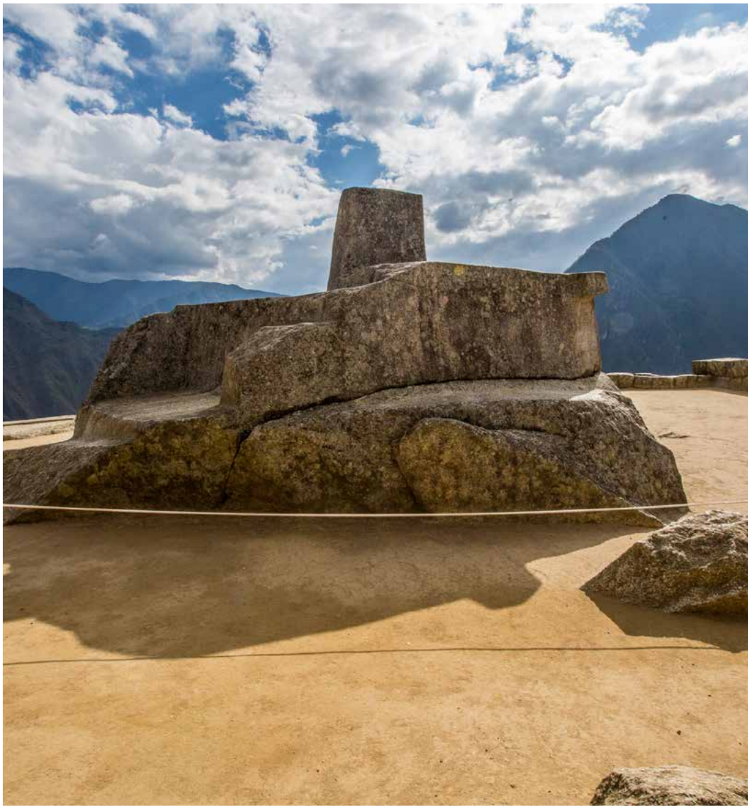
Sacred Sun Dial