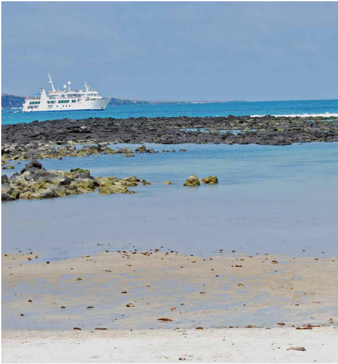
Puerto Ayora, Santa Cruz Island