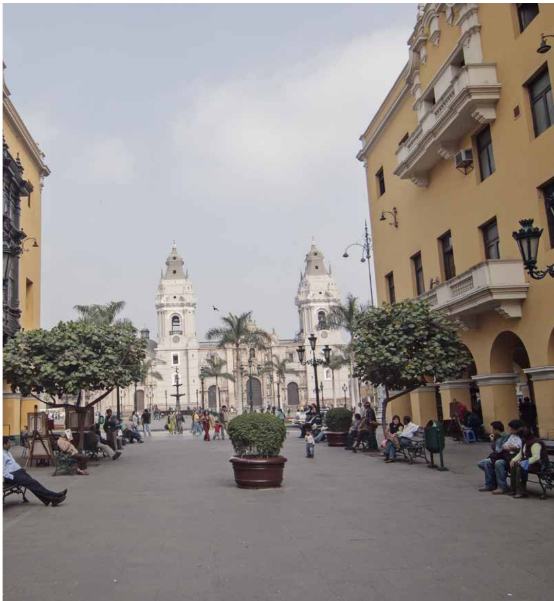
Lima's Historical Center

Enjoy a half day guided sightseeing tour to the most attractive and important sites in Lima, the "City of Kings". Visit Lima's Historical Center, passing by Plaza San Martin, Plaza Mayor, the Government Palace, the City Hall, the Cathedral and its Religious Art Museum (closed on Sunday and Saturday pm; Santo Domingo Convent is provided instead on these days) as well as San Francisco Monastery and its famous underground crypts known as the Catacombs.