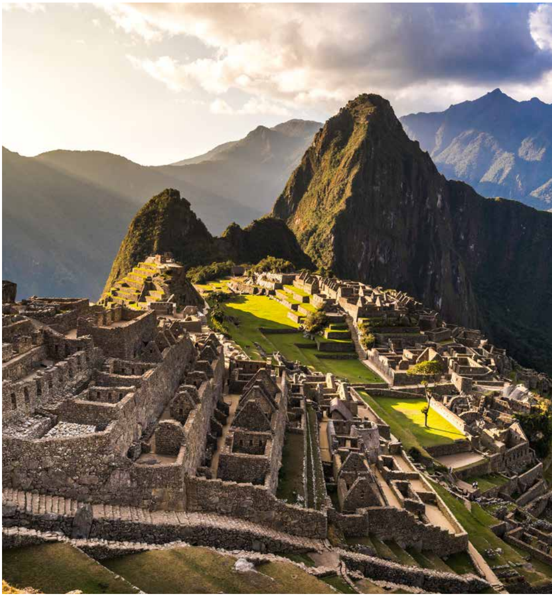
Machu Picchu Citadel