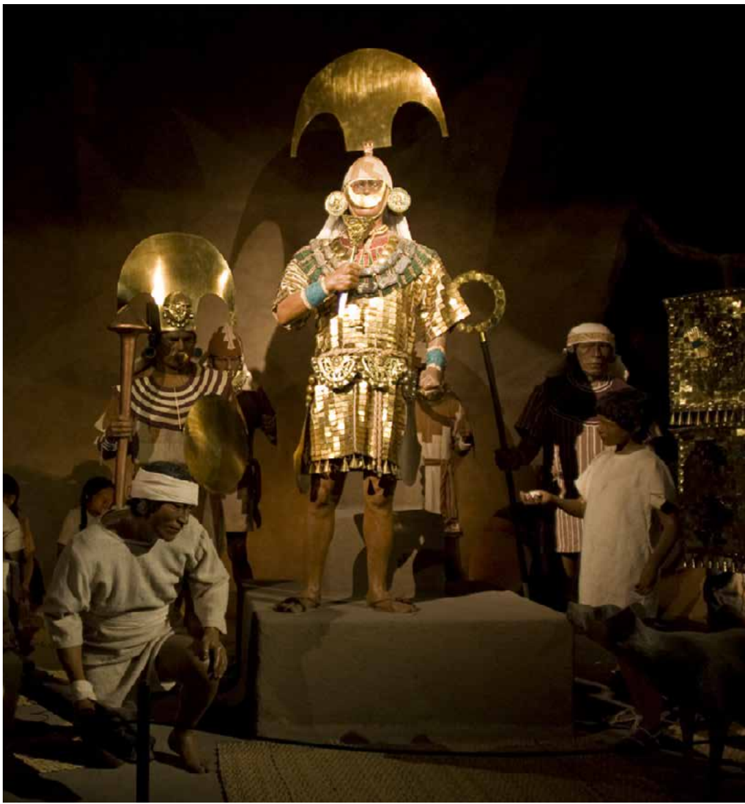
Lord of Sipan