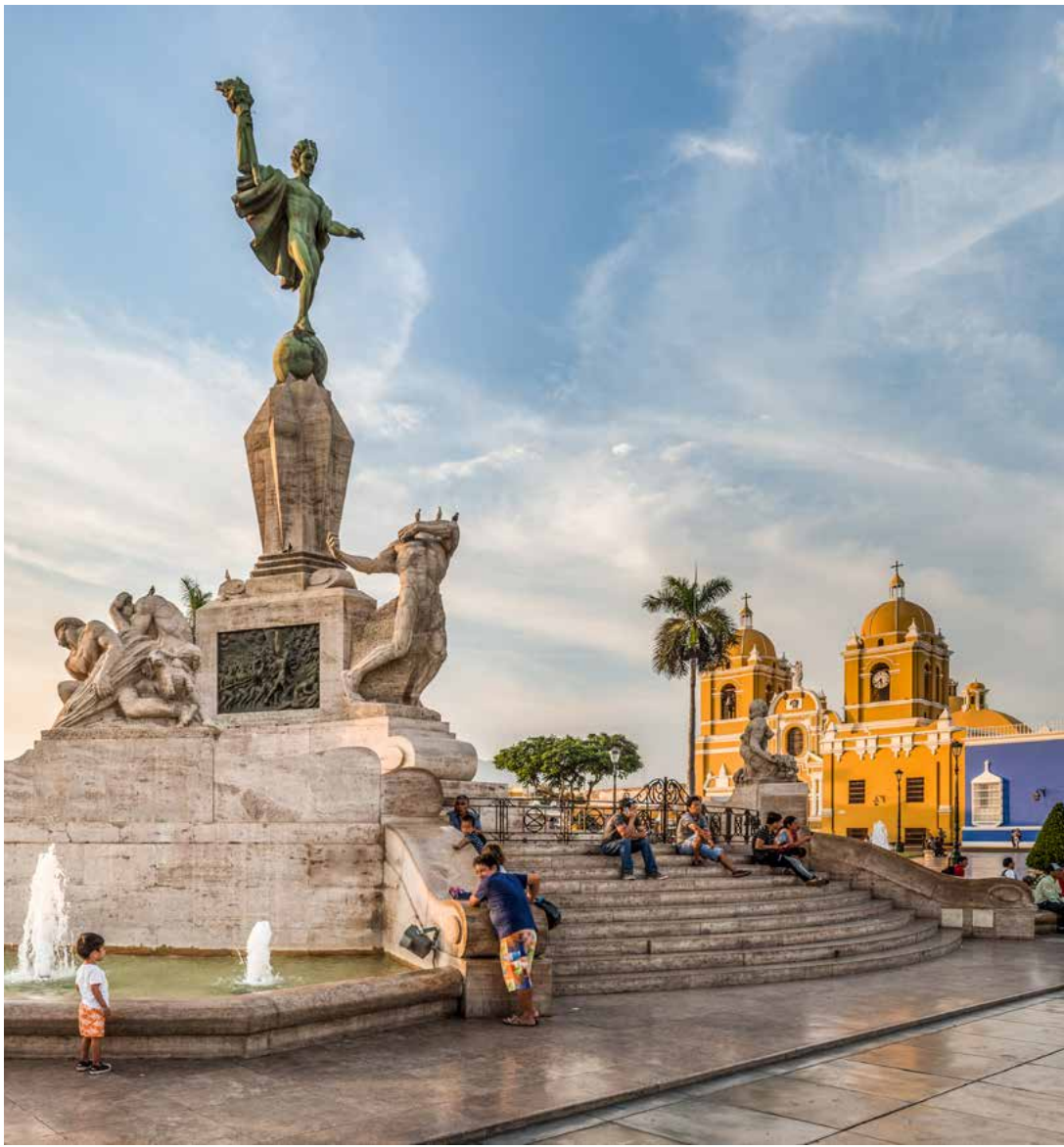
Trujillo Main Plaza