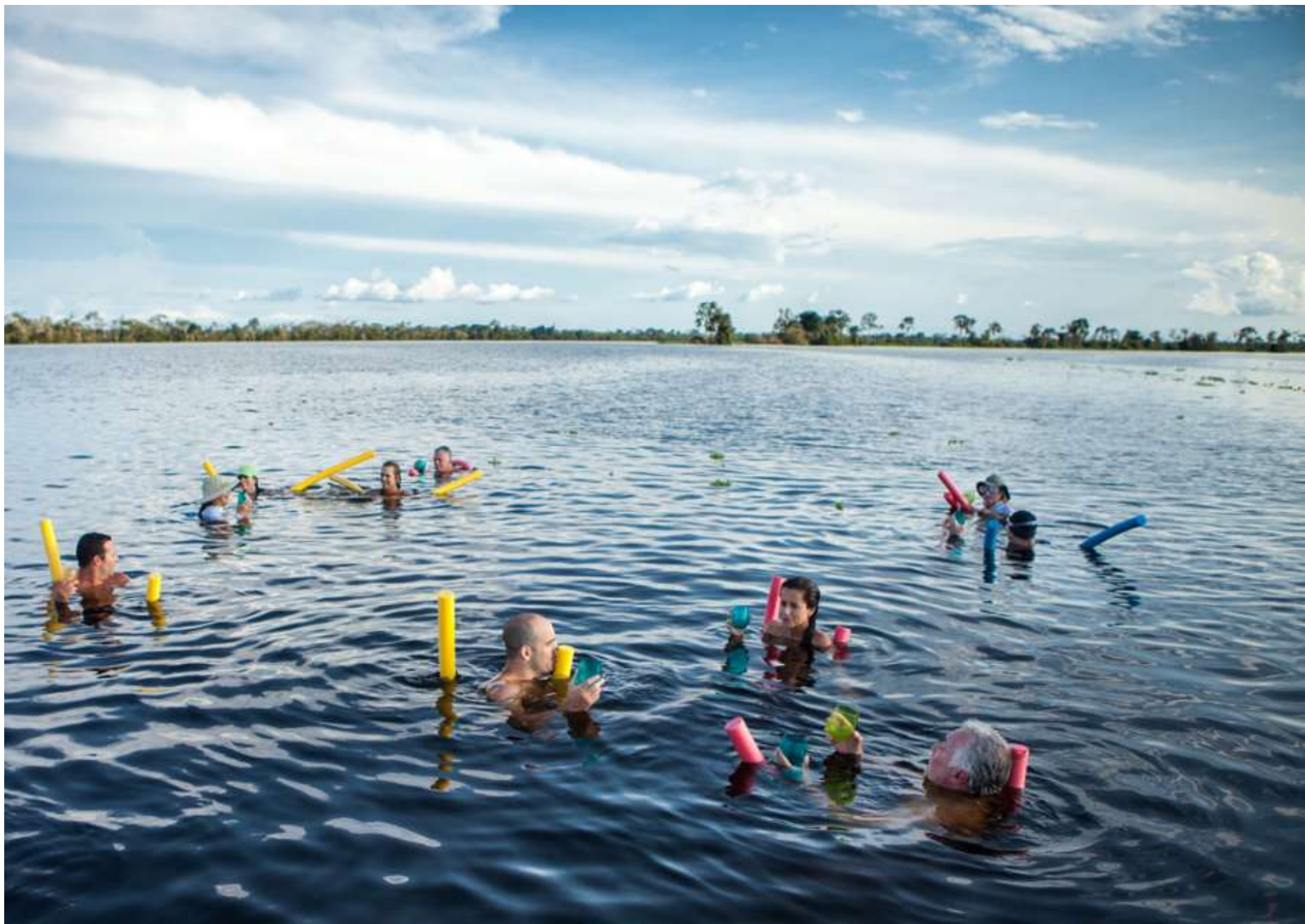
Swimming - Amazonas River