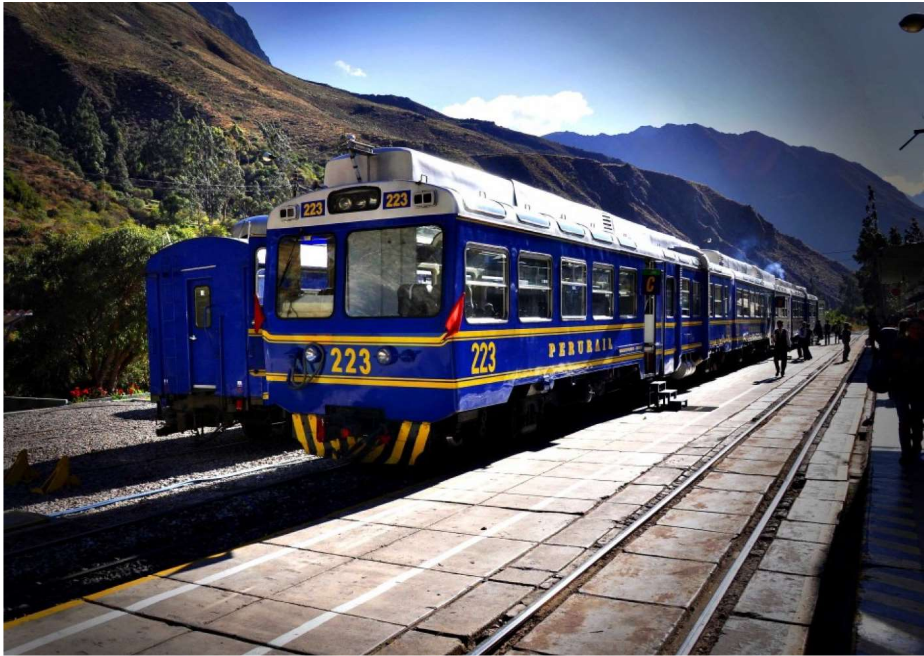
Ollantaytambo Train station