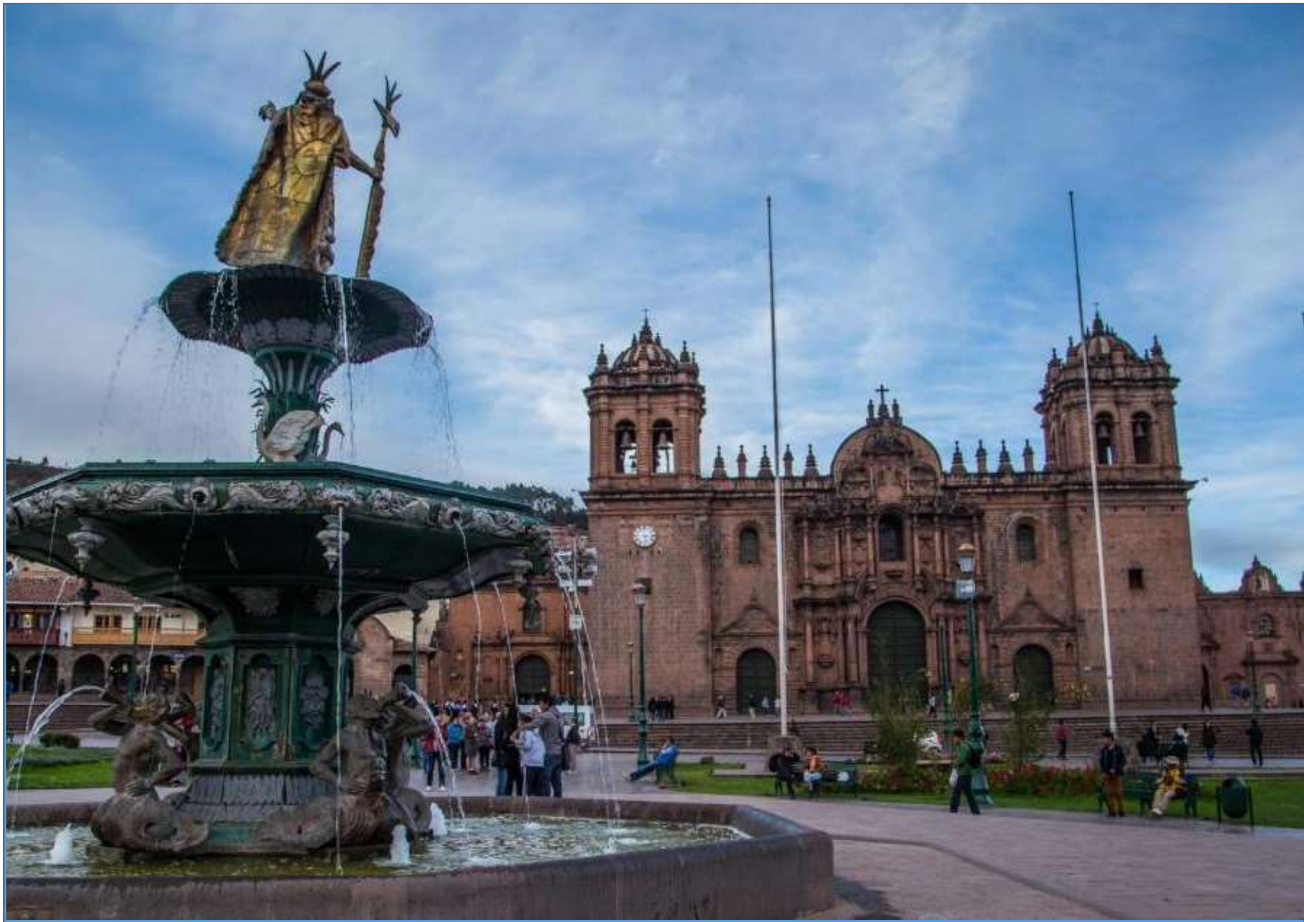
Cusco Main Square