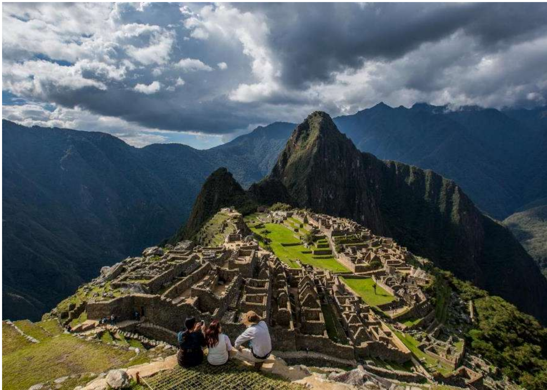
Machu Picchu Citadel