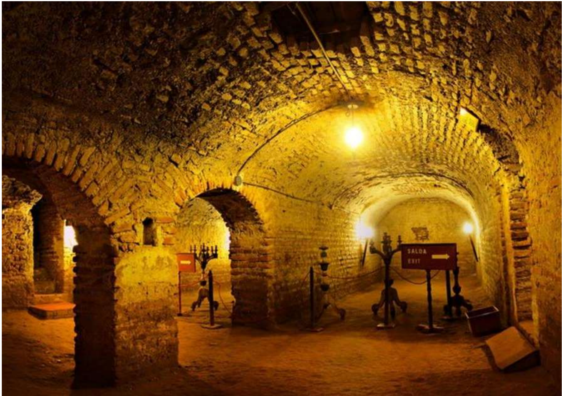
San Francisco Catacombs