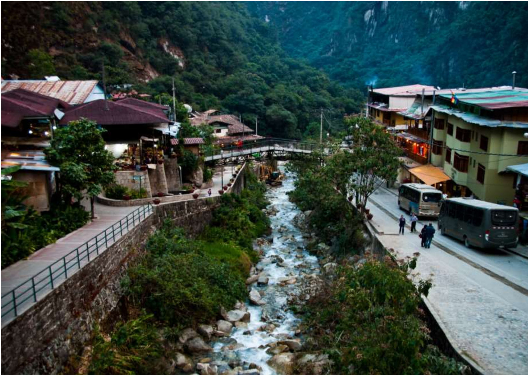
Aguas Calientes Town