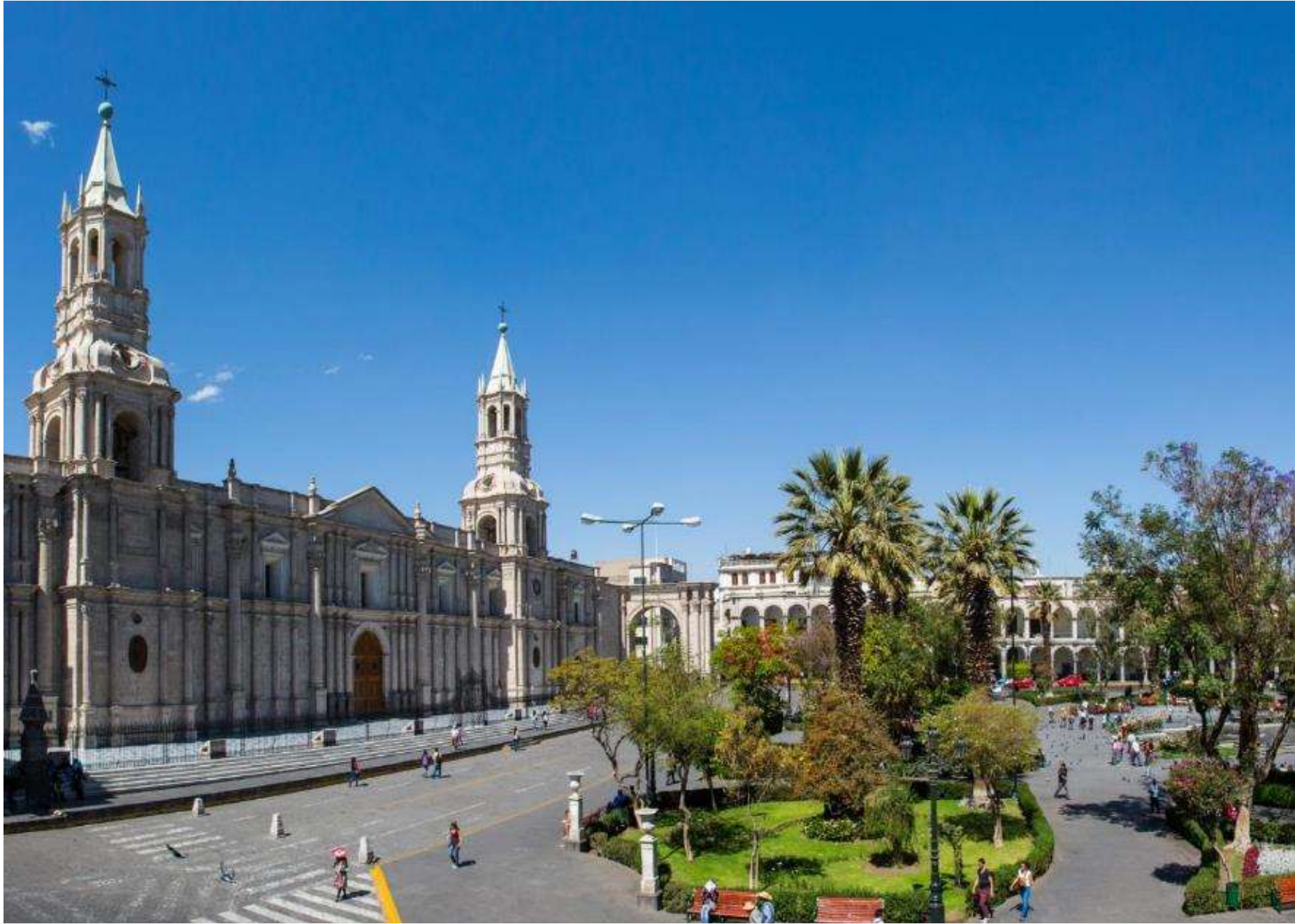
Arequipa Main Square