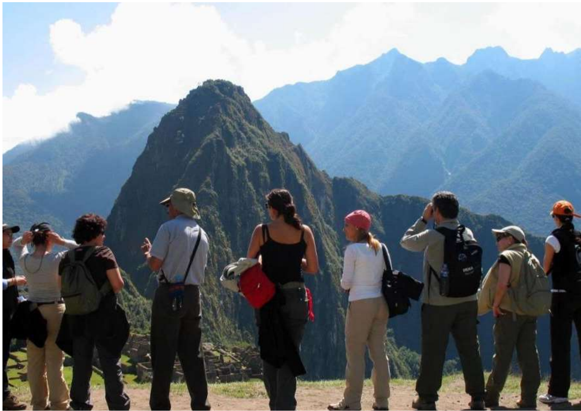
Machu Picchu Citadel