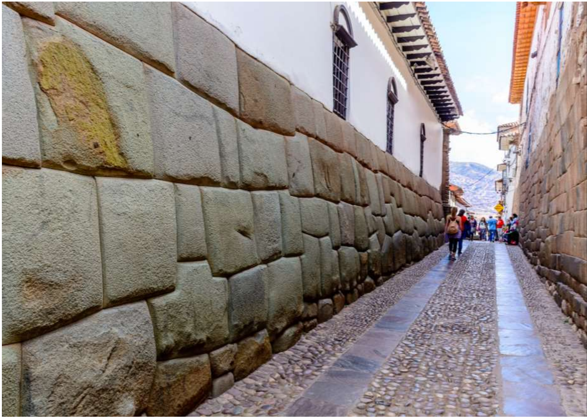
Hatun Rumiyoç Street – 12 angle stone