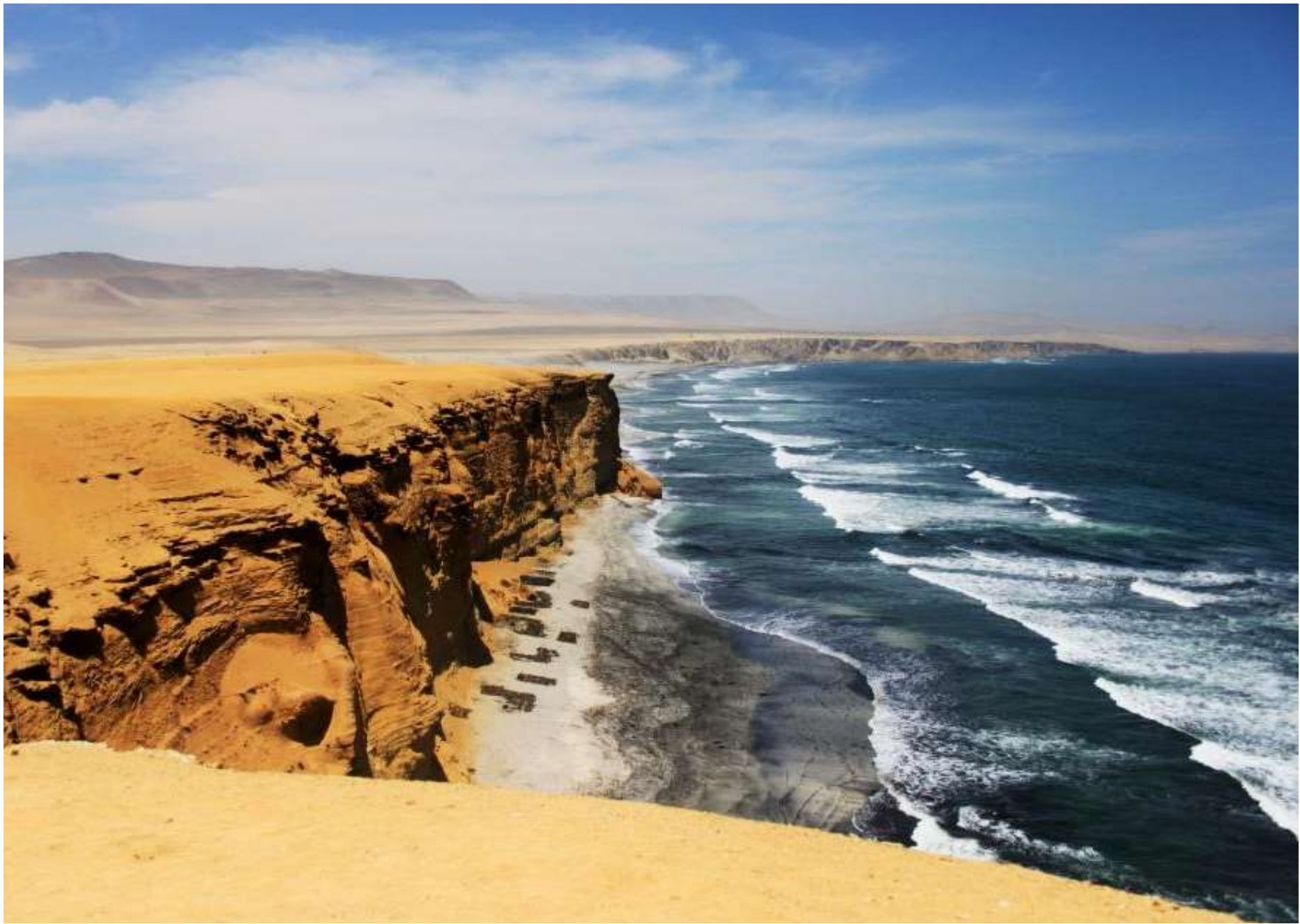
Paracas National Reserve