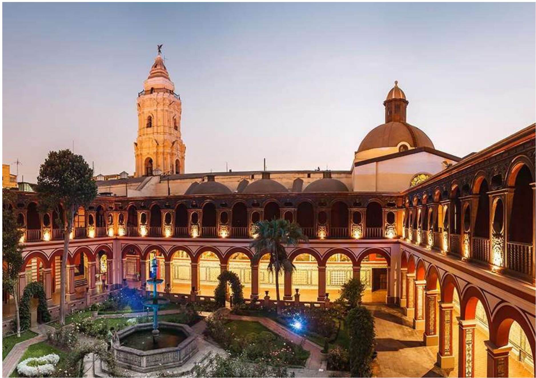
Santo Domingo Convent