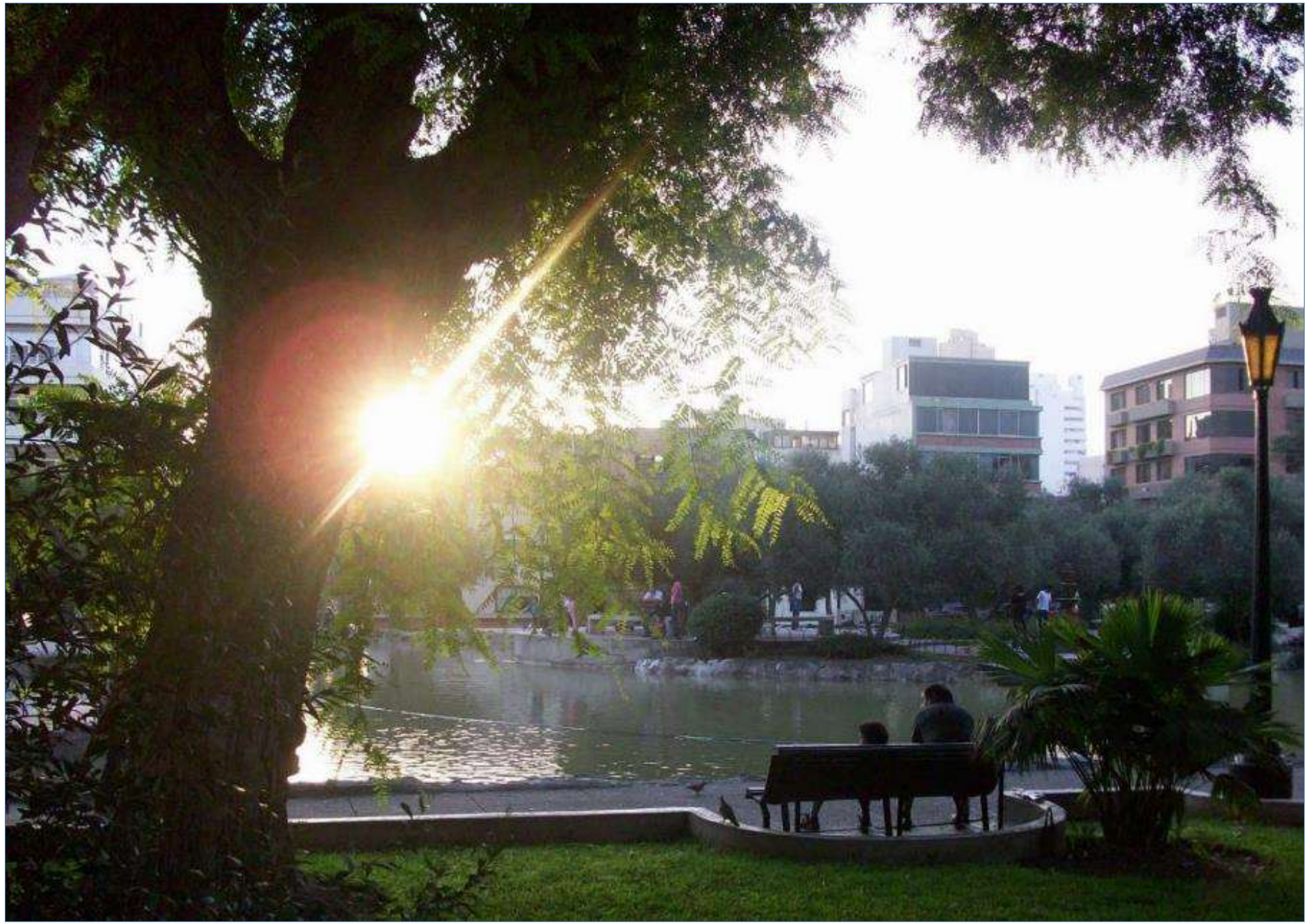
El Olivar Park – San Isidro District