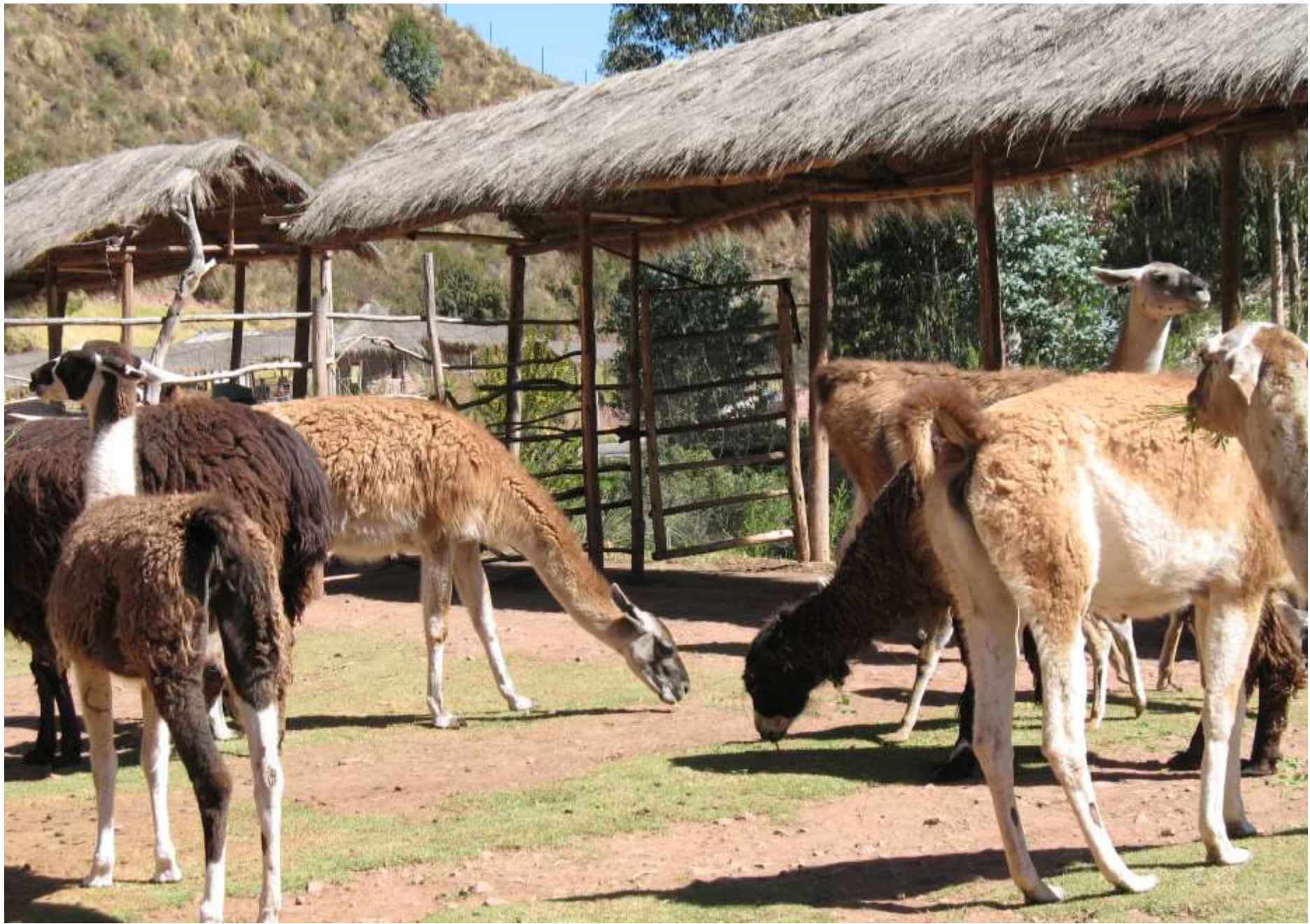
Awanacancha Textile Center