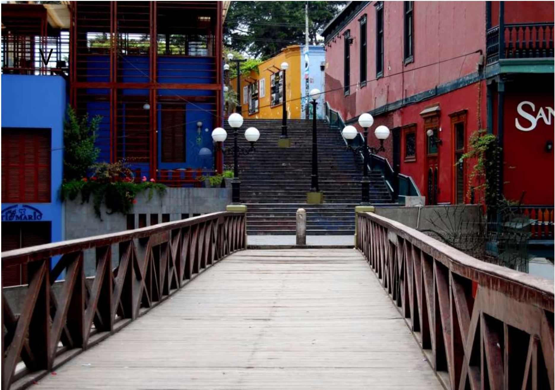
◦Barranco Bohemiam District