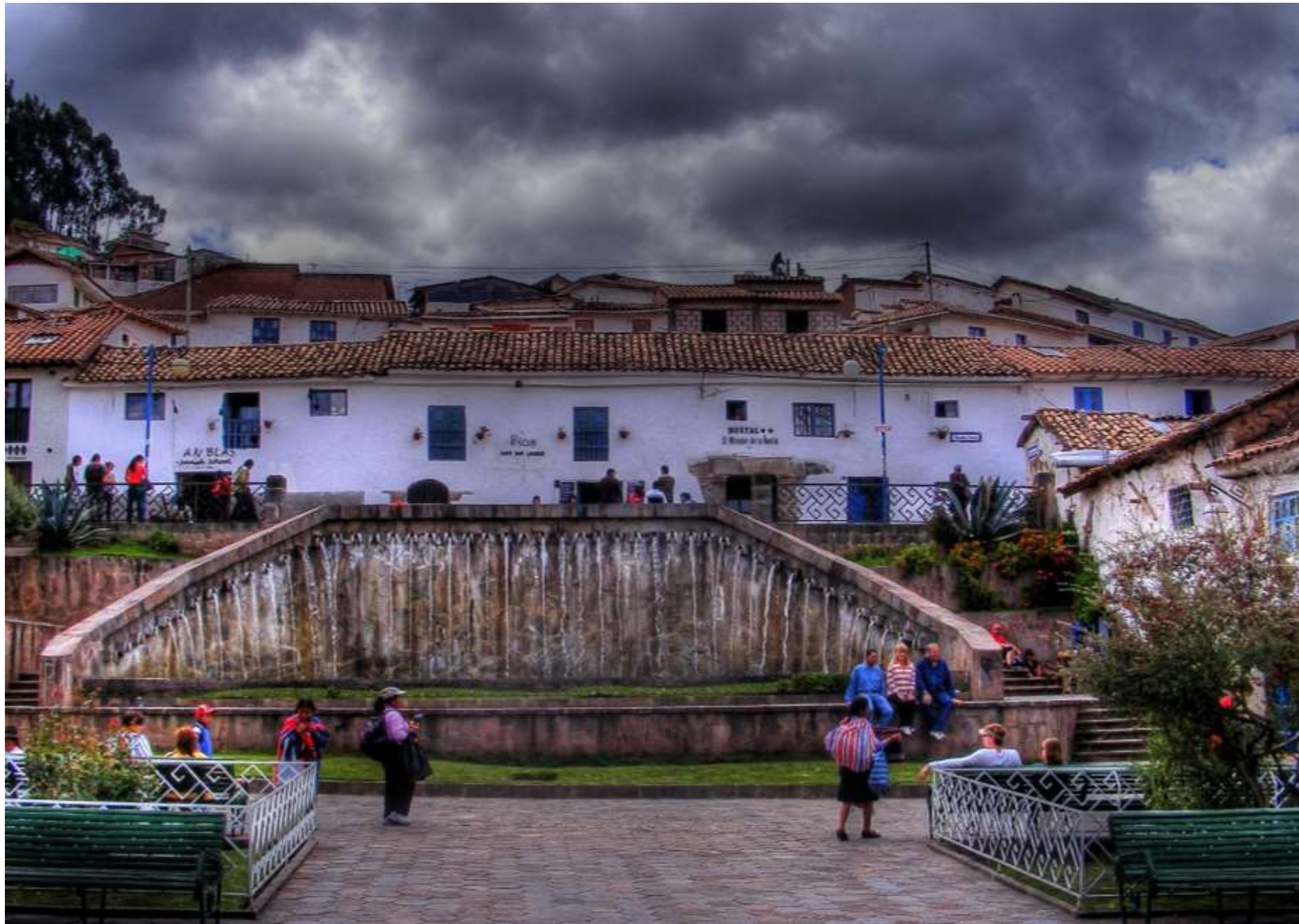
San Blas Quarter