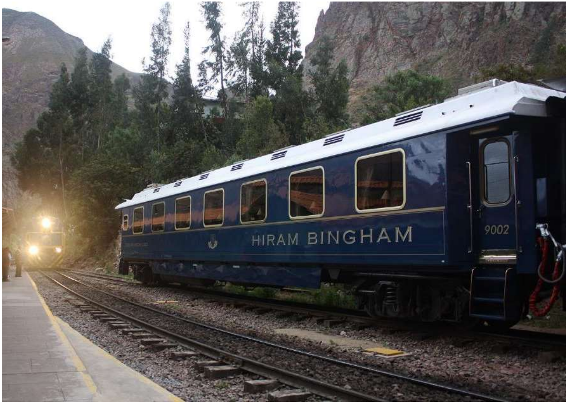
Hiram Bingham train