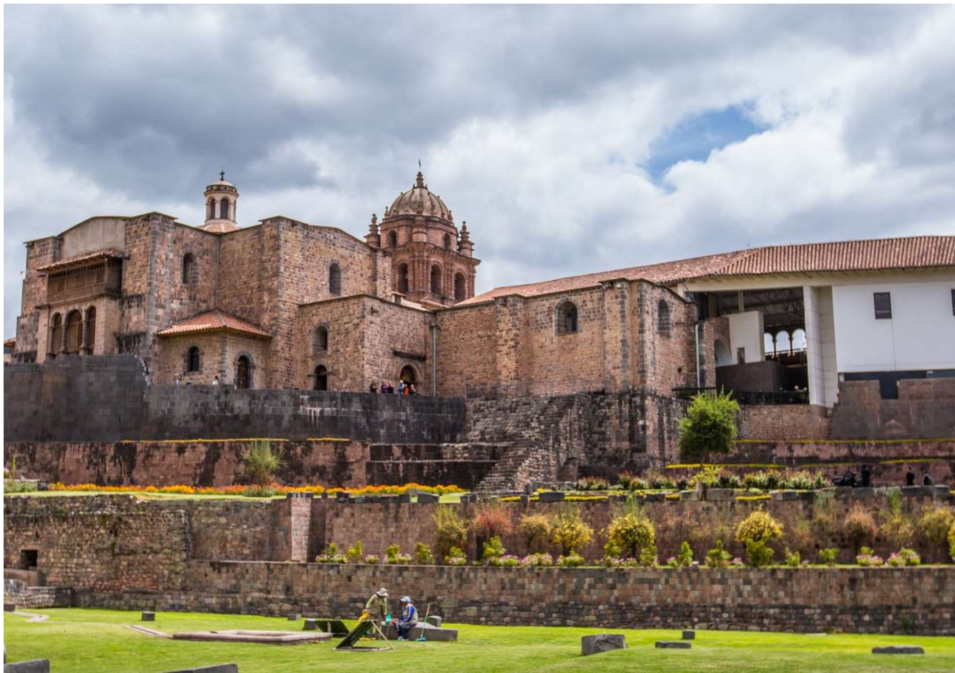
Koricancha Temple & Santo Domingo Convent