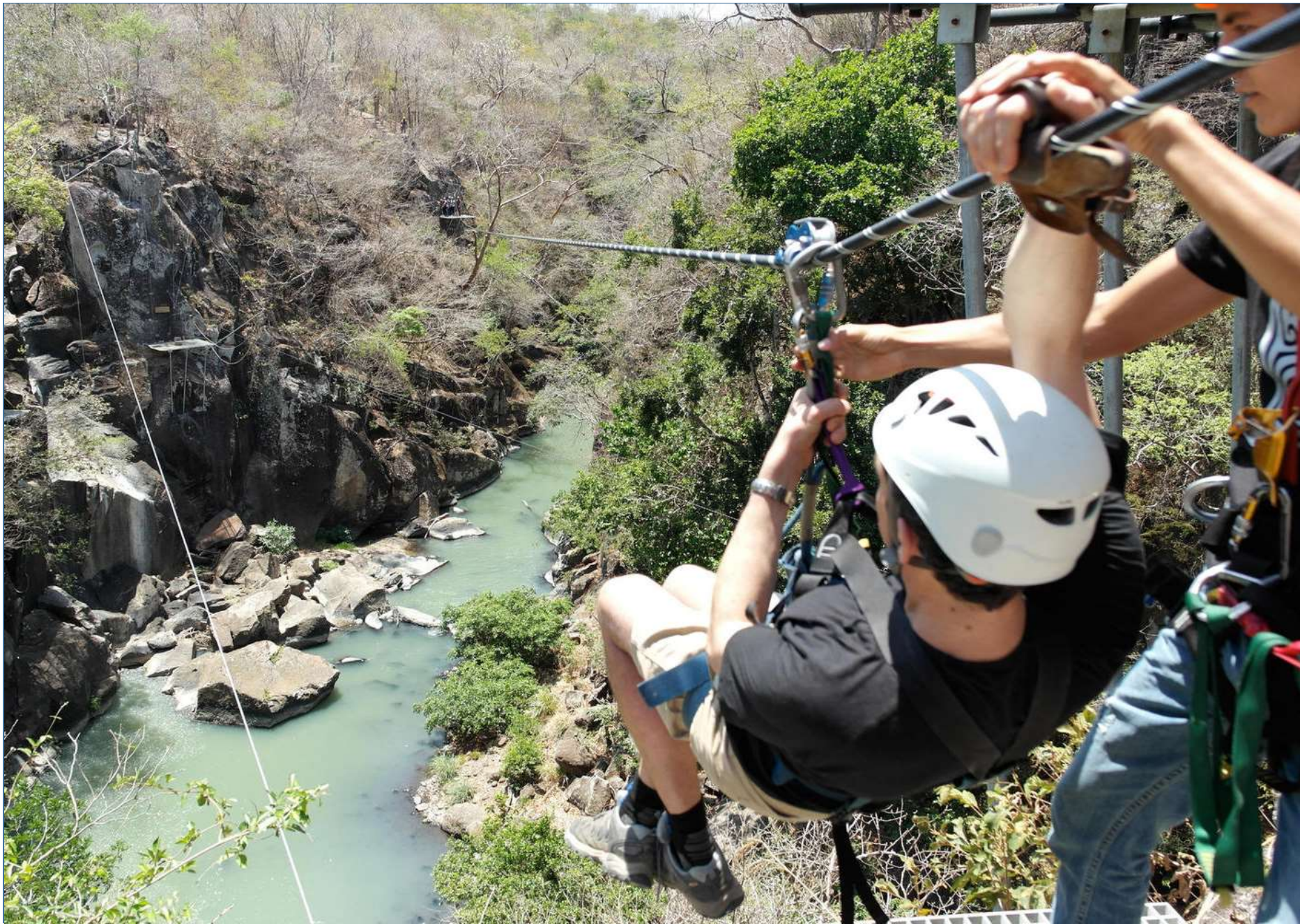
Soft adventure activities