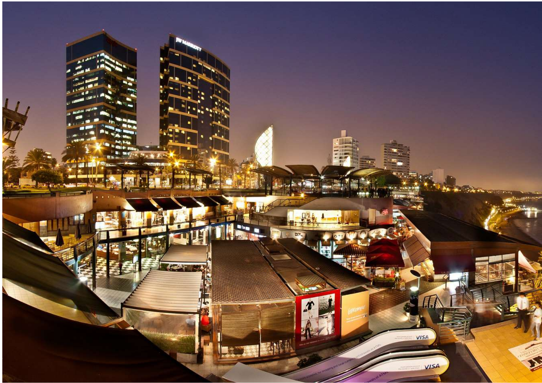
Larcomar – Miraflores District