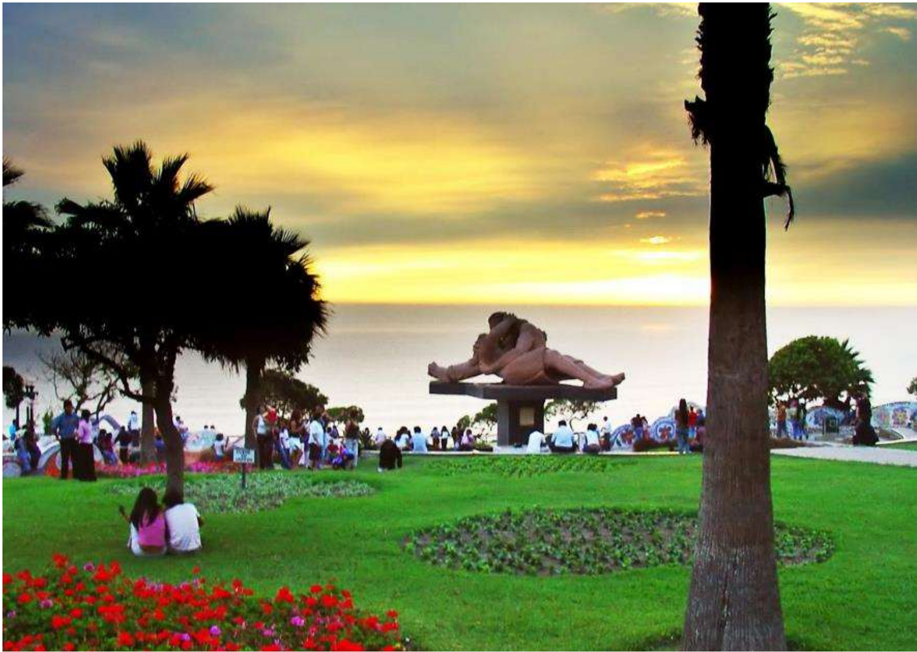
Love Park - Miraflores District