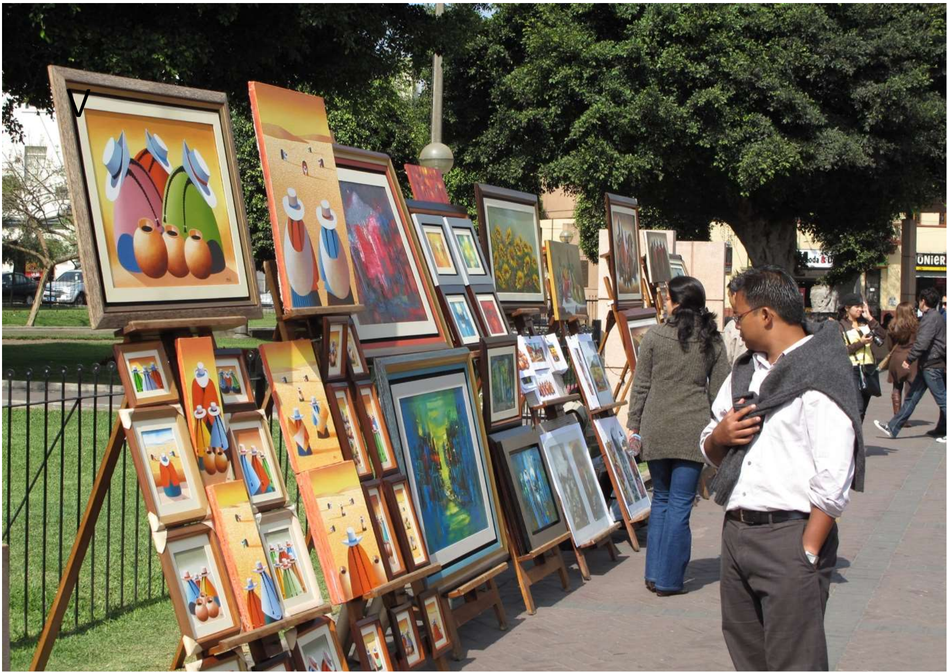
Kennedy Park - Miraflores District