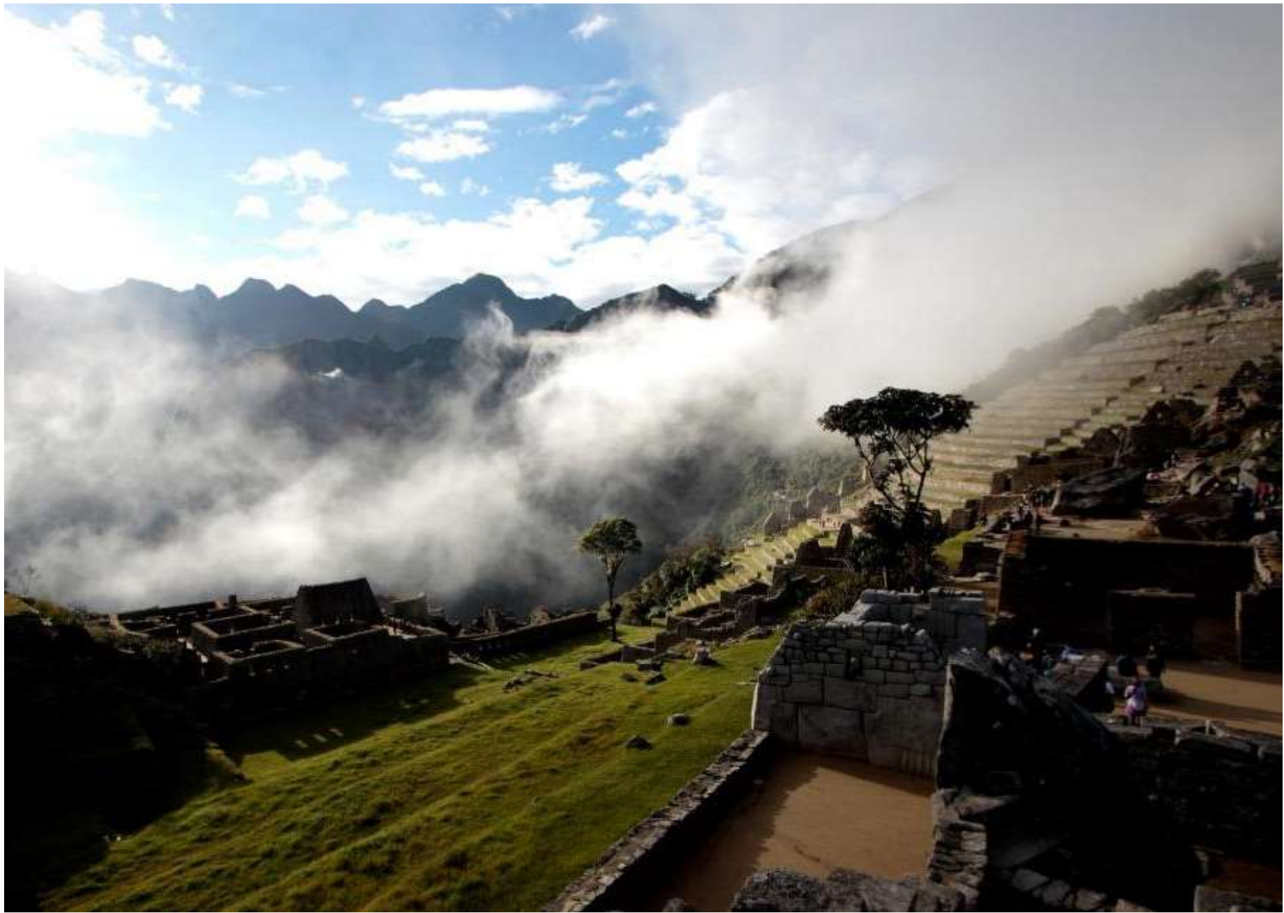
Machu Picchu Citadel