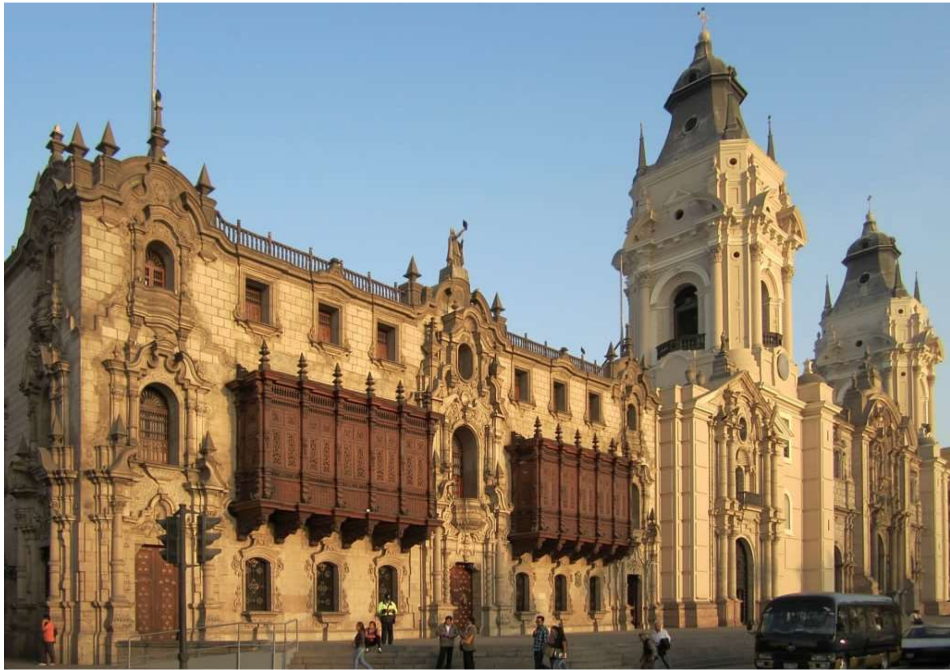
Cathedral of Lima