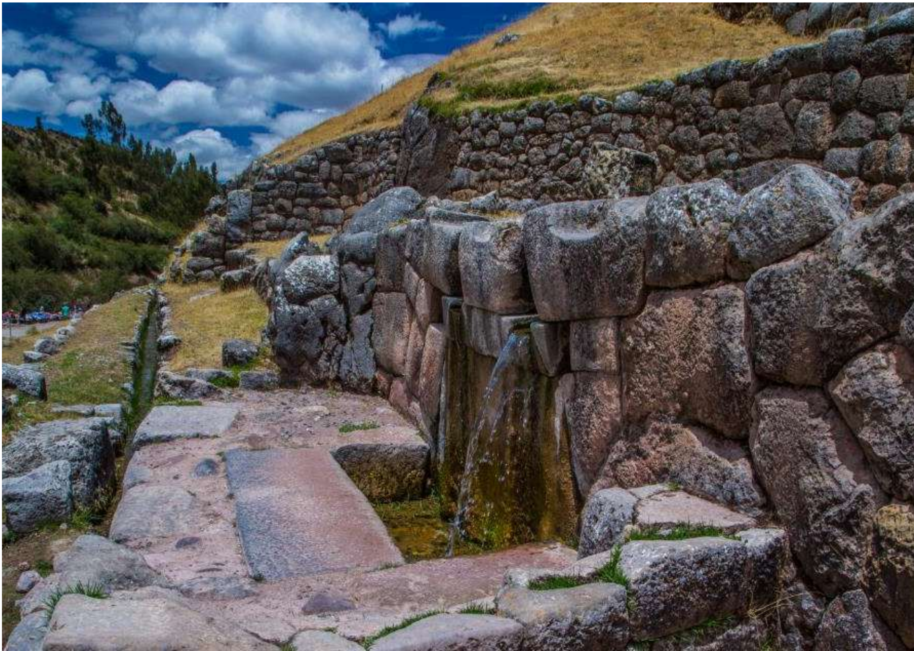
Cusco Surrounding Ruins