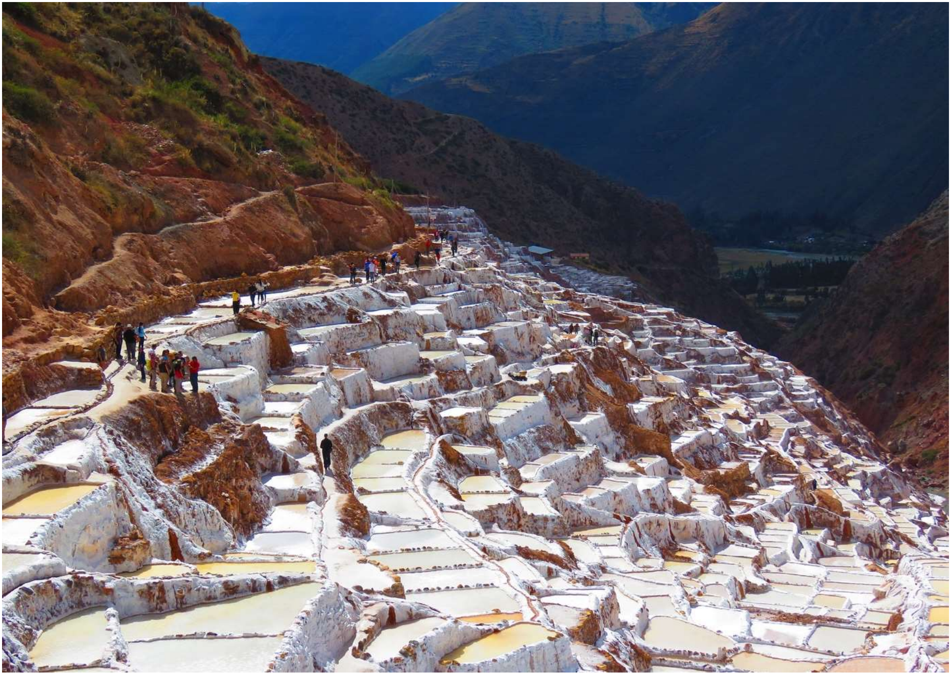
Salt Mines of Maras