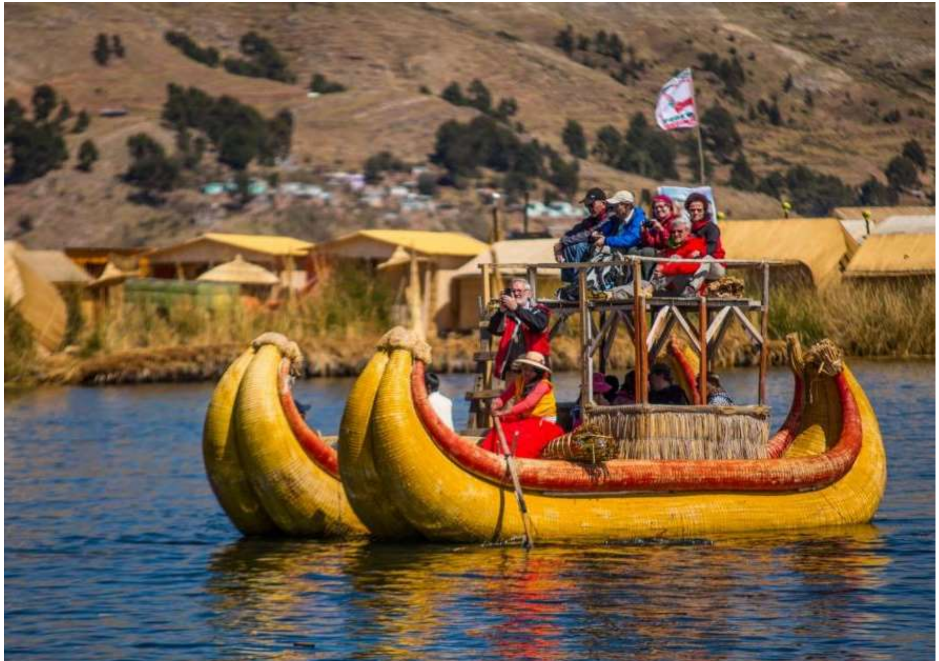
Uros Floating Island