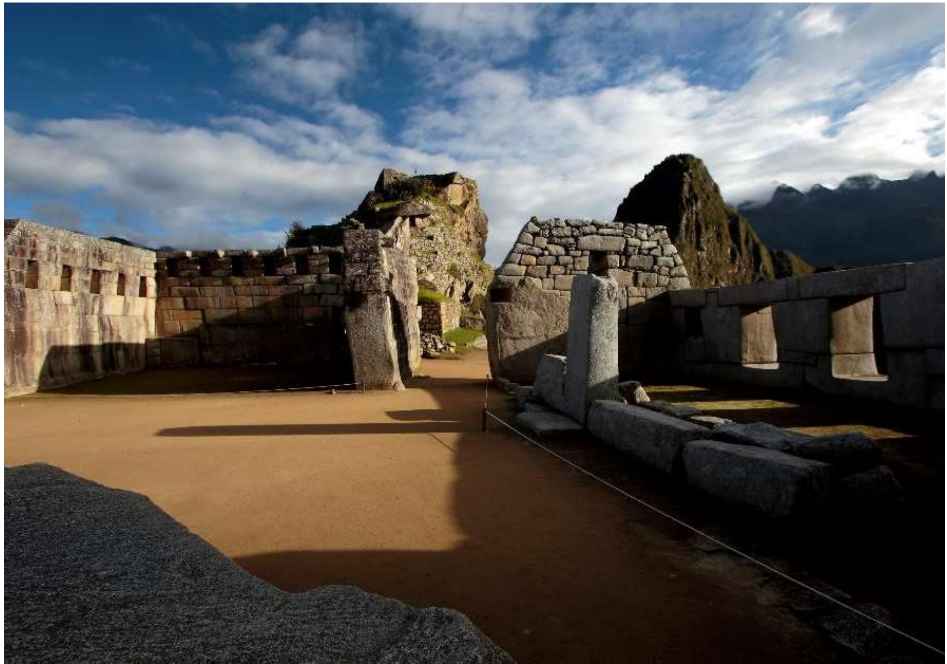
Machu Picchu Citadel