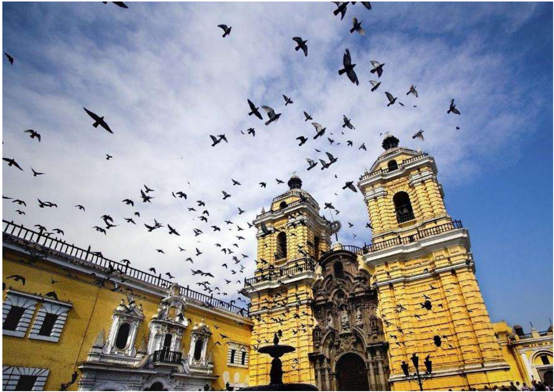
San Francisco Convent