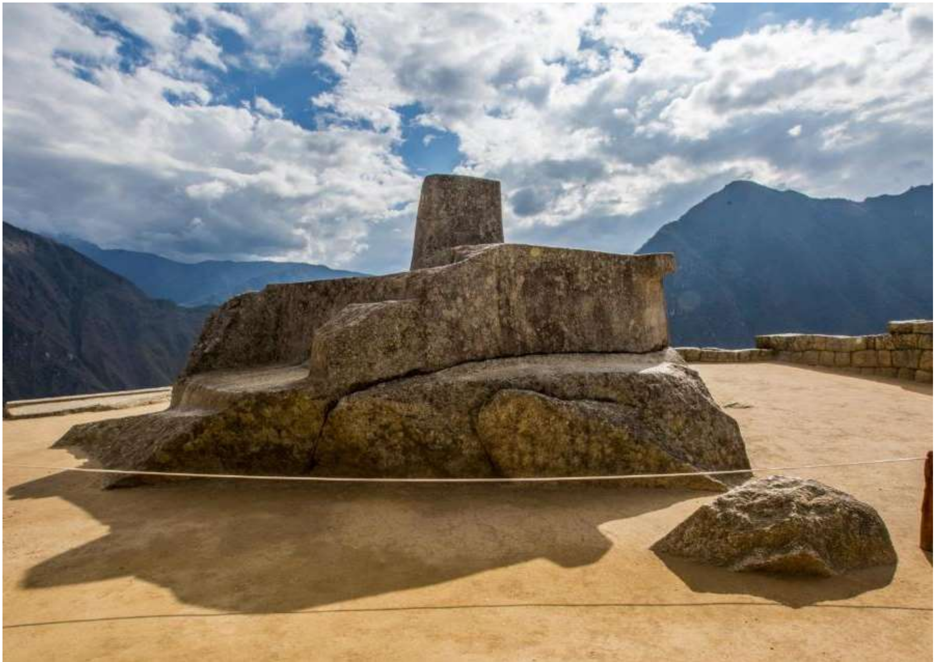
Machu Picchu Citadel