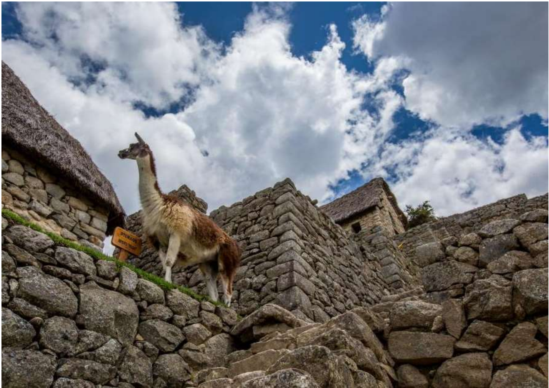
Machu Picchu Citadel