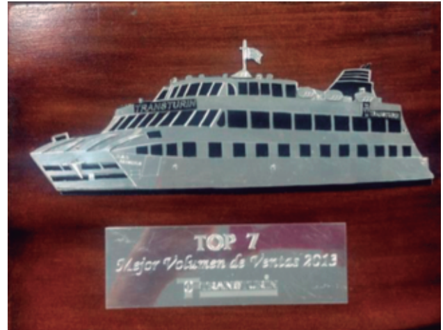
Transturin, Top producer 1st place - year 2013