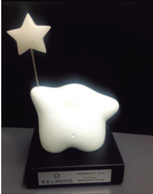
Belmond Hotels, Top producer 5th place - year 2014