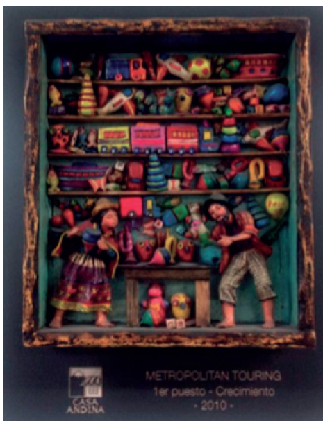
Casa Andina Hotels, Top producer 1st place, growth year 2010