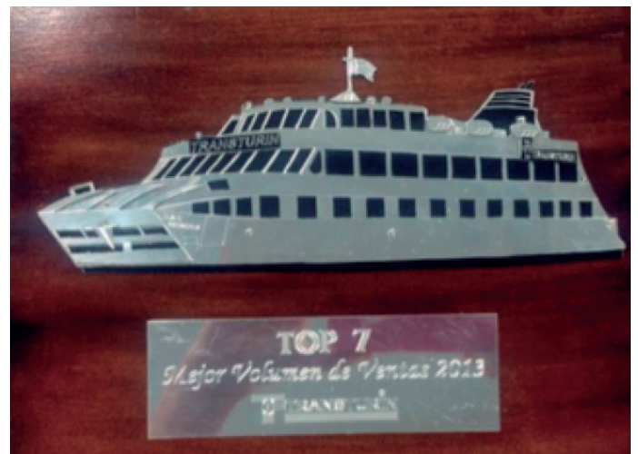
Transturin, Top producer 1st place year 2013