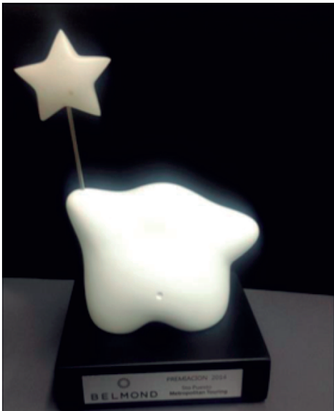
Belmond Hotels, Top producer 5th place - year 2014