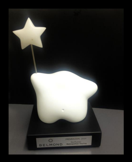
Belmond Hotels, Top producer 5th place - year 2014