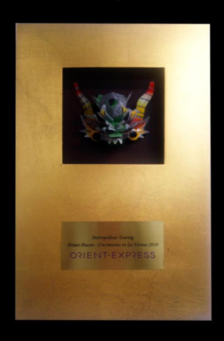
Orient Express Hotels, Top producer 1st place, growth - year 2010