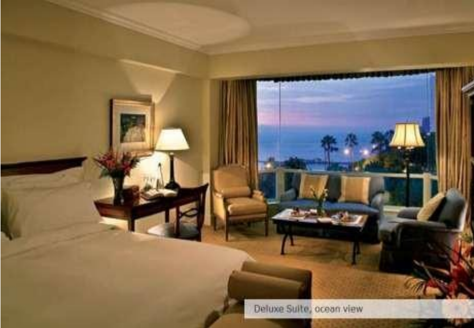
Deluxe Suite, ocean view