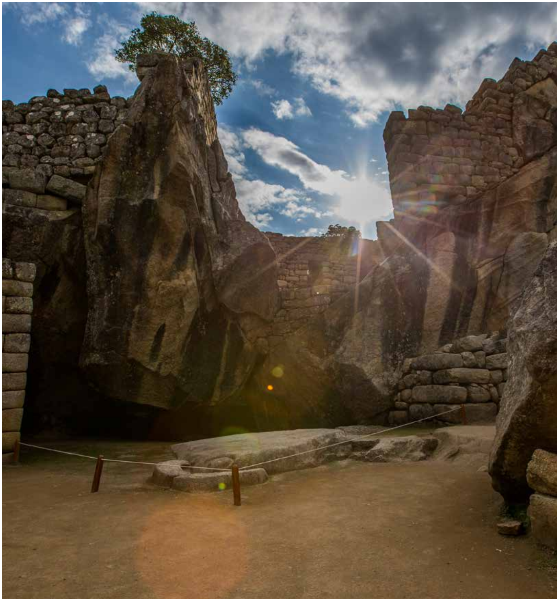
Machu Picchu Citadel