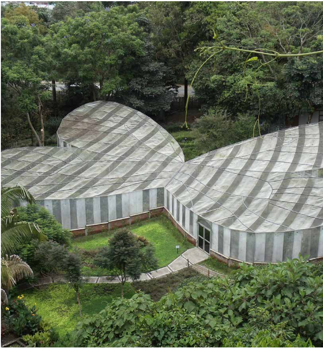
Botanical Garden of Quindio