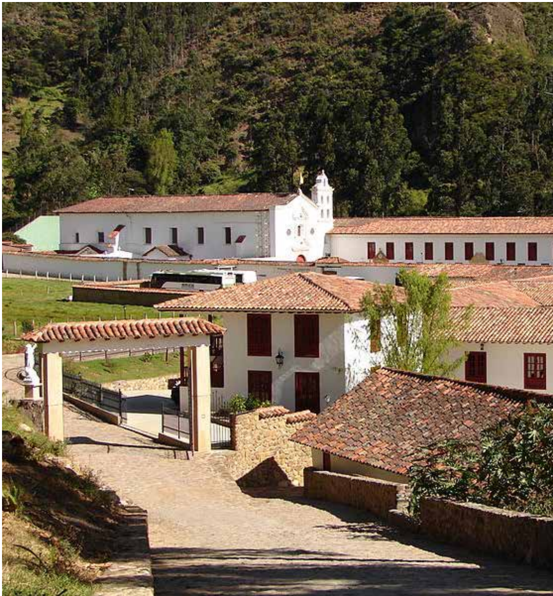
Monasterio La Candelaria