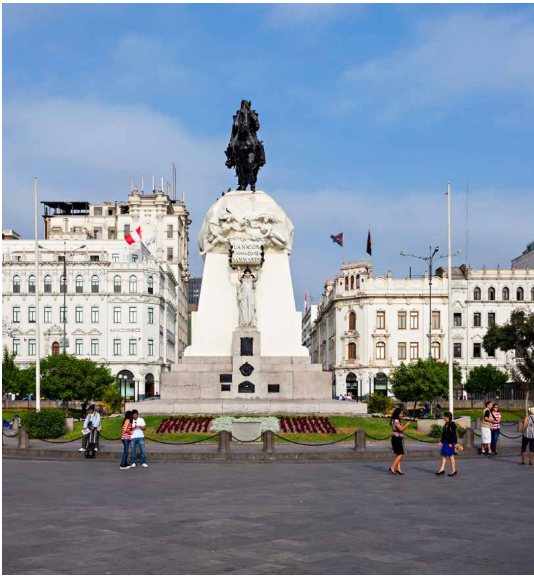
Plaza San Martín