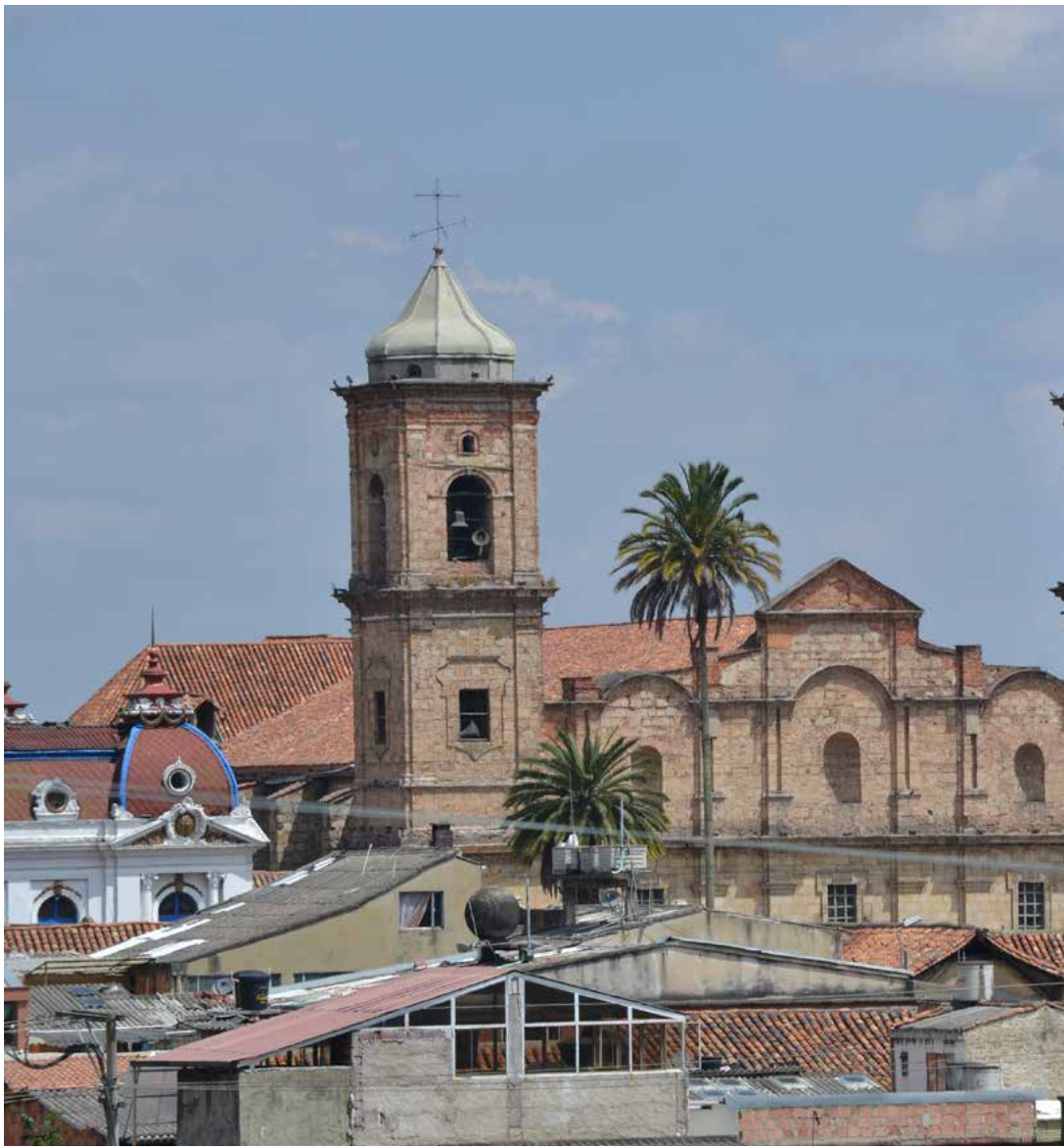
Zipaquirá's Salt Cathedral