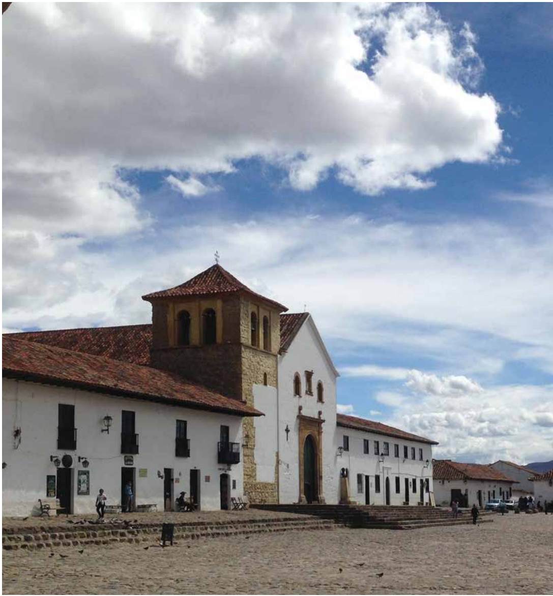
Villa de Leyva