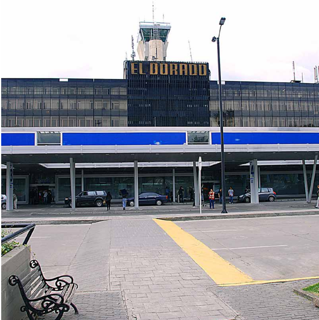
El Dorado International Airport