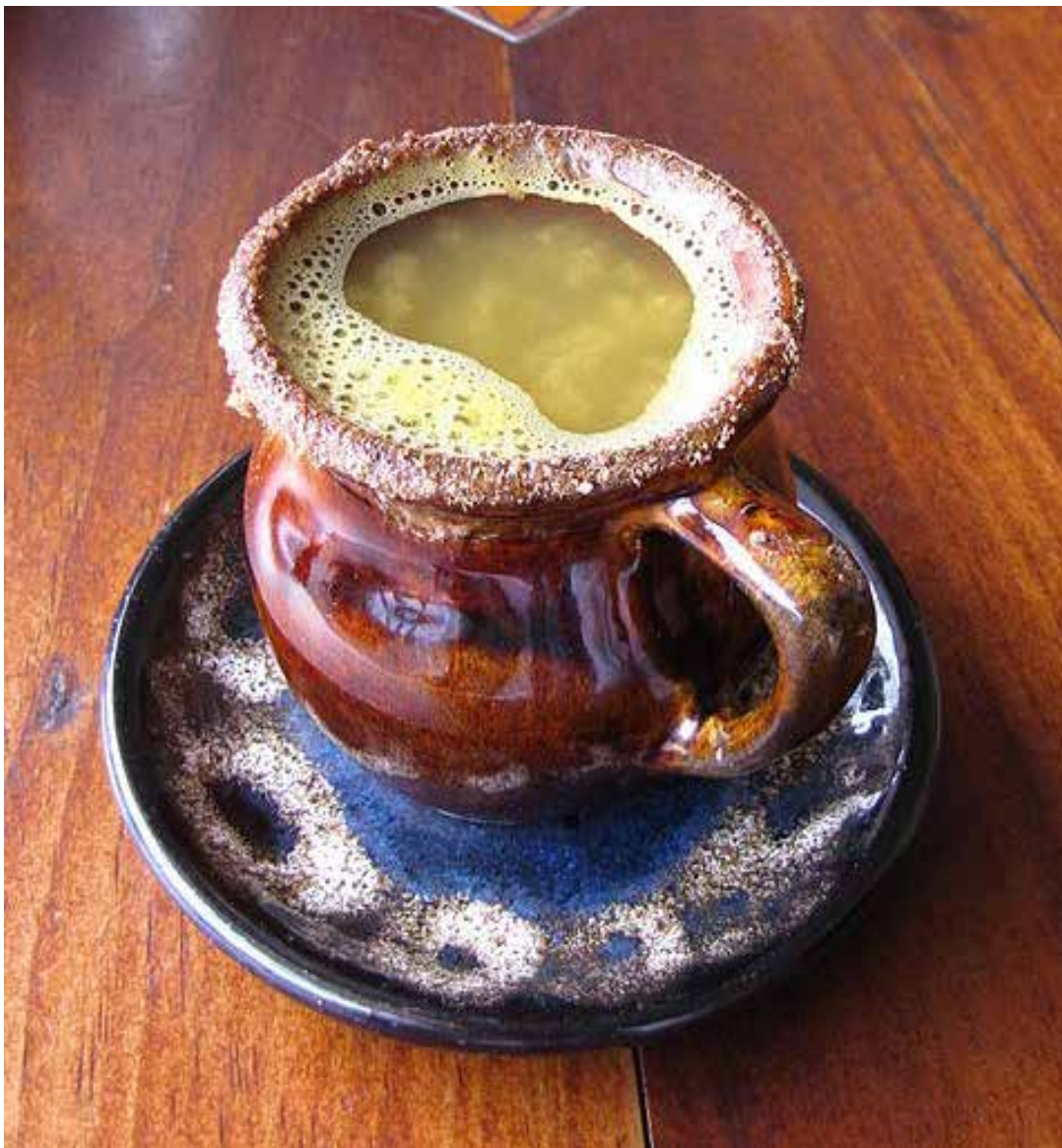
Canelazo, a colombian driink