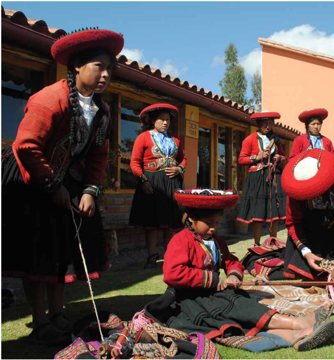
Nilda's Traditional Textile and Weaving Center