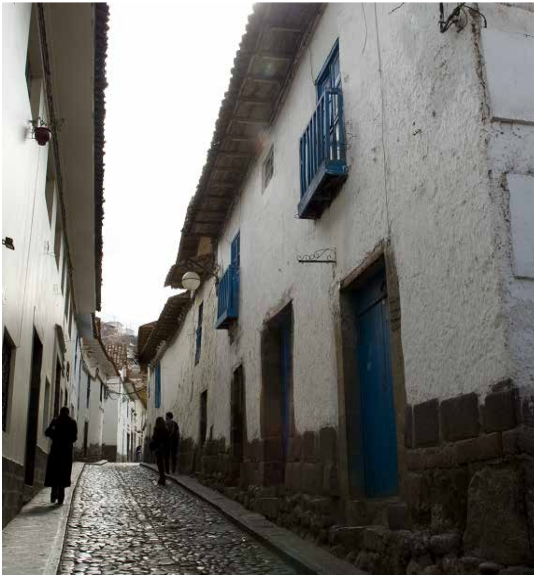
San Blas District