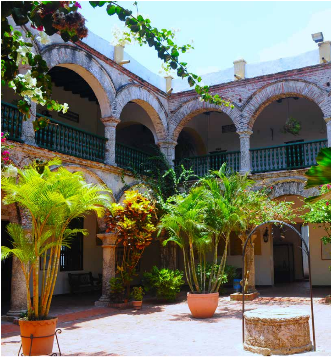
Convento de la Popa