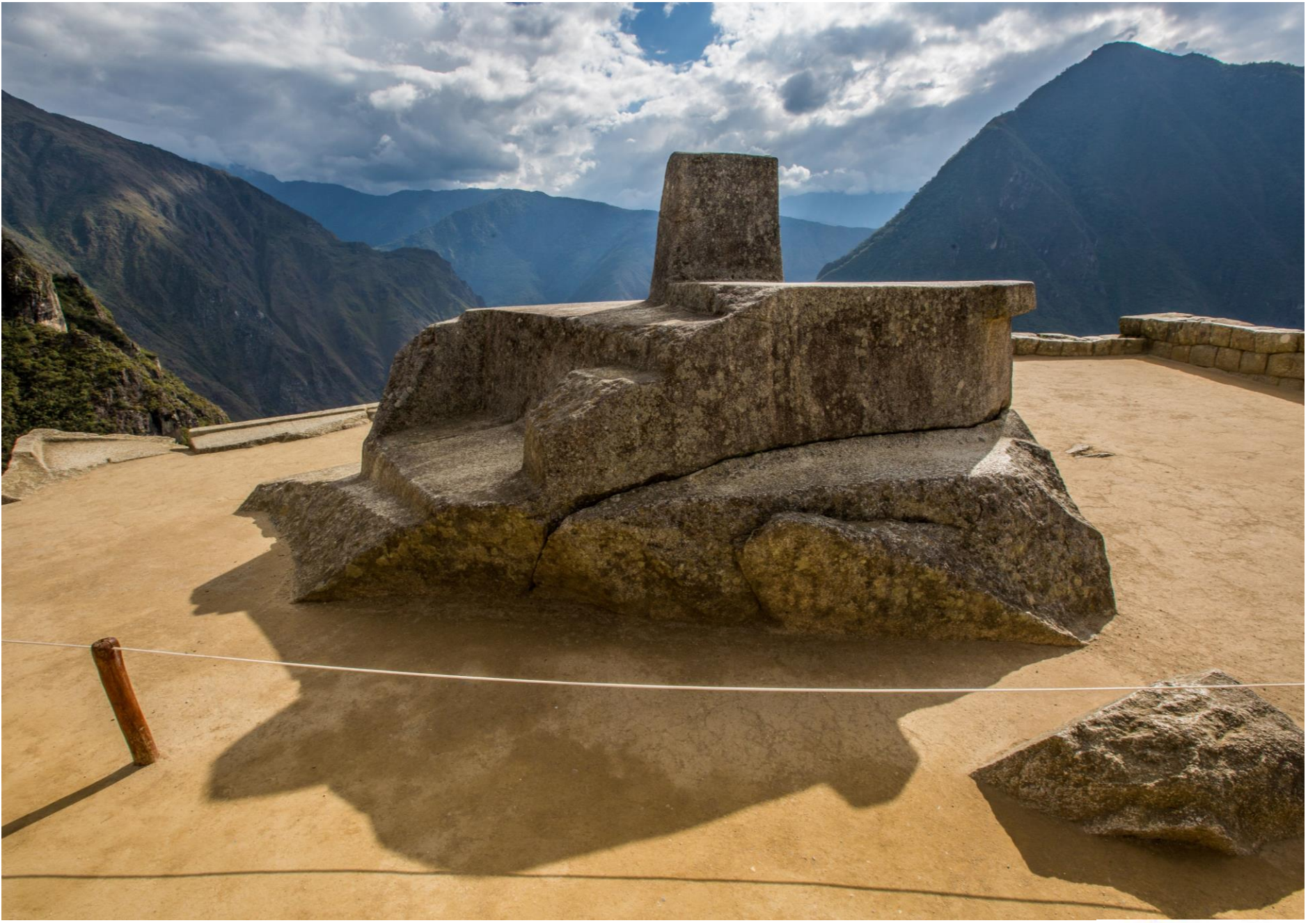
Machu Picchu – The Sacred Sun Dial