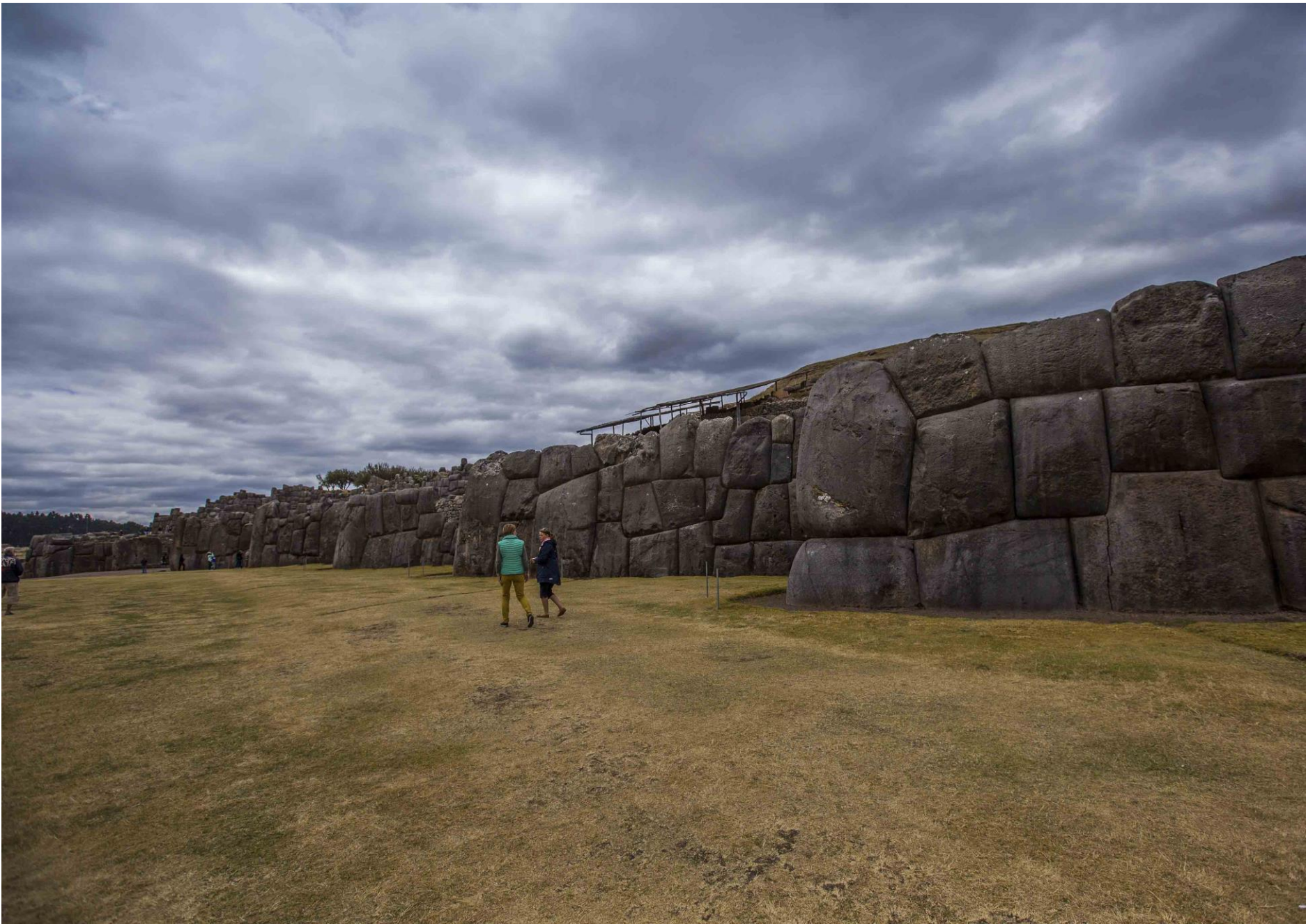
Sacsayhuaman Archaeological Site