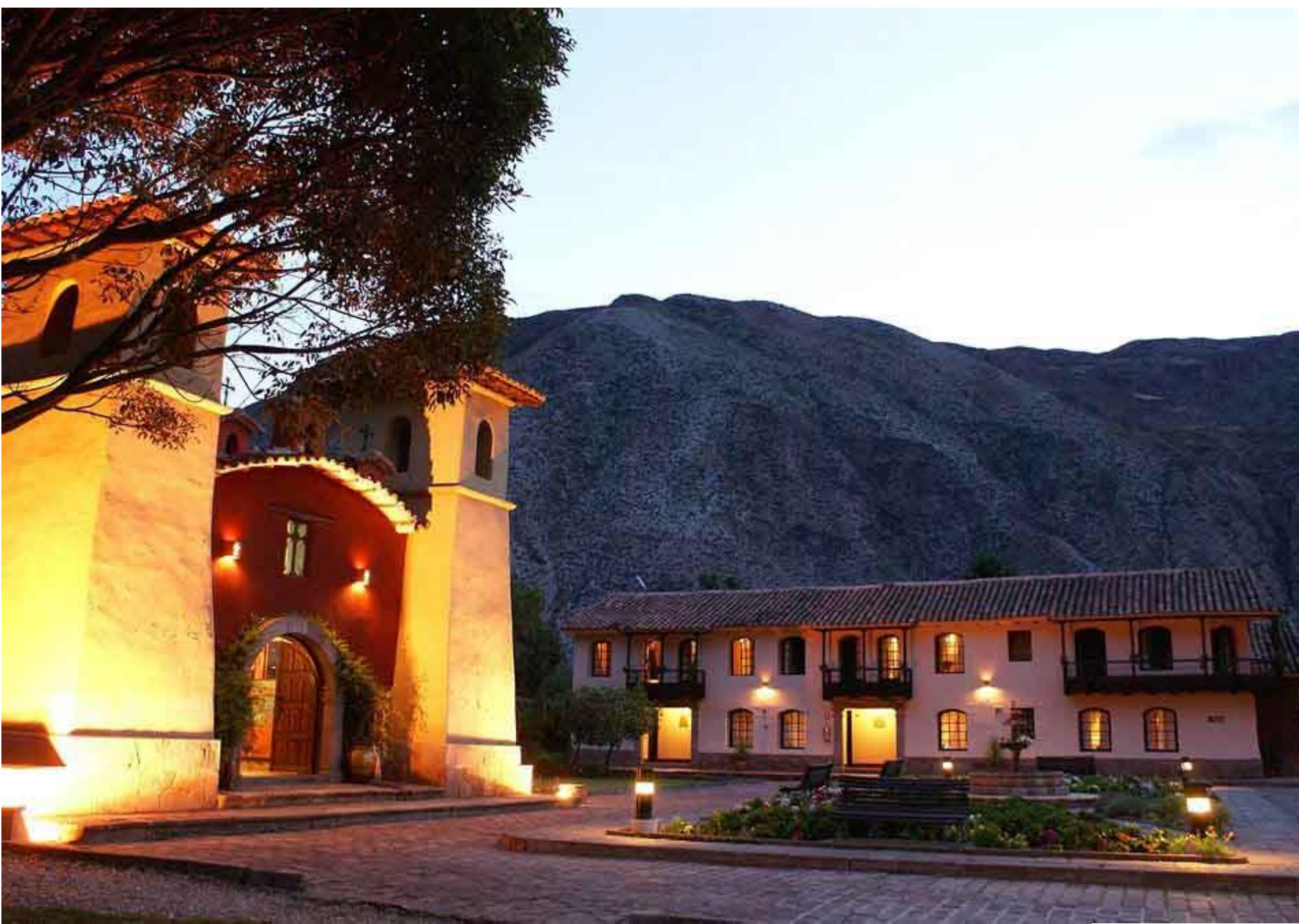
Sonesta Posada Yucay