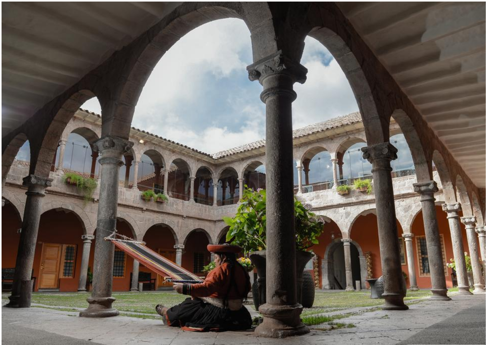
Costa del Sol Cusco Hotel