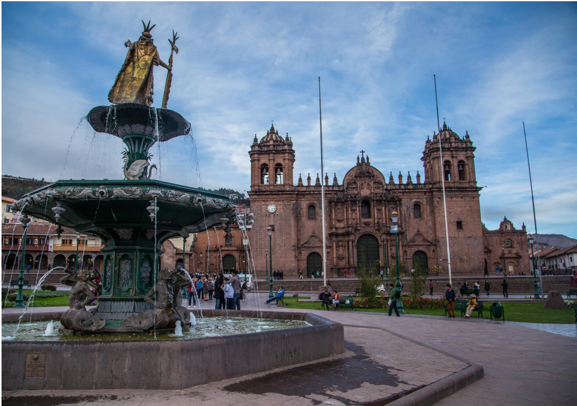
Cusco Main Plaza