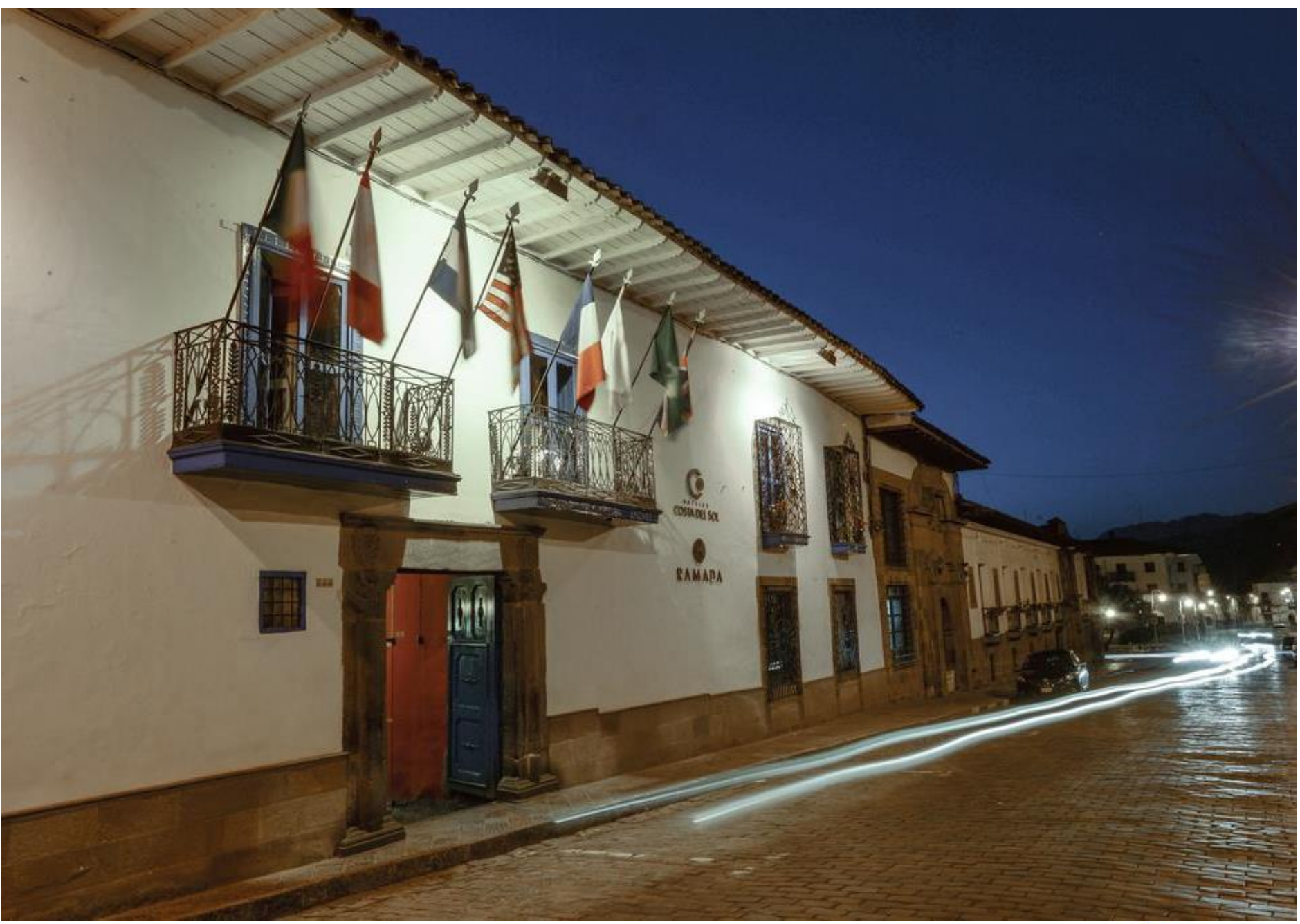
Costa del Sol Cusco Hotel