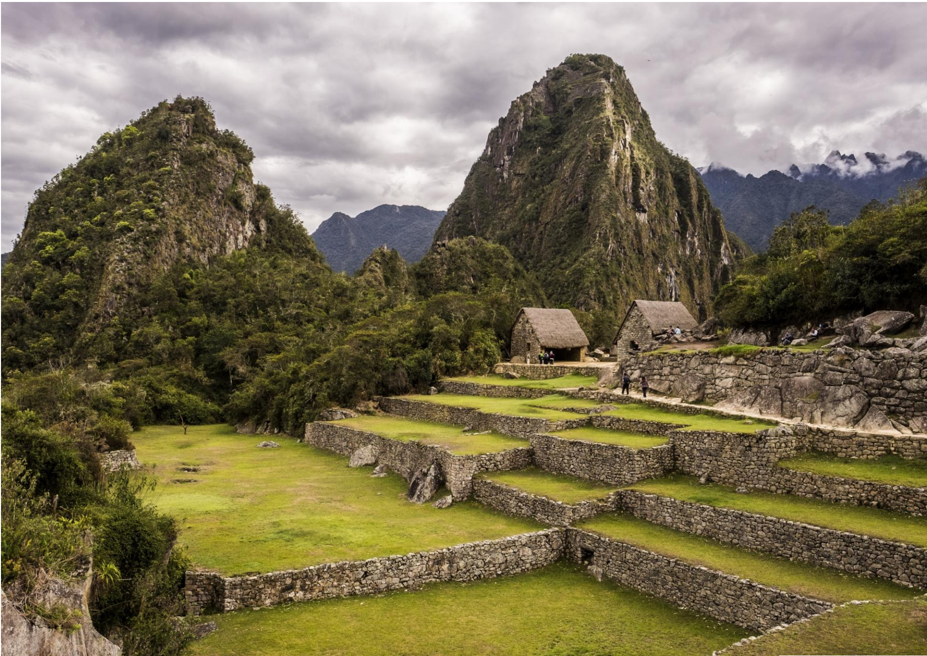
Machu Picchu Main Plaza