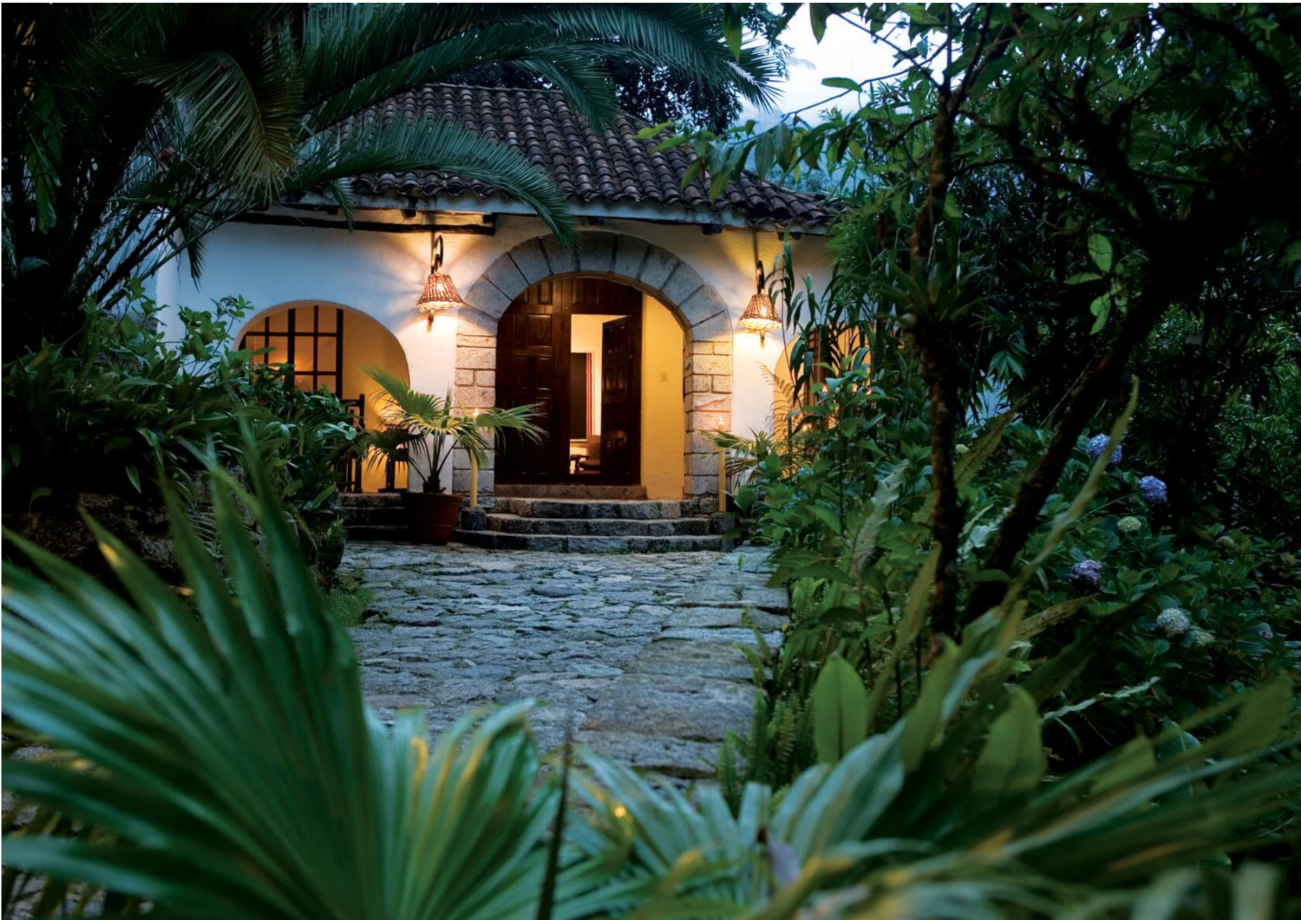
Inkaterra Machu Picchu Pueblo Hotel