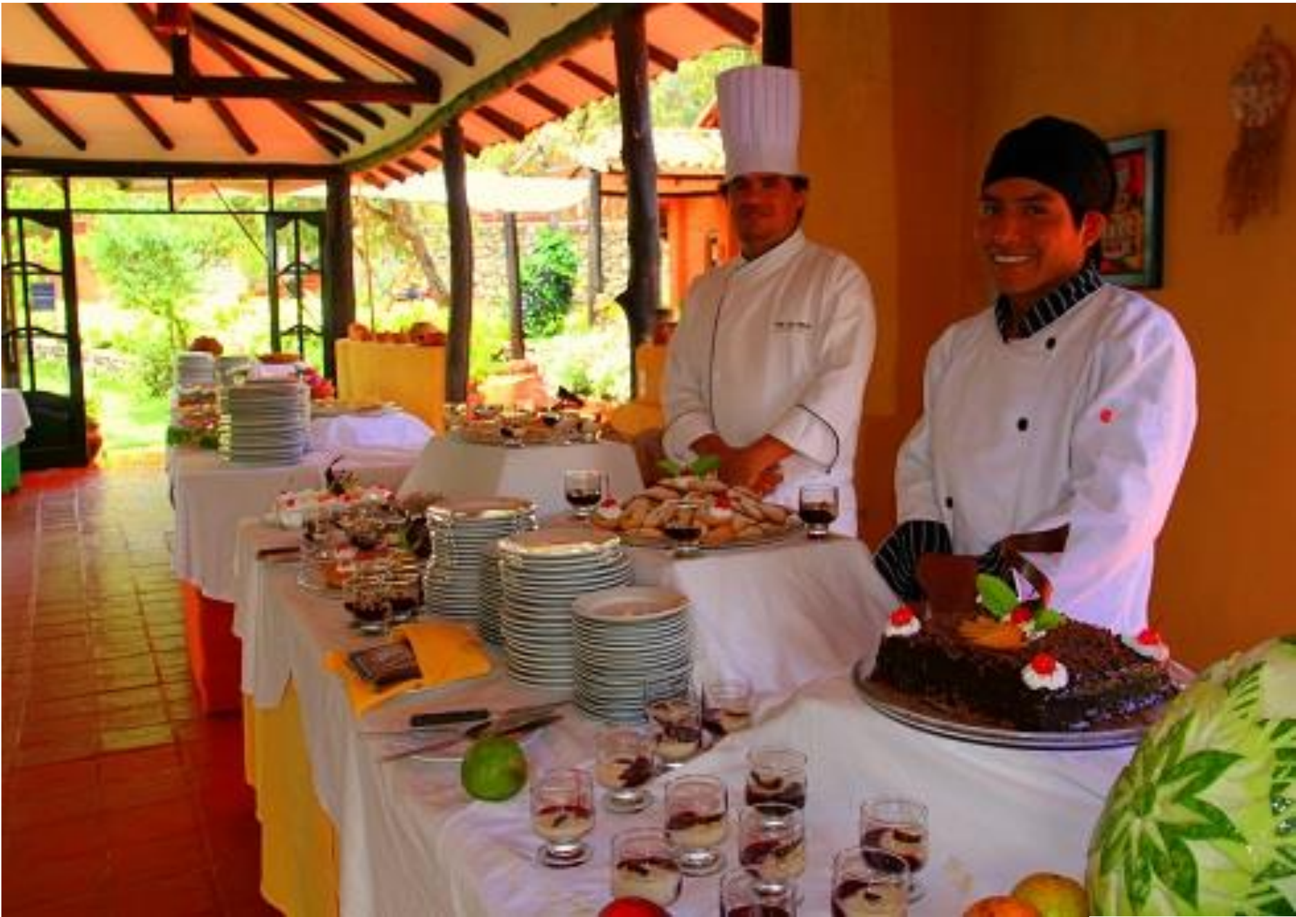
Buffet Lunch Countryside – Muña Urubamba Restaurant