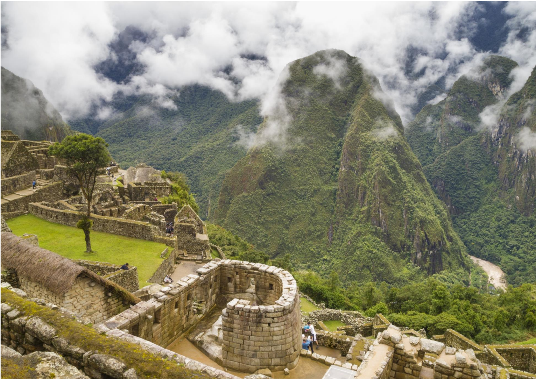
Machu Picchu – Circular Tower