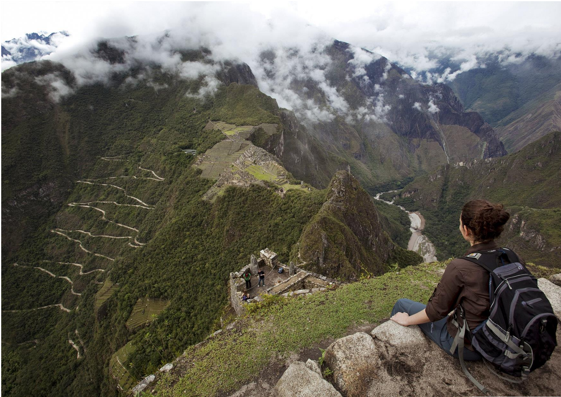
Wayna Picchu Mountain (Optional)