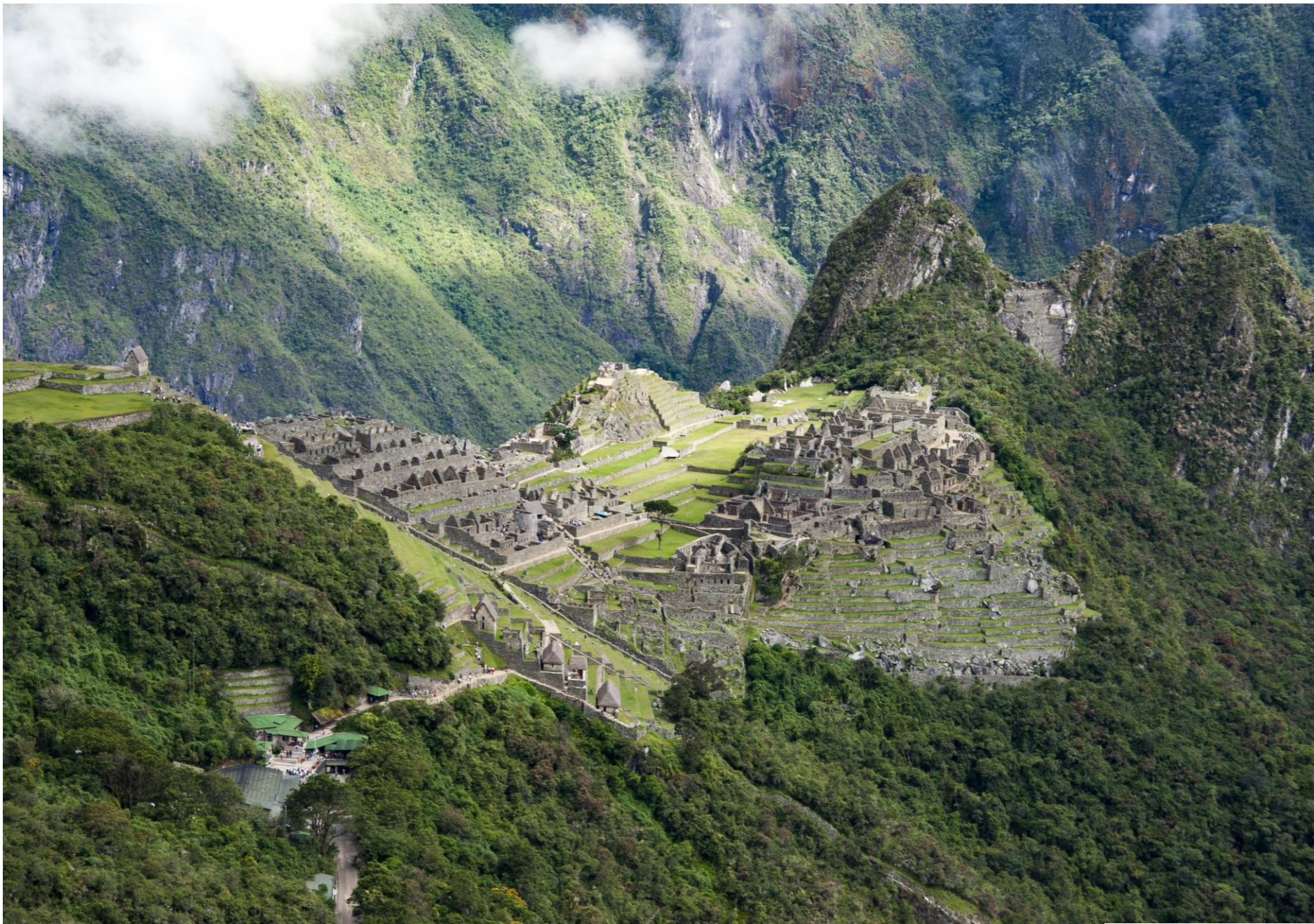
Machu Picchu Mountain (Optional)