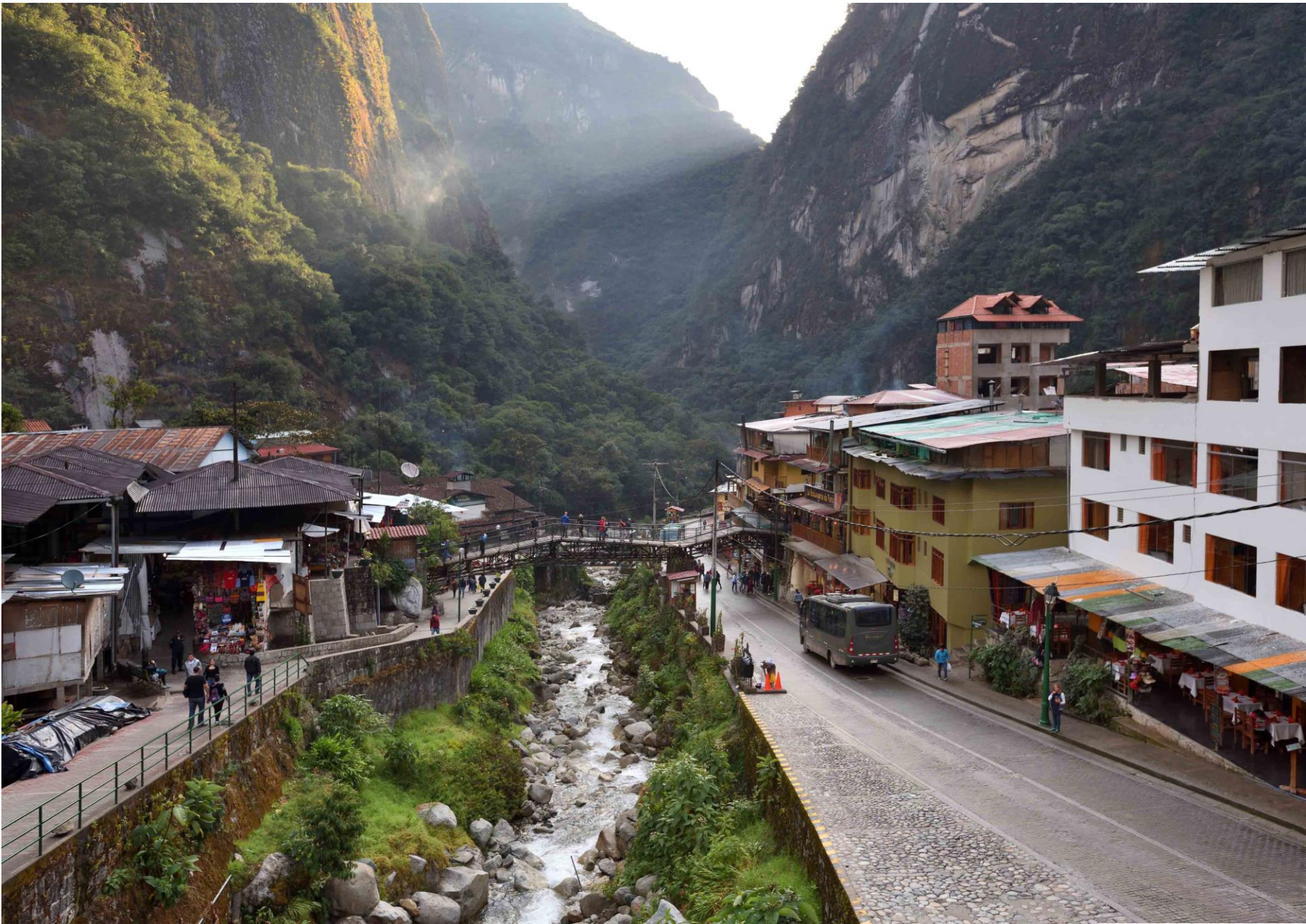
Machu Picchu Pueblo