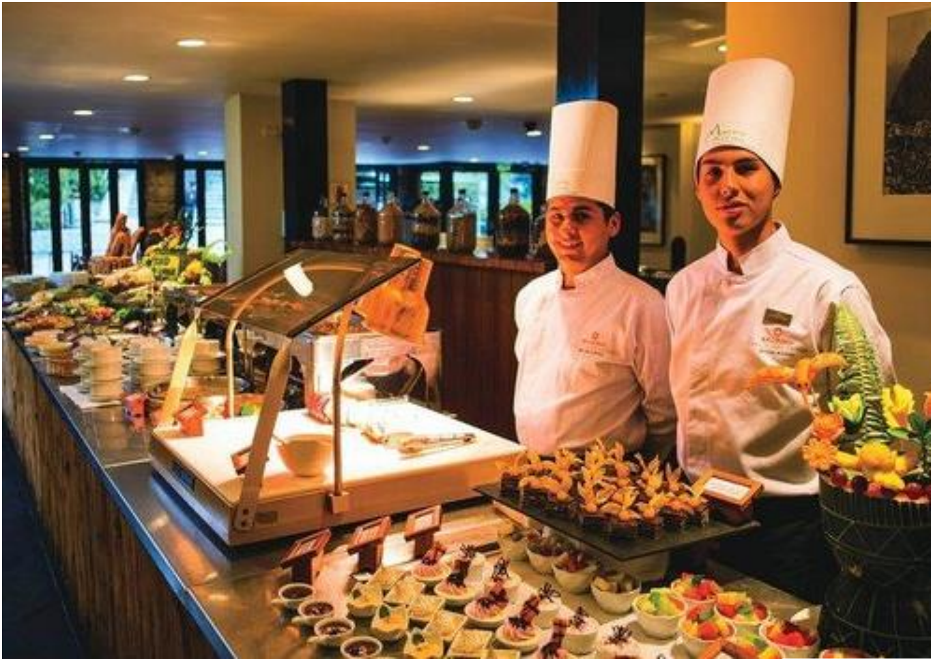
Buffet Lunch at Belmond Tinkuy Restaurant