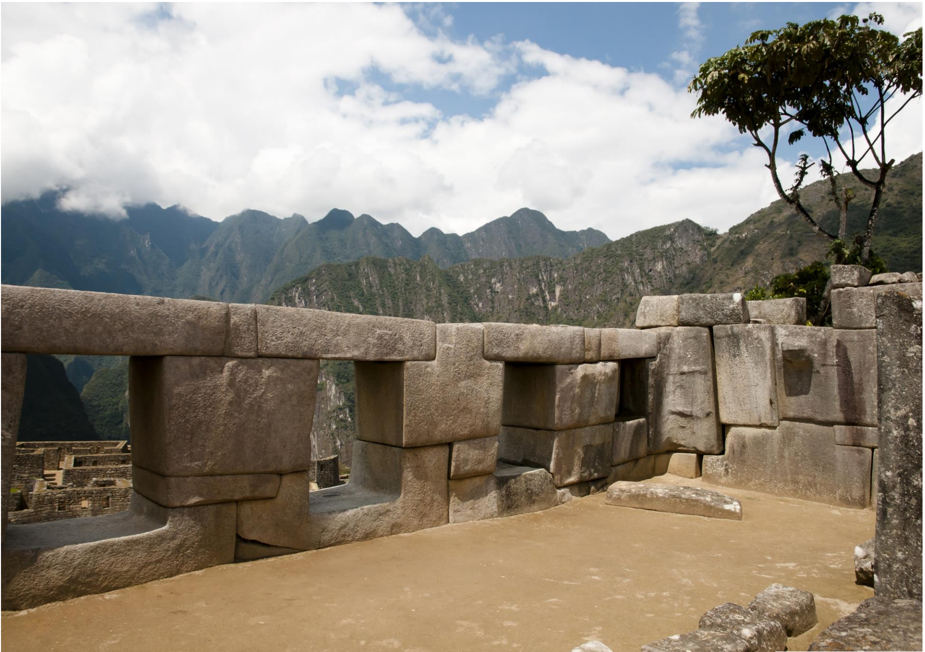
Machu Picchu – The Temple of the 3 Windows