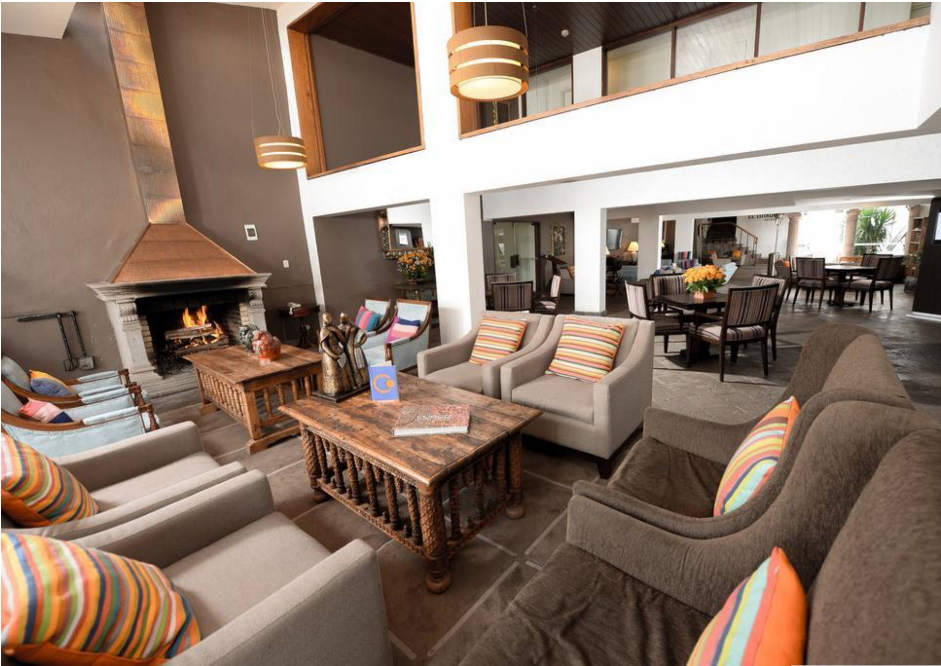
Costa del Sol Cusco Hotel