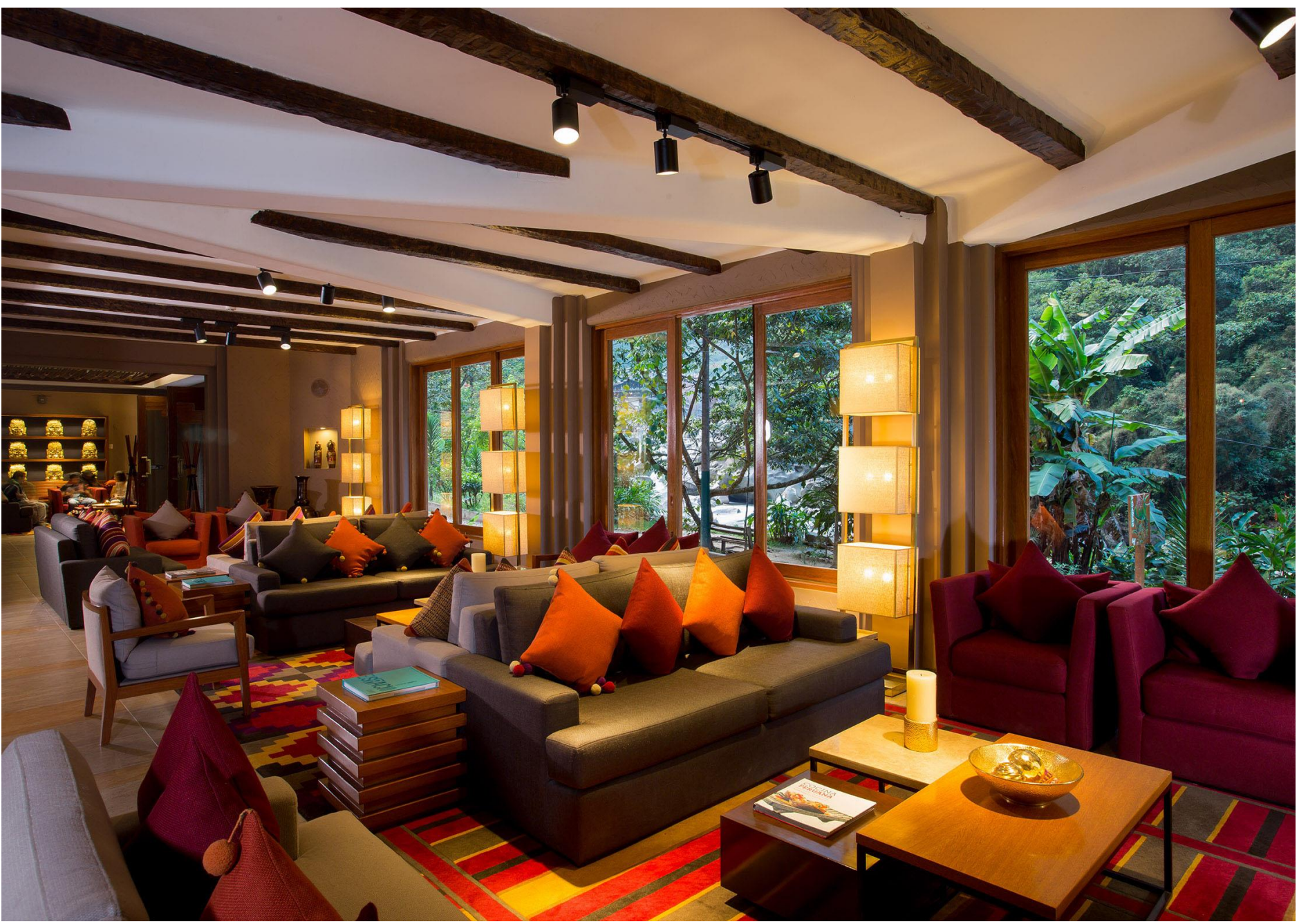
SUMAQ Machu Picchu Hotel