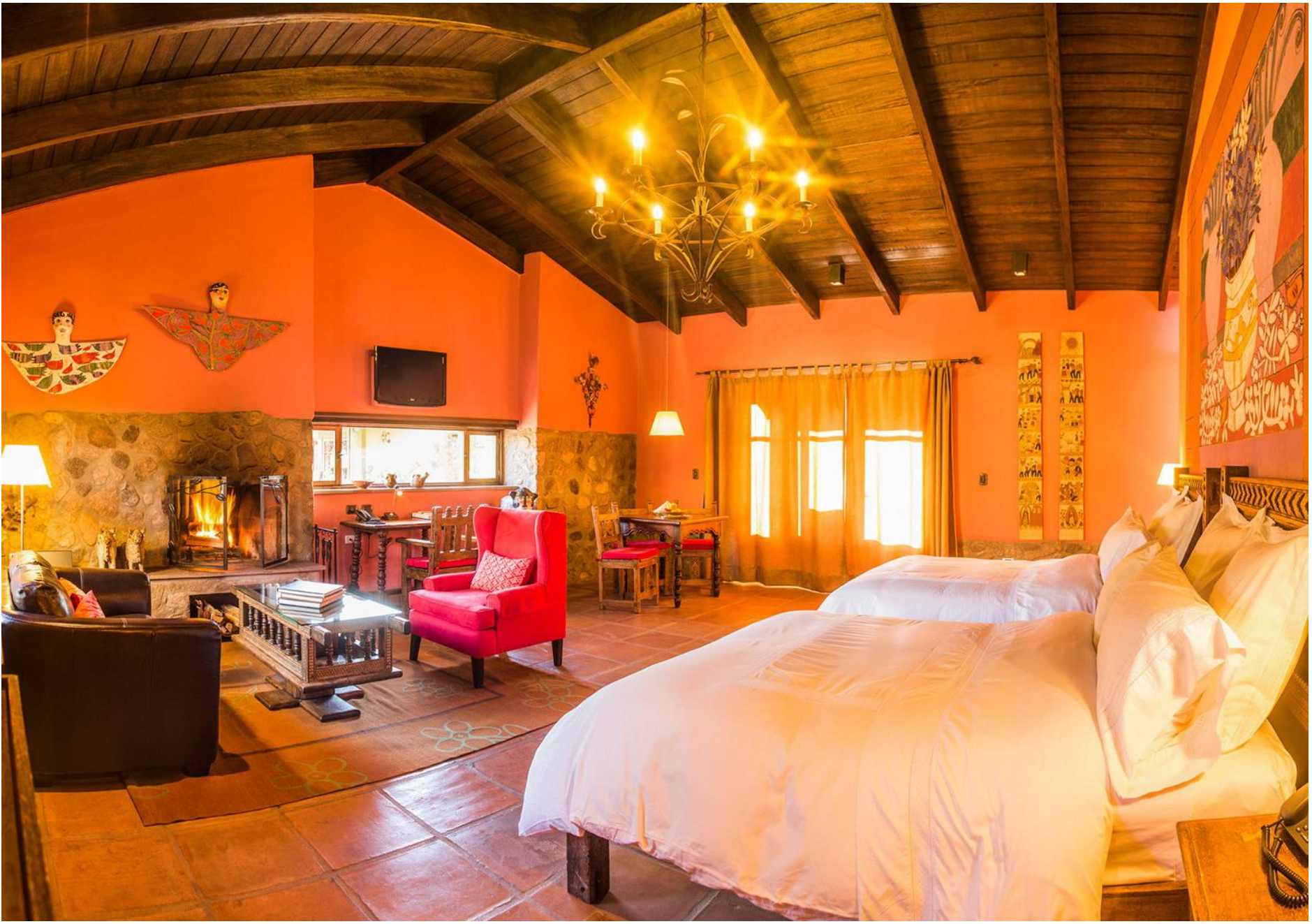
Sol y Luna Hotel