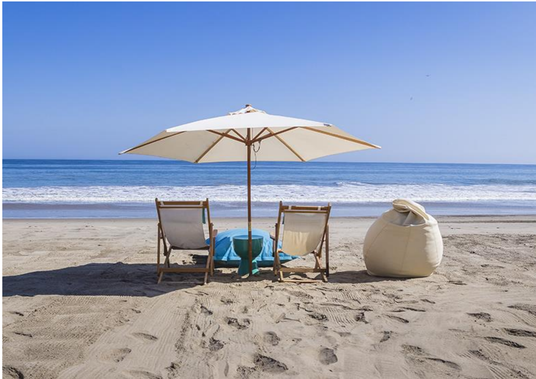
DCO Suites, Lounge & Spa – Las Pocitas, Mancora