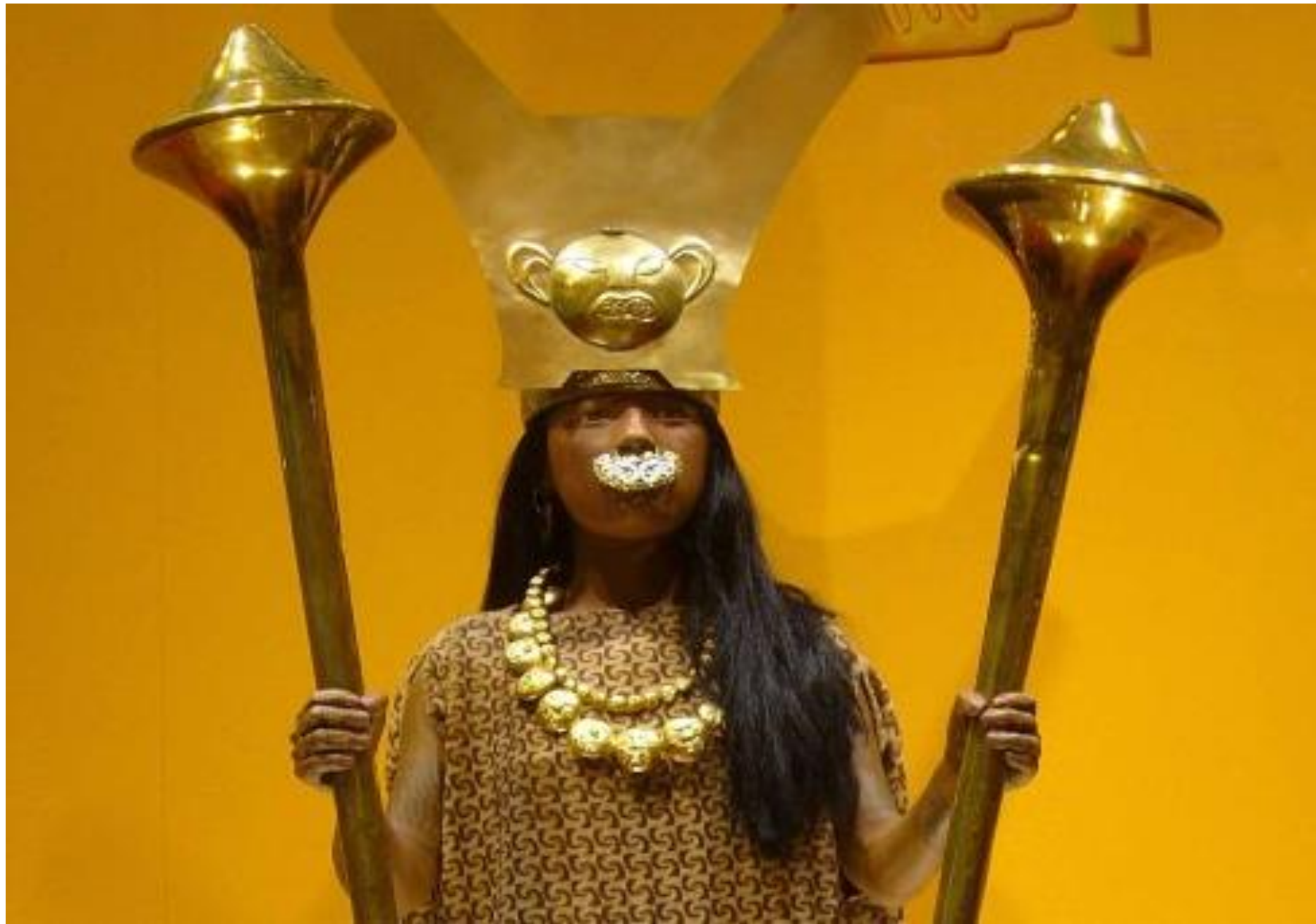
Lady of Cao Mummy