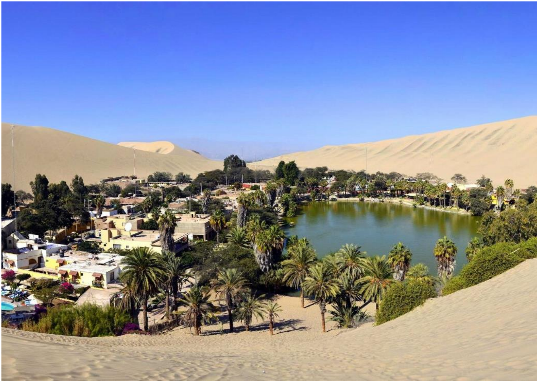
Huacachina Oasis - Ica