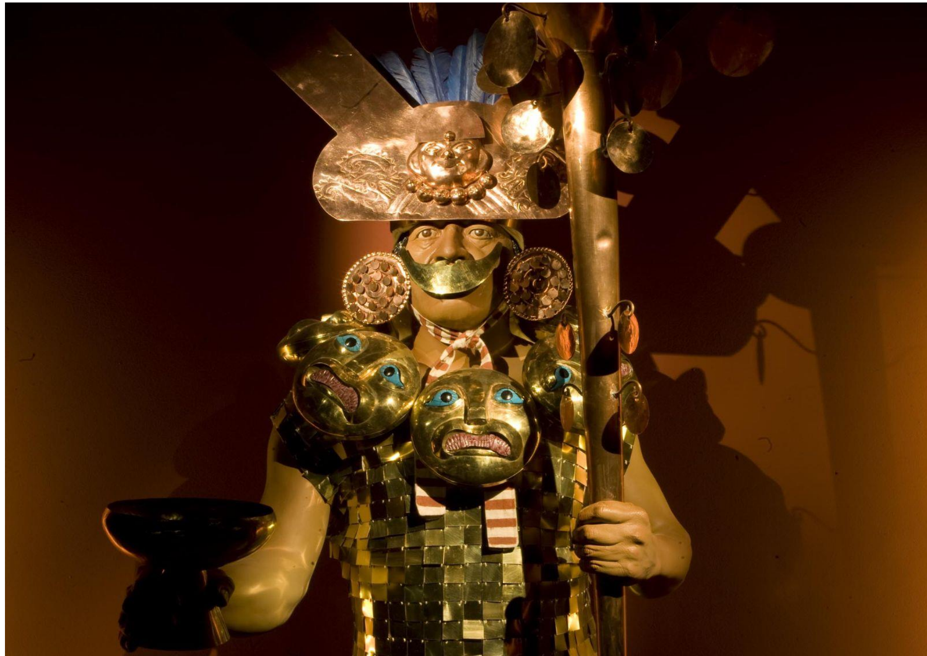
Lord of Sipan