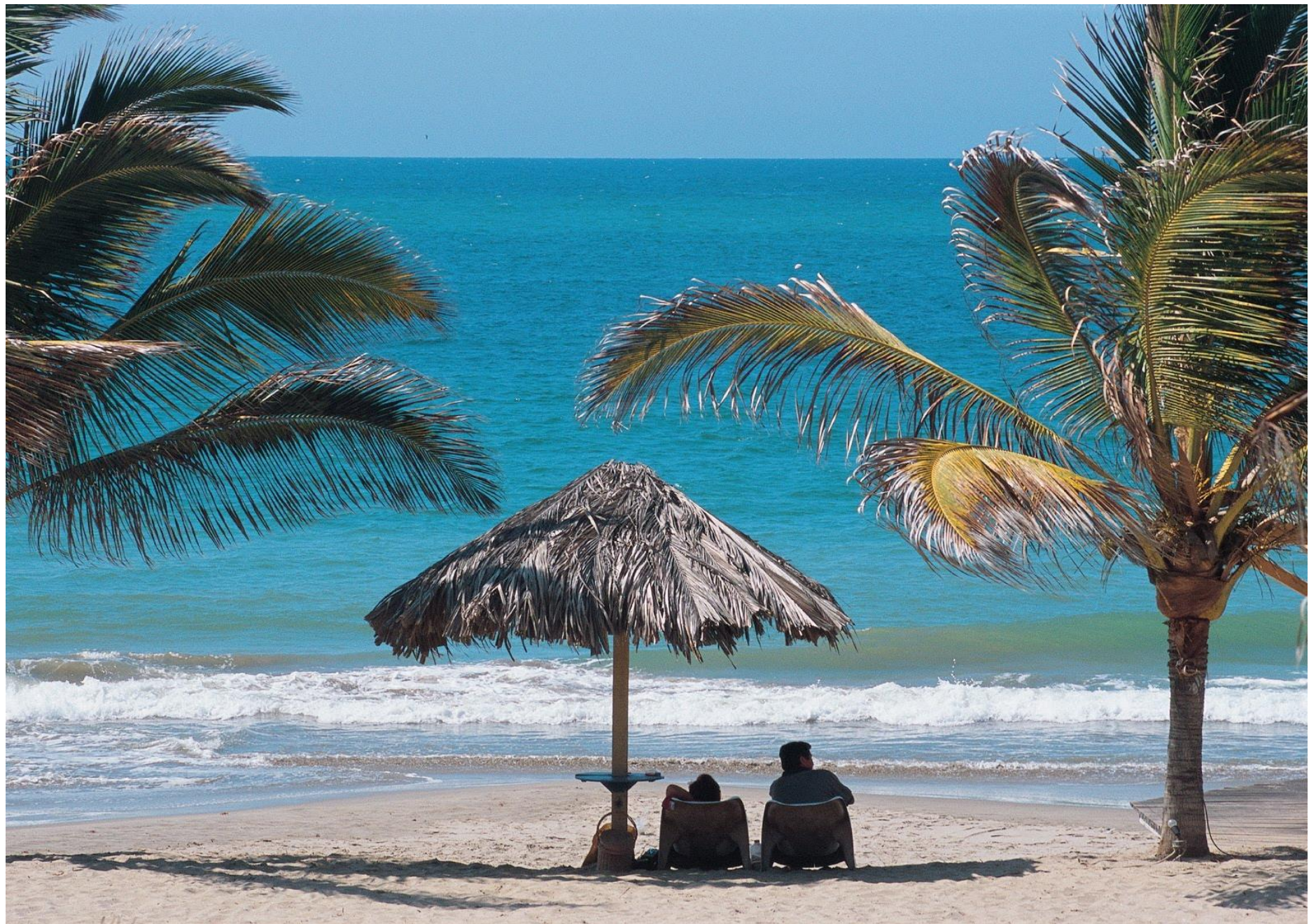
Zorritos Beach - Tumbes