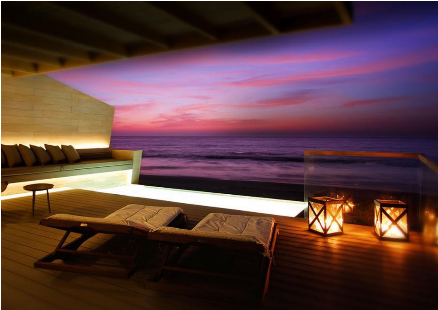
Arennas Mancora Hotel - Mancora