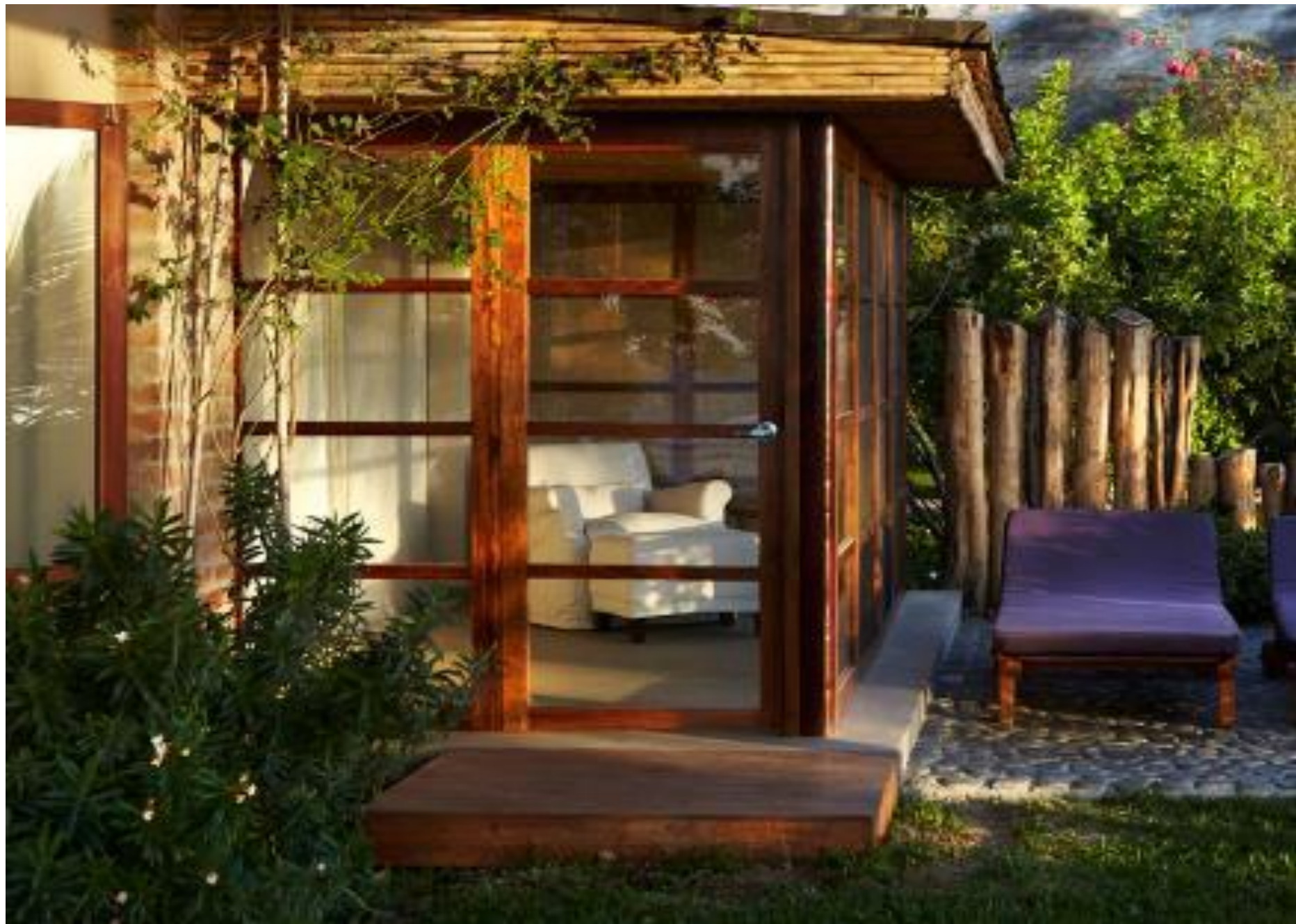
Kichic Boutique Hotel - Las Pocitas, Mancora