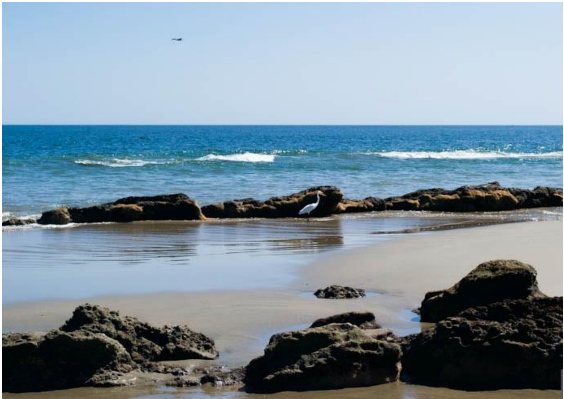
Las Pocitas Beach - Piura