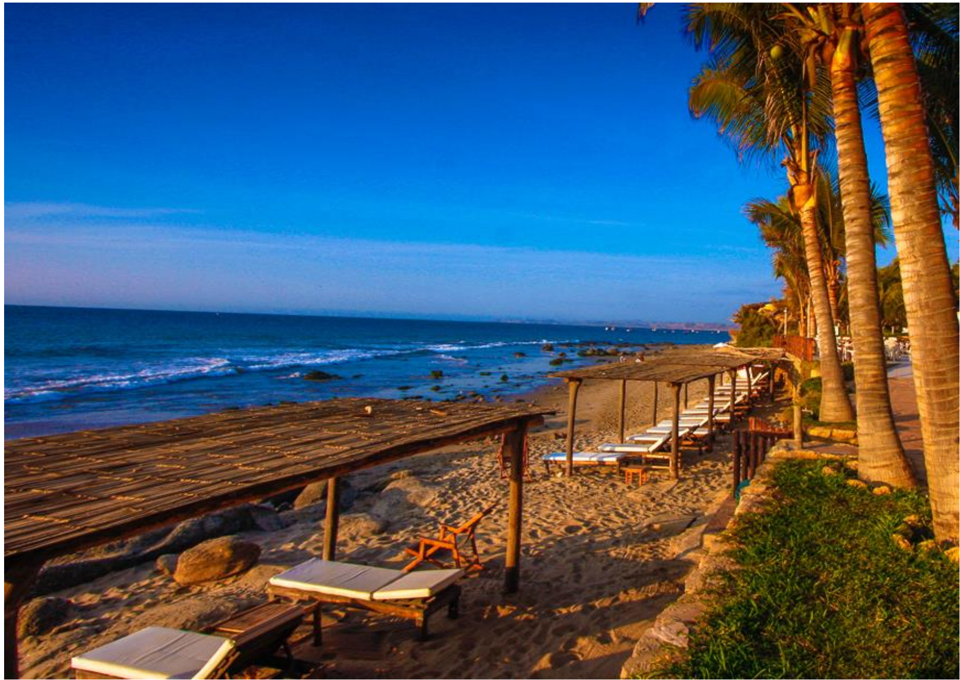
Mancora Beach - Piura