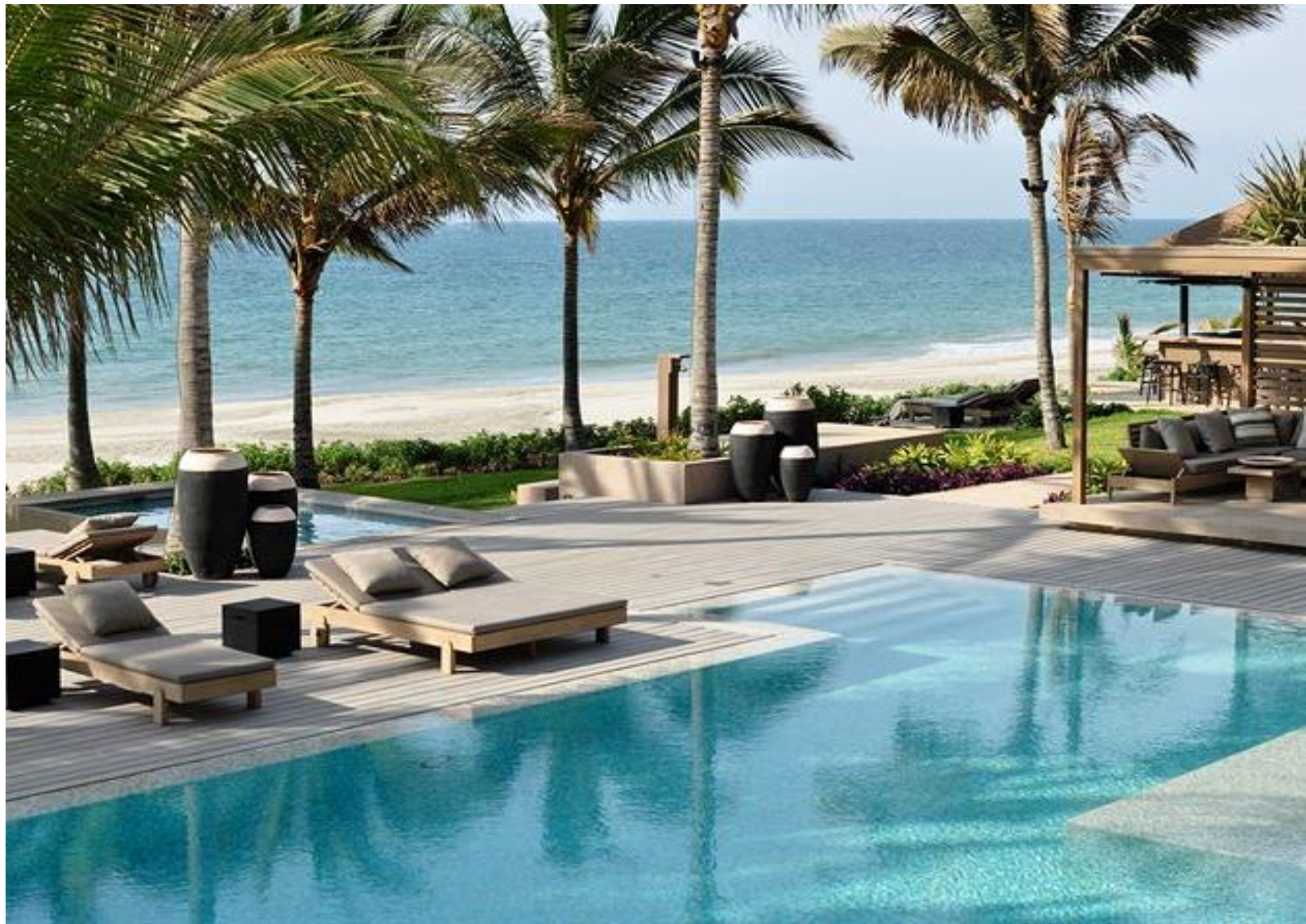
Arennas Mancora Hotel - Mancora