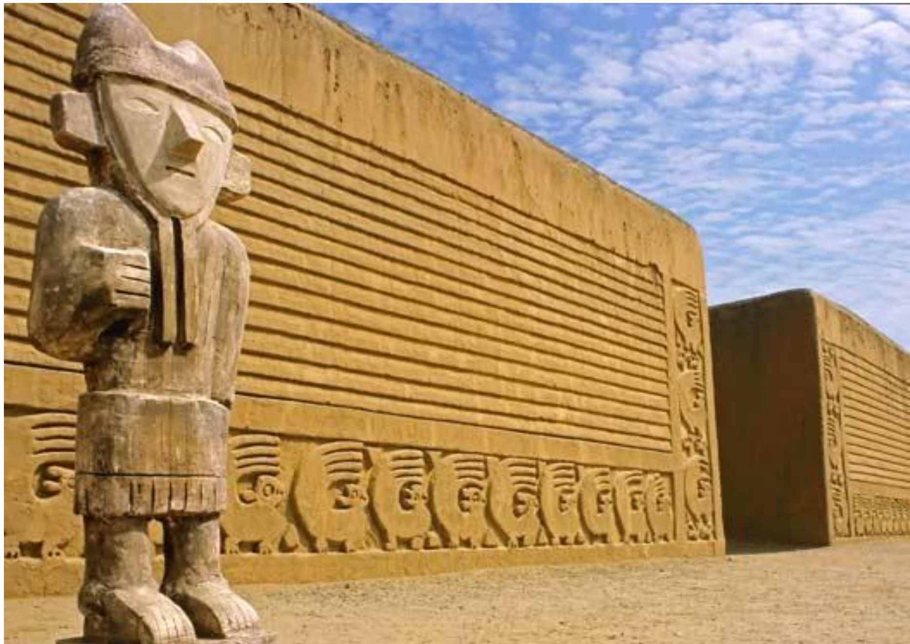
Chan – Chan Citadel