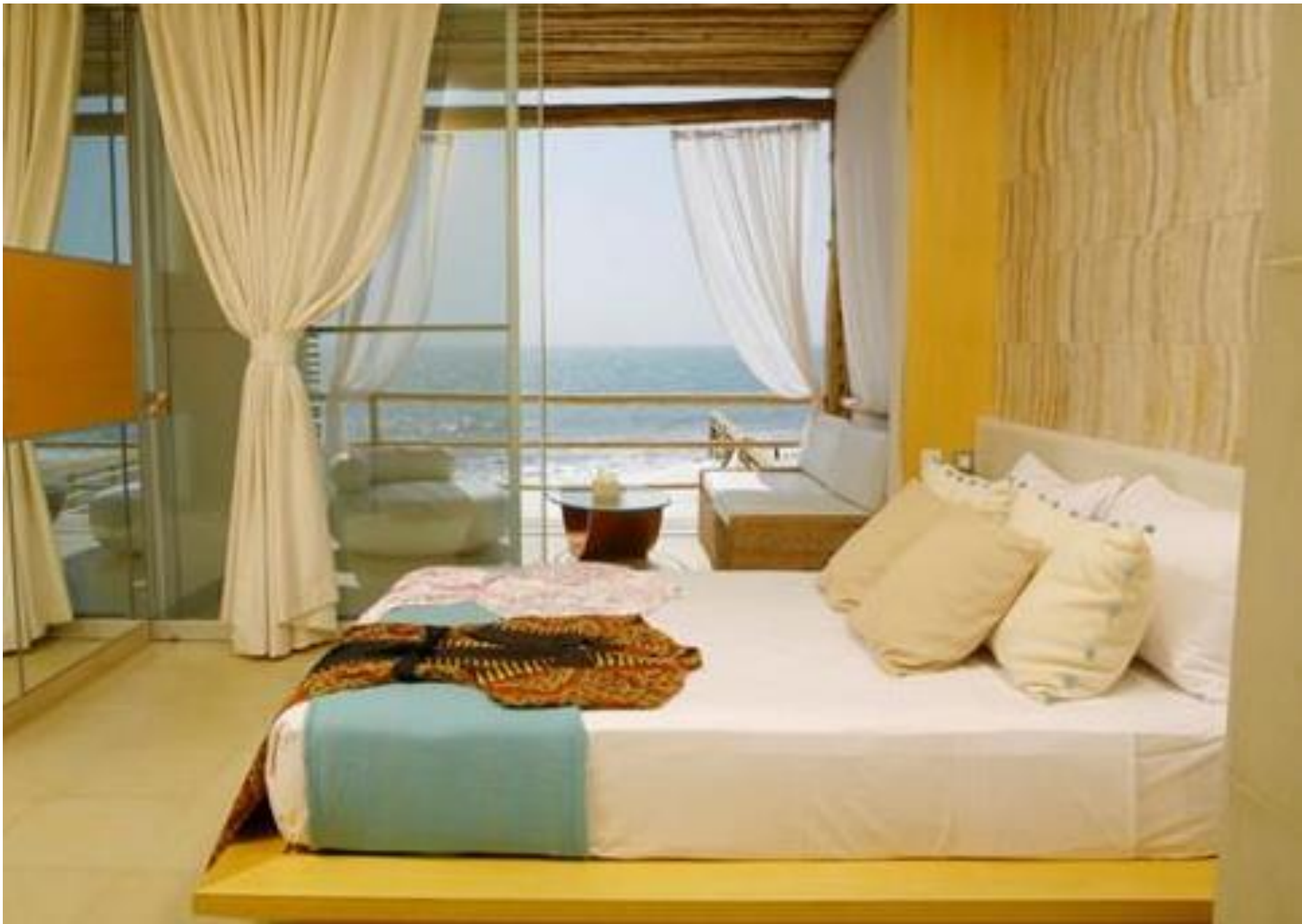
DCO Suites, Lounge & Spa – Las Pocitas, Mancora