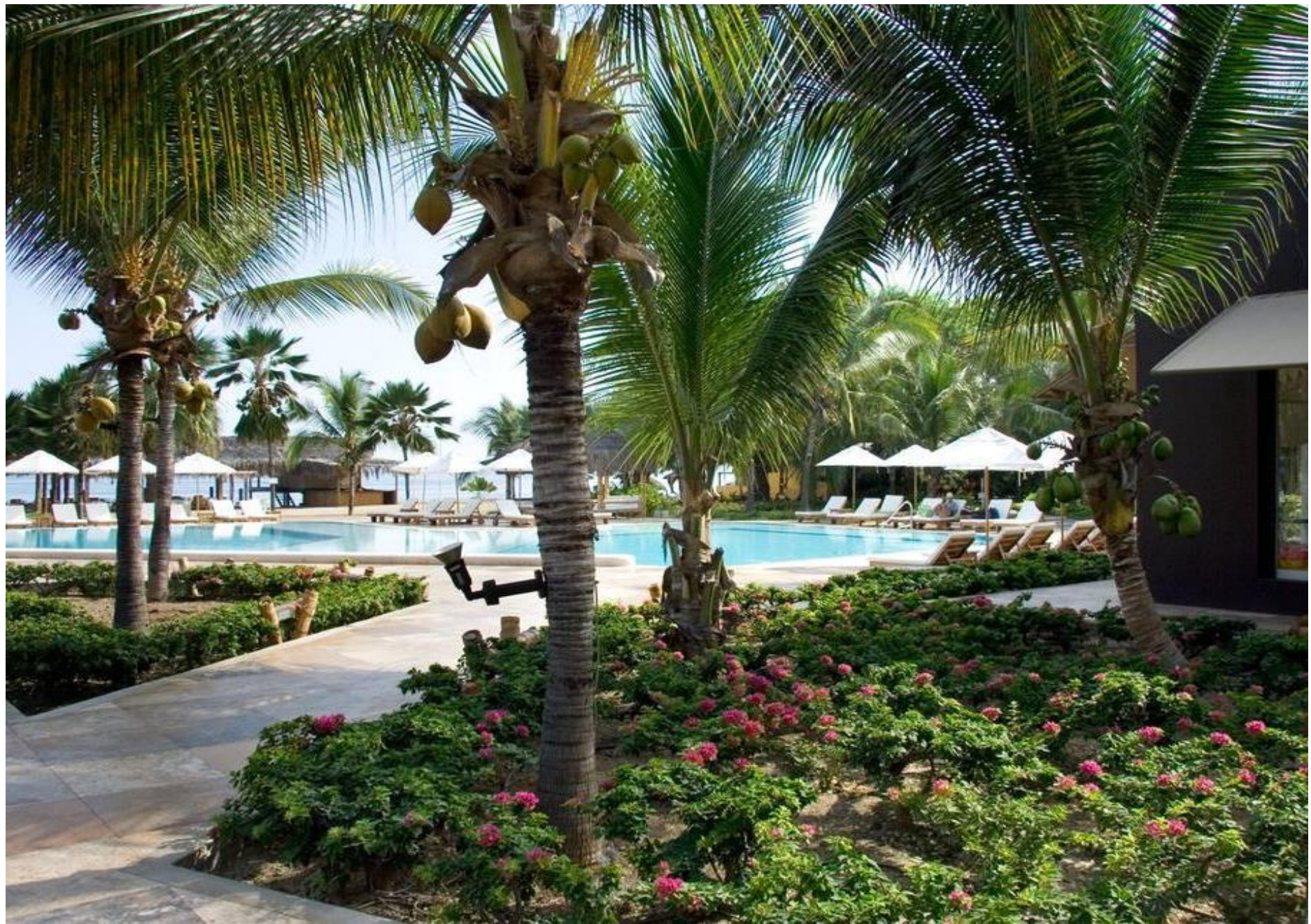
Punta Sal Suites & Bungalows - Tumbes