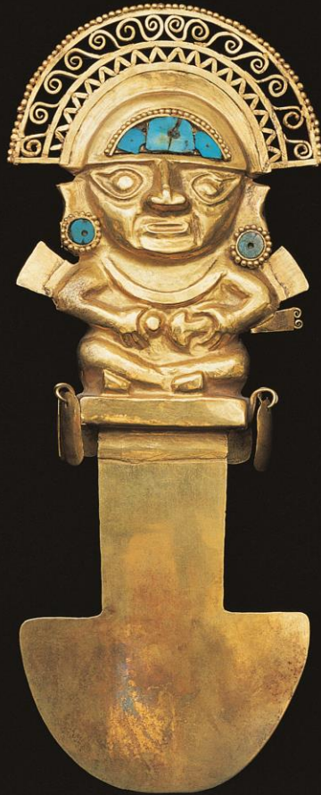
Sican Culture Ceremonial Knife (Tumi)