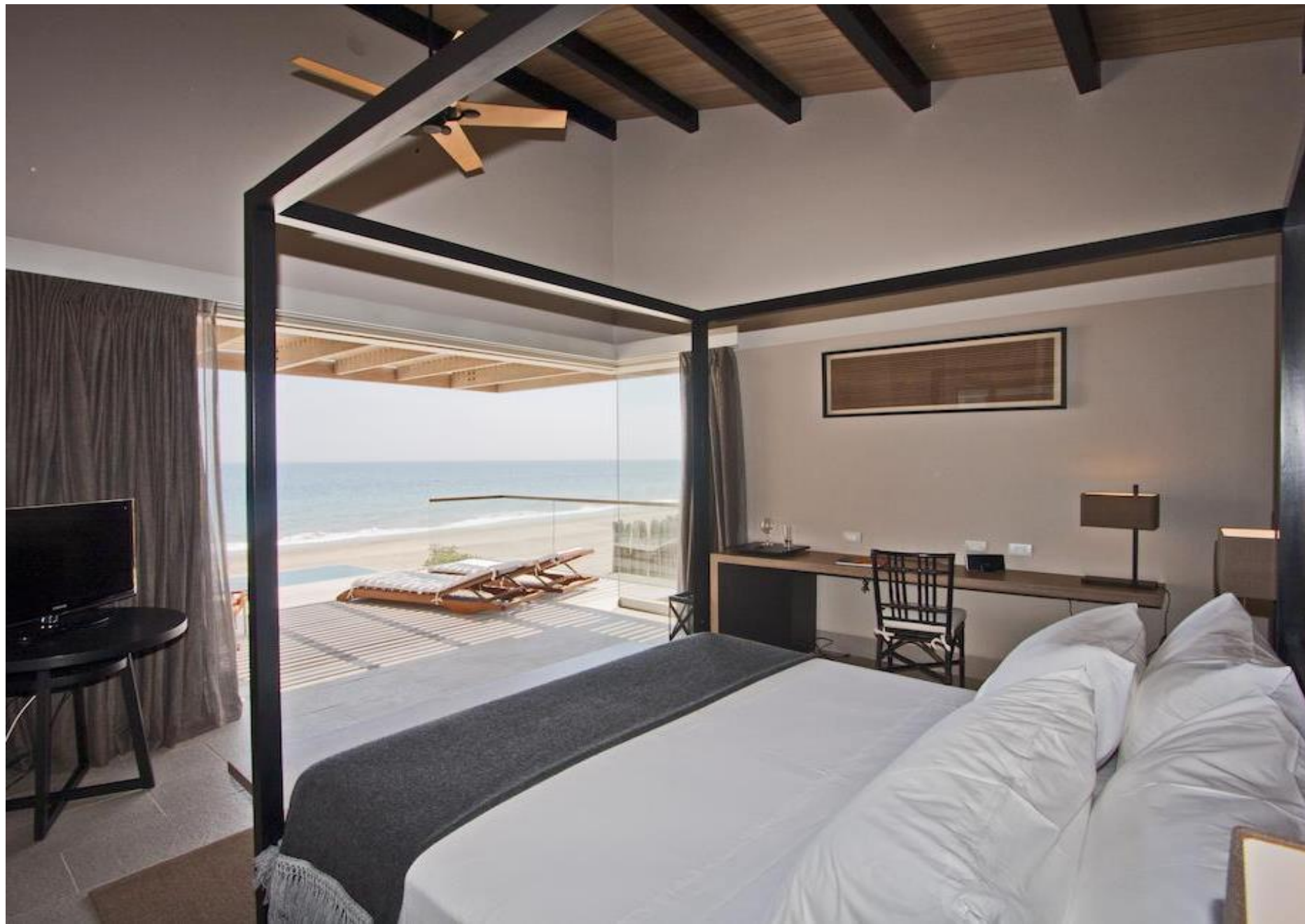
Arennas Mancora Hotel - Mancora