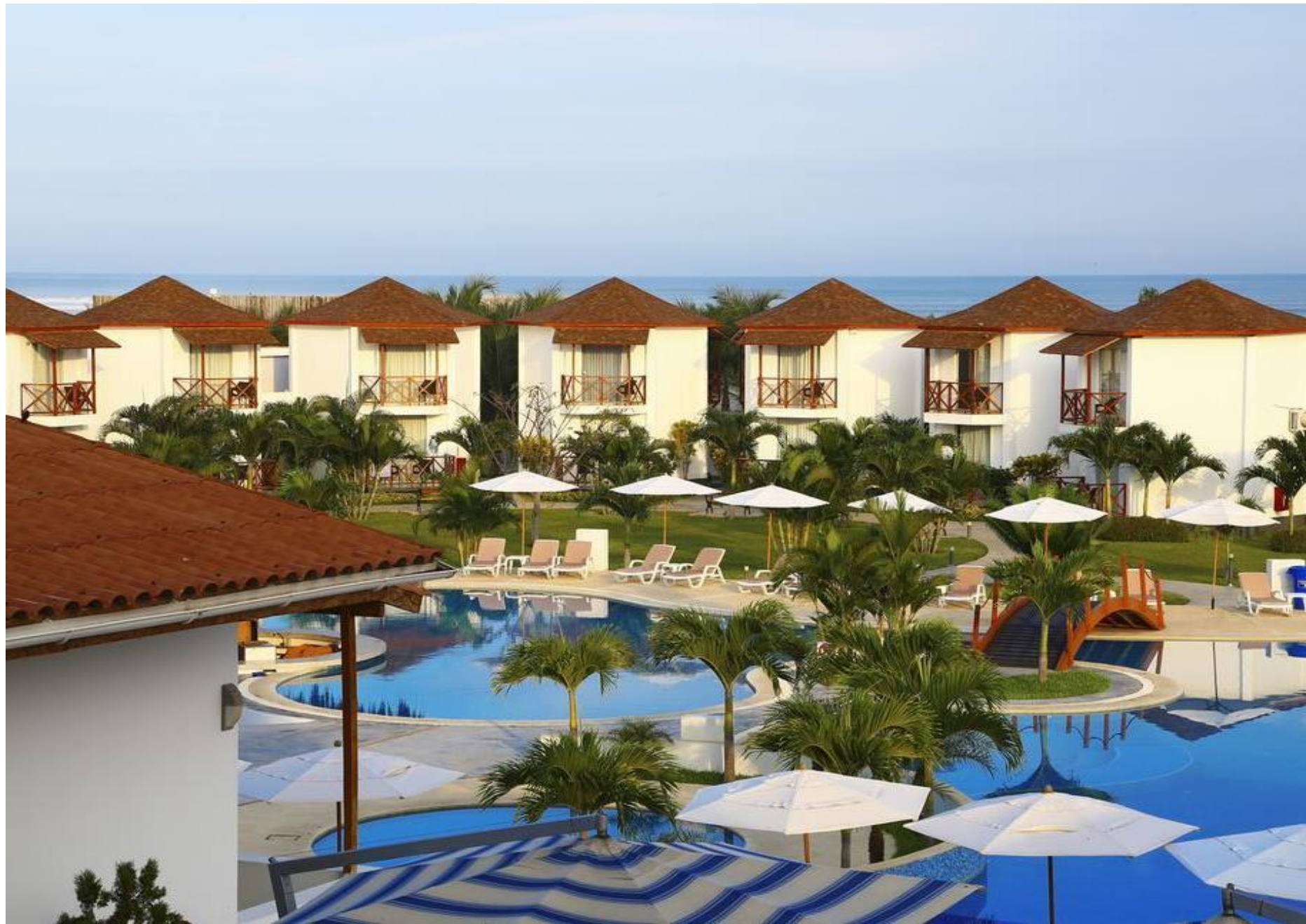
Casa Andina Select Zorritos - Tumbes