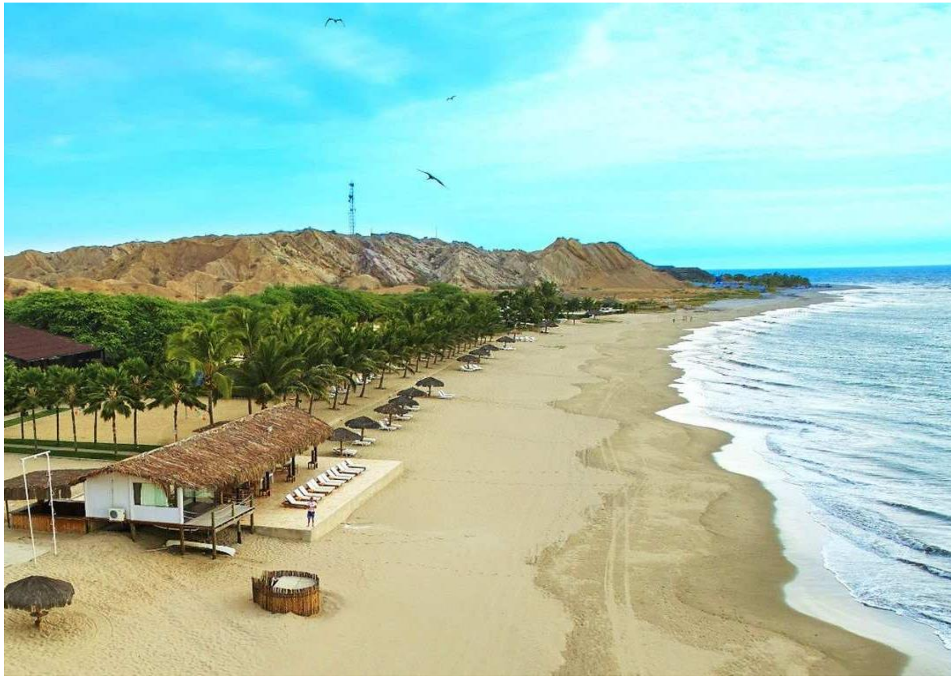
Punta Sal Beach - Tumbes