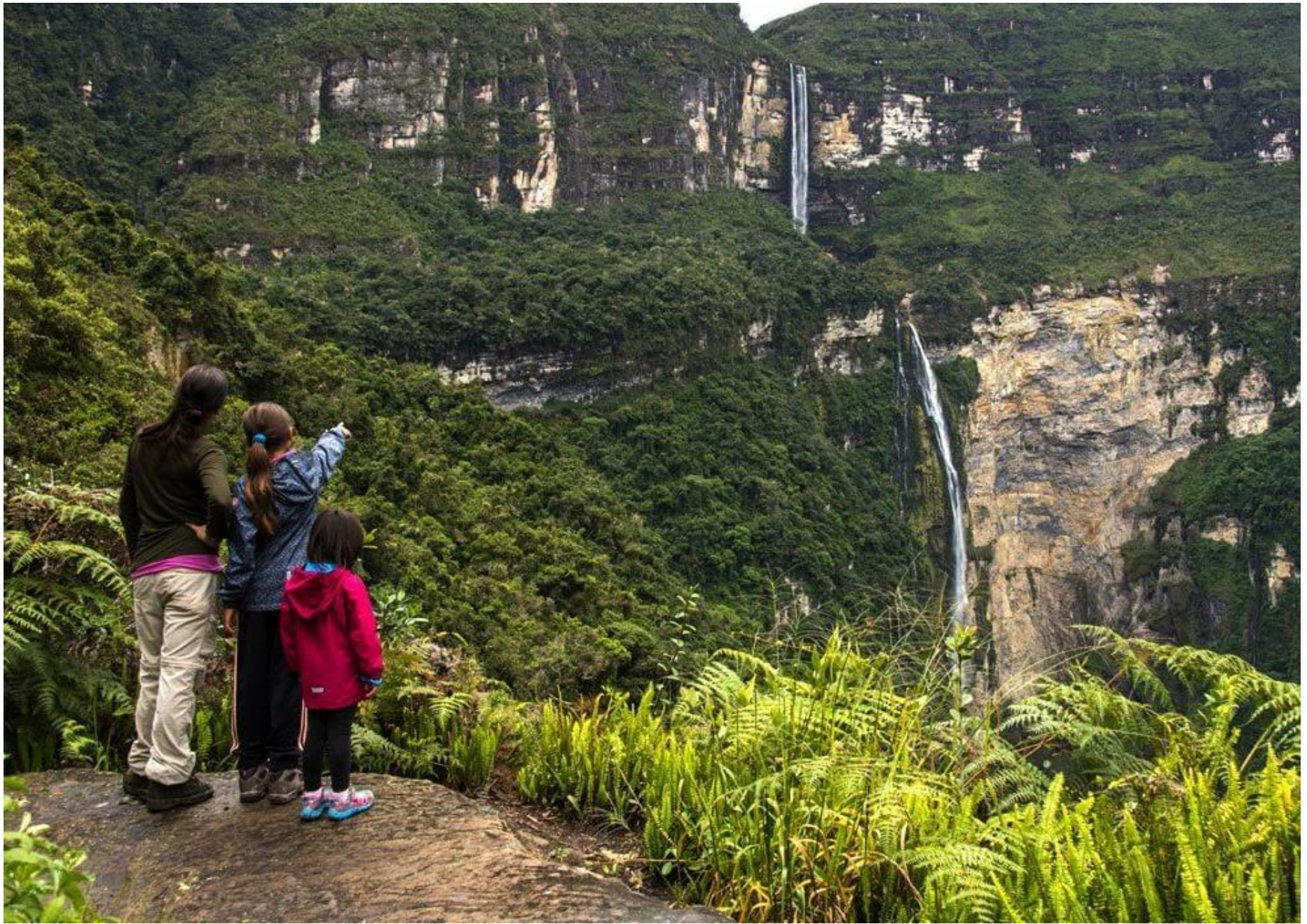
Gocta Water Fall