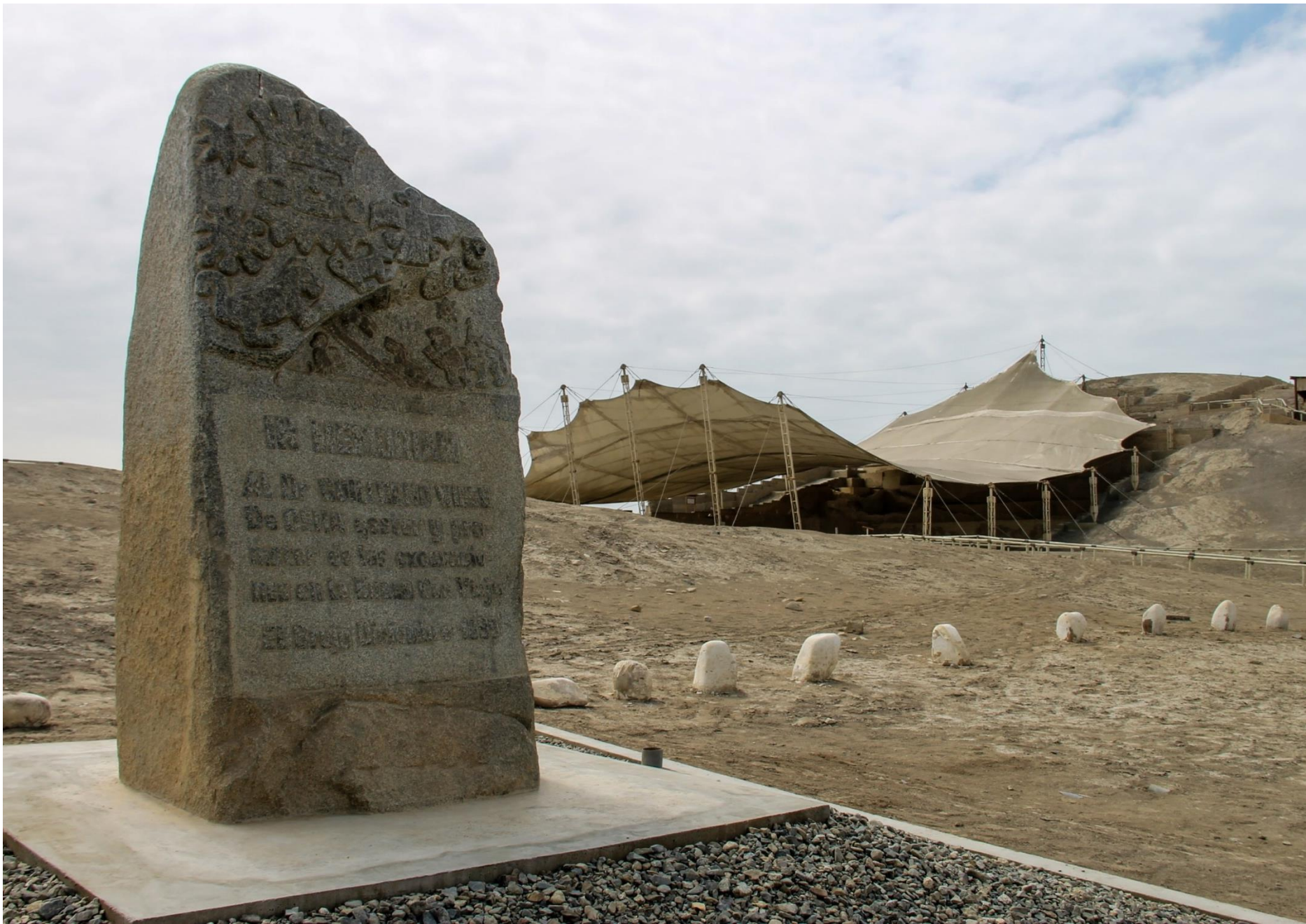
El Brujo Complex