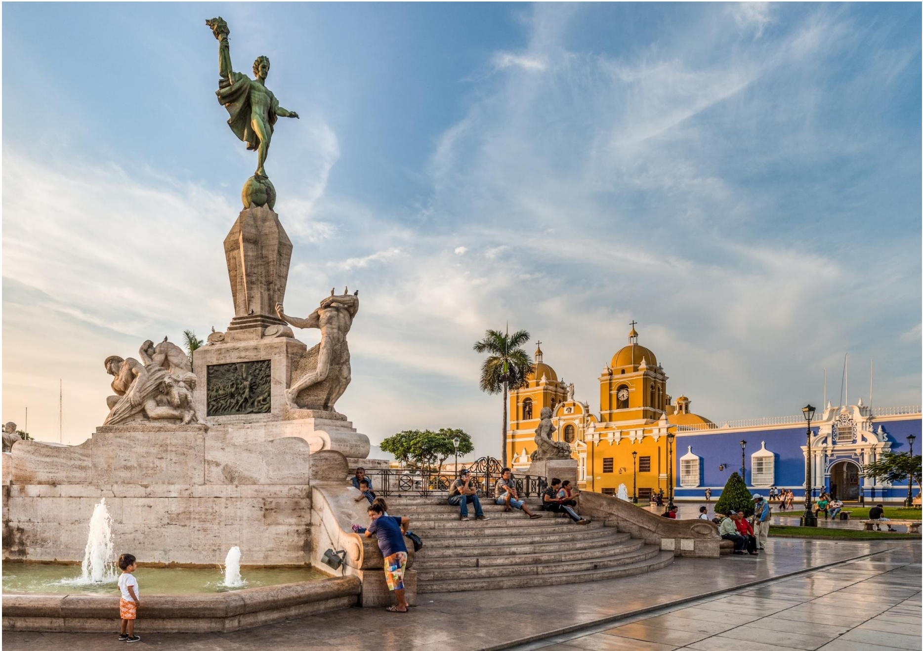
Trujillo Main Plaza