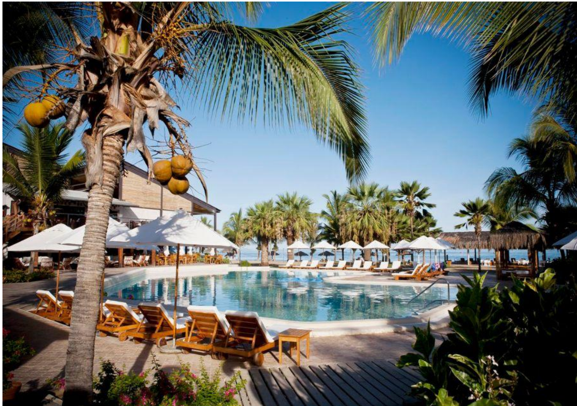
Punta Sal Suites & Bungalows - Tumbes