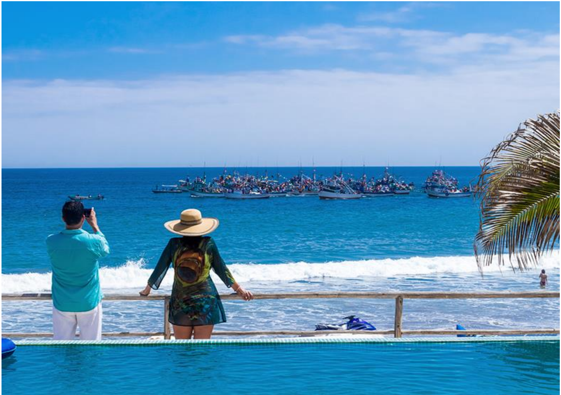
DCO Suites, Lounge & Spa – Las Pocitas, Mancora