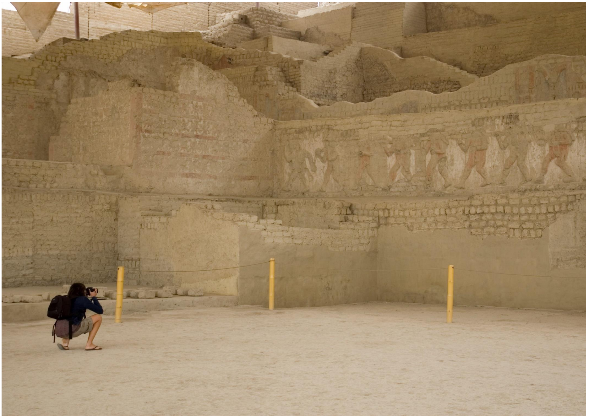
El Brujo Complex