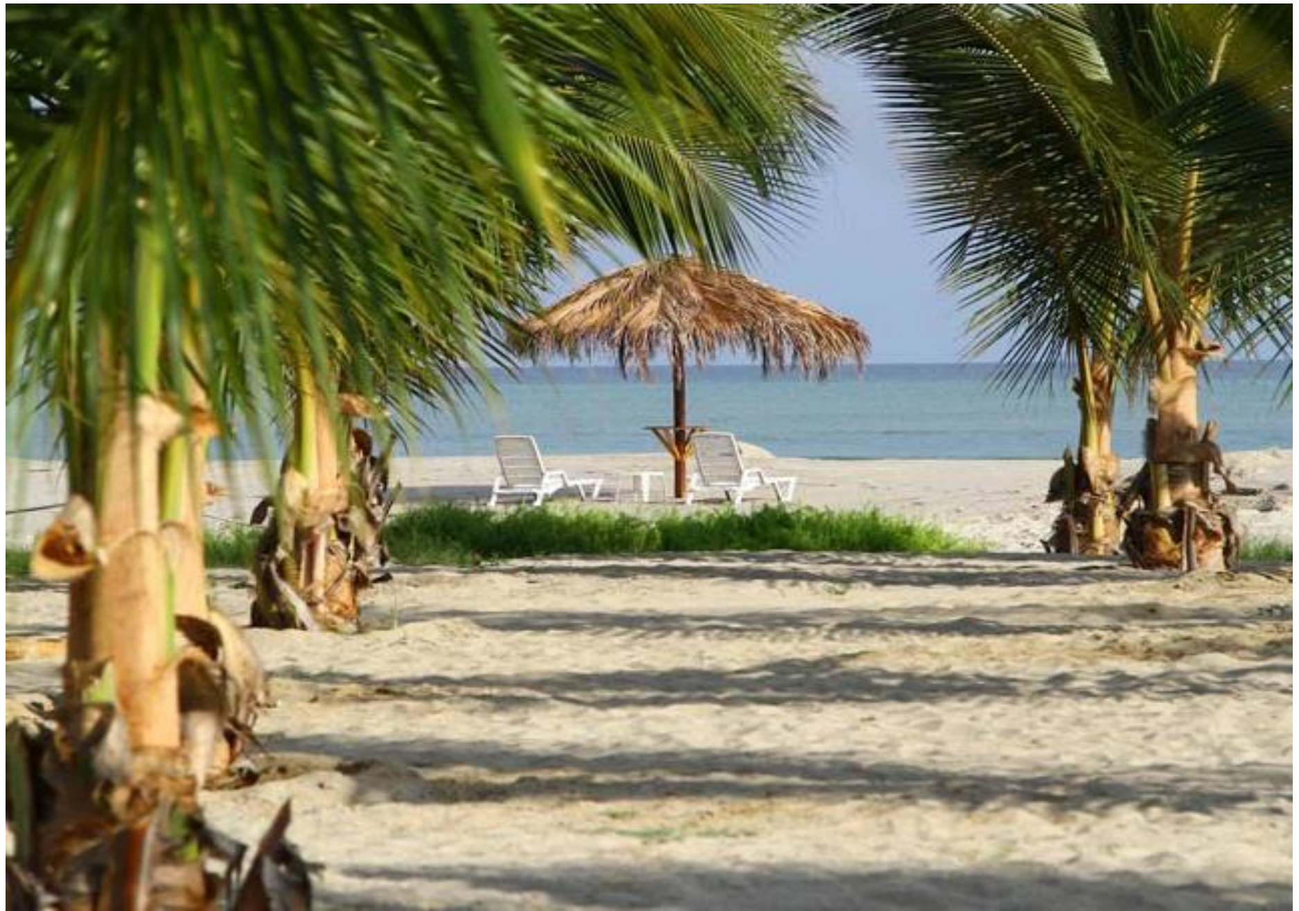
Casa Andina Select Zorritos - Tumbes