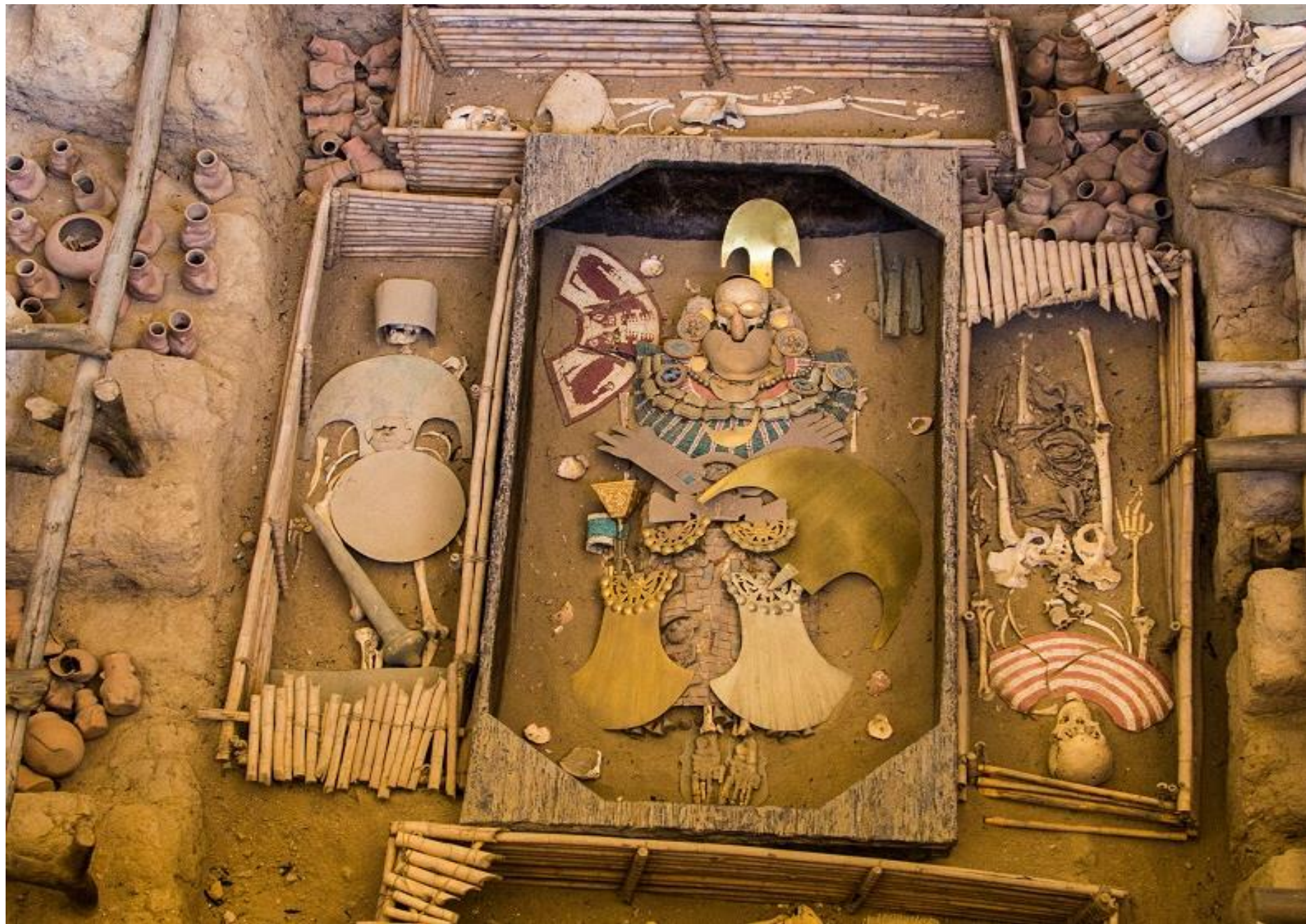
Huaca Rajada – Lord of Sipan