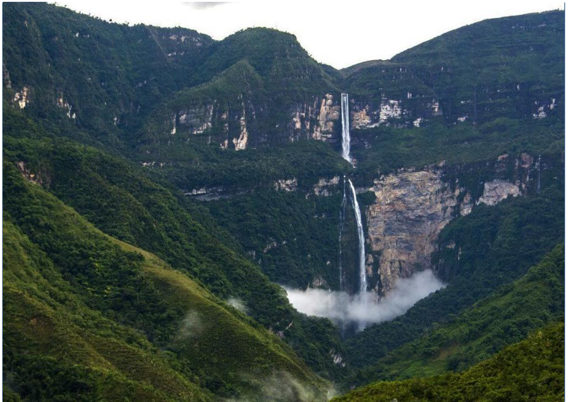
Gocta Water Fall