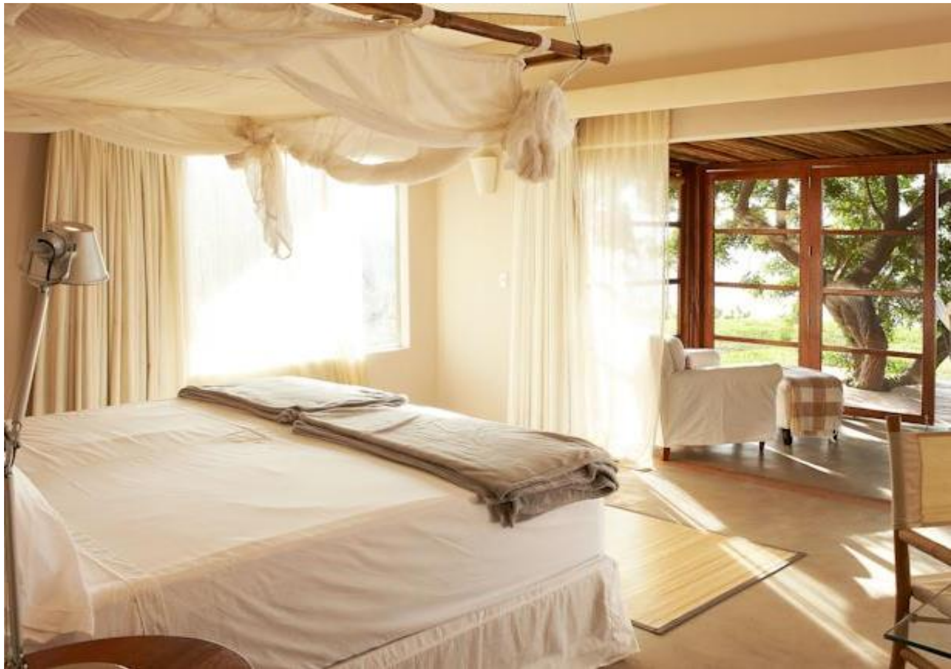
Kichic Boutique Hotel - Las Pocitas, Mancora