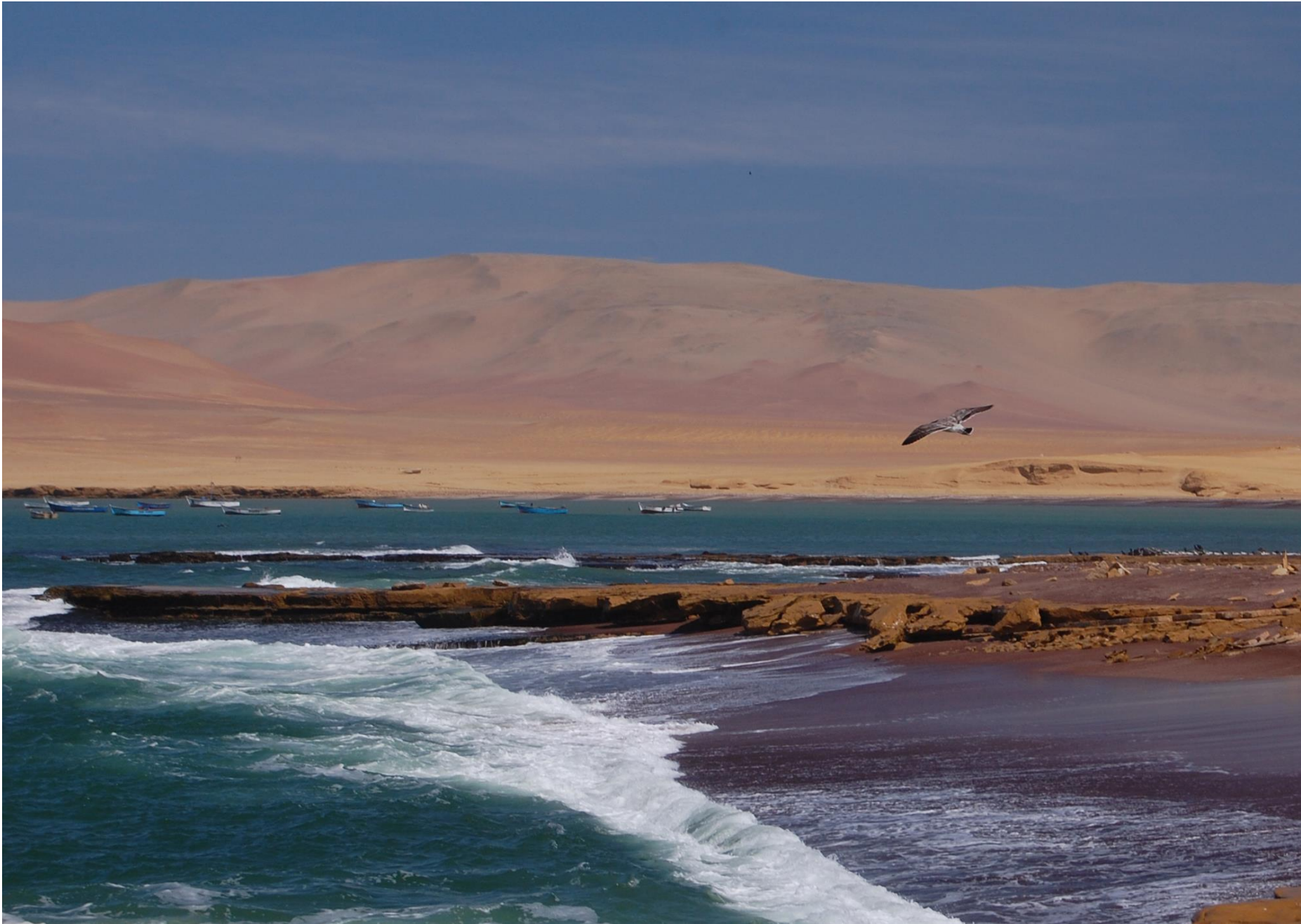
Paracas National Reserve