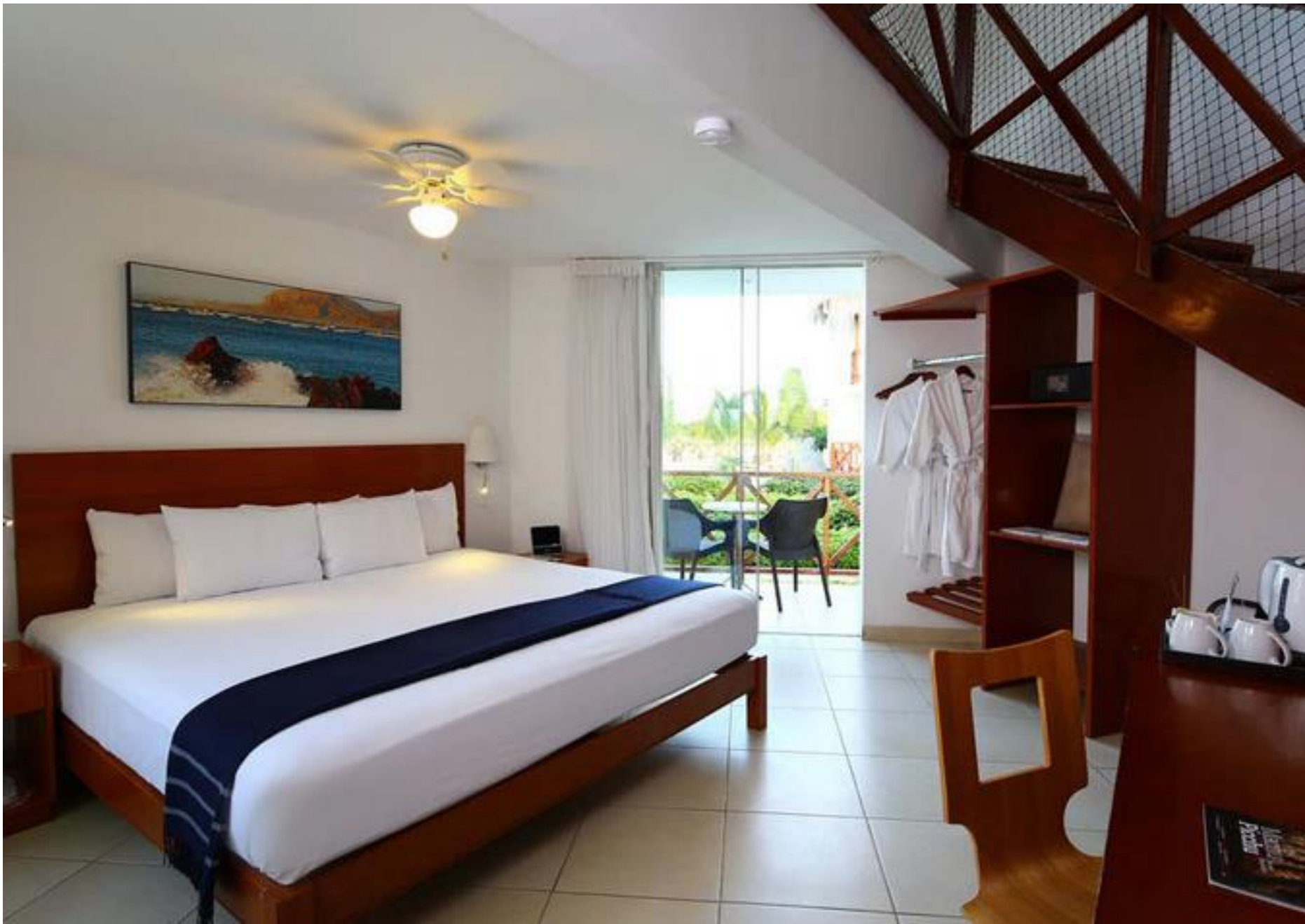
Casa Andina Select Zorritos - Tumbes