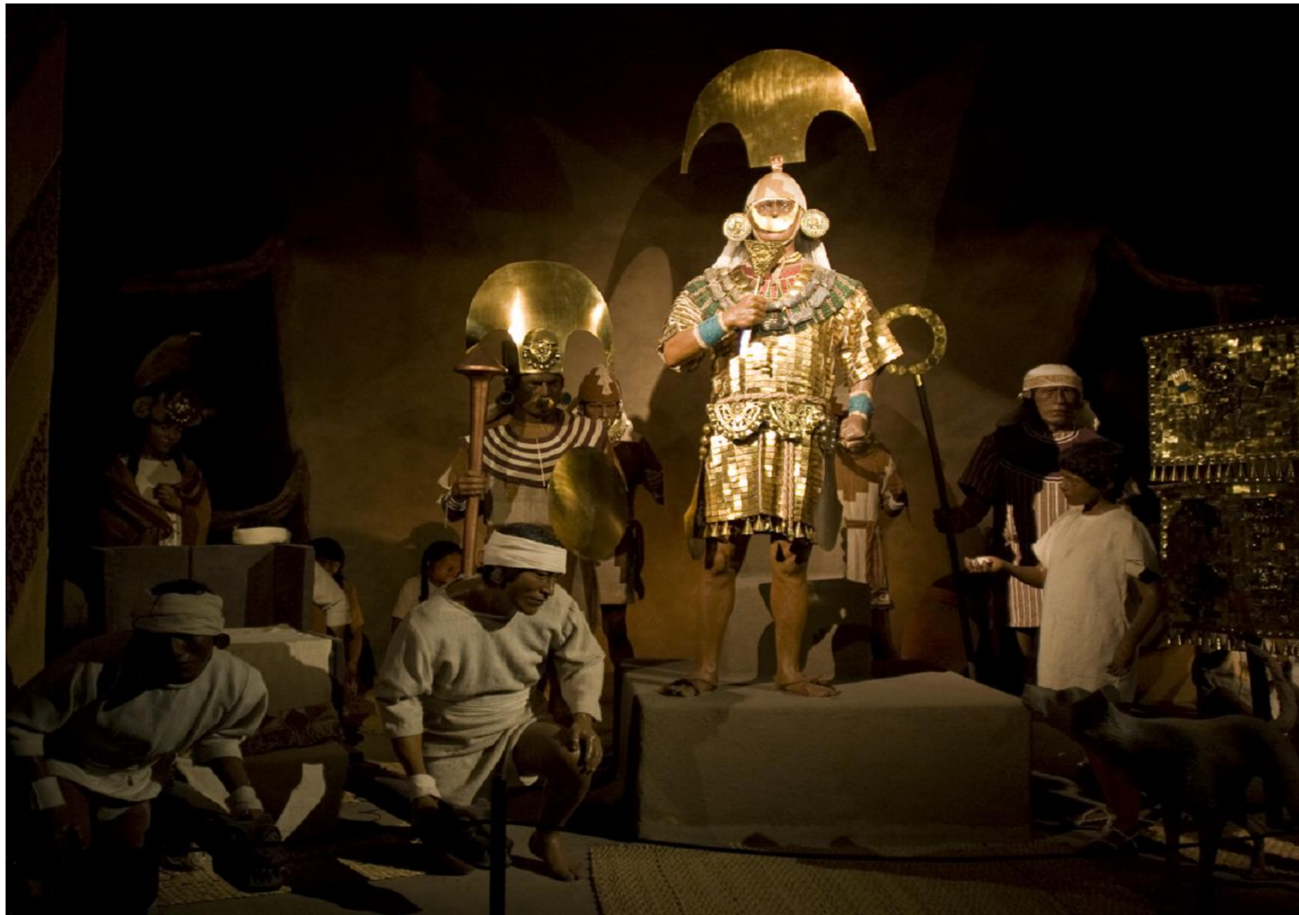
Museum of the Royal Tombs of Sipan