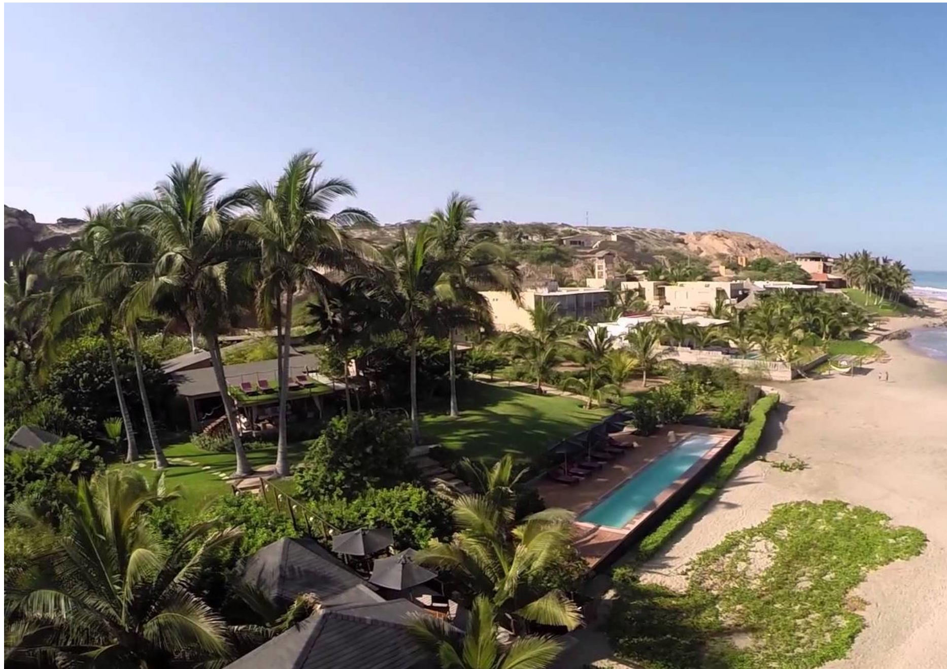
Kichic Boutique Hotel - Las Pocitas, Mancora