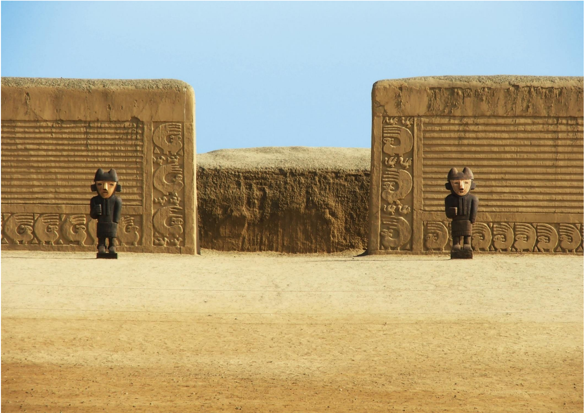
Chan – Chan Citadel