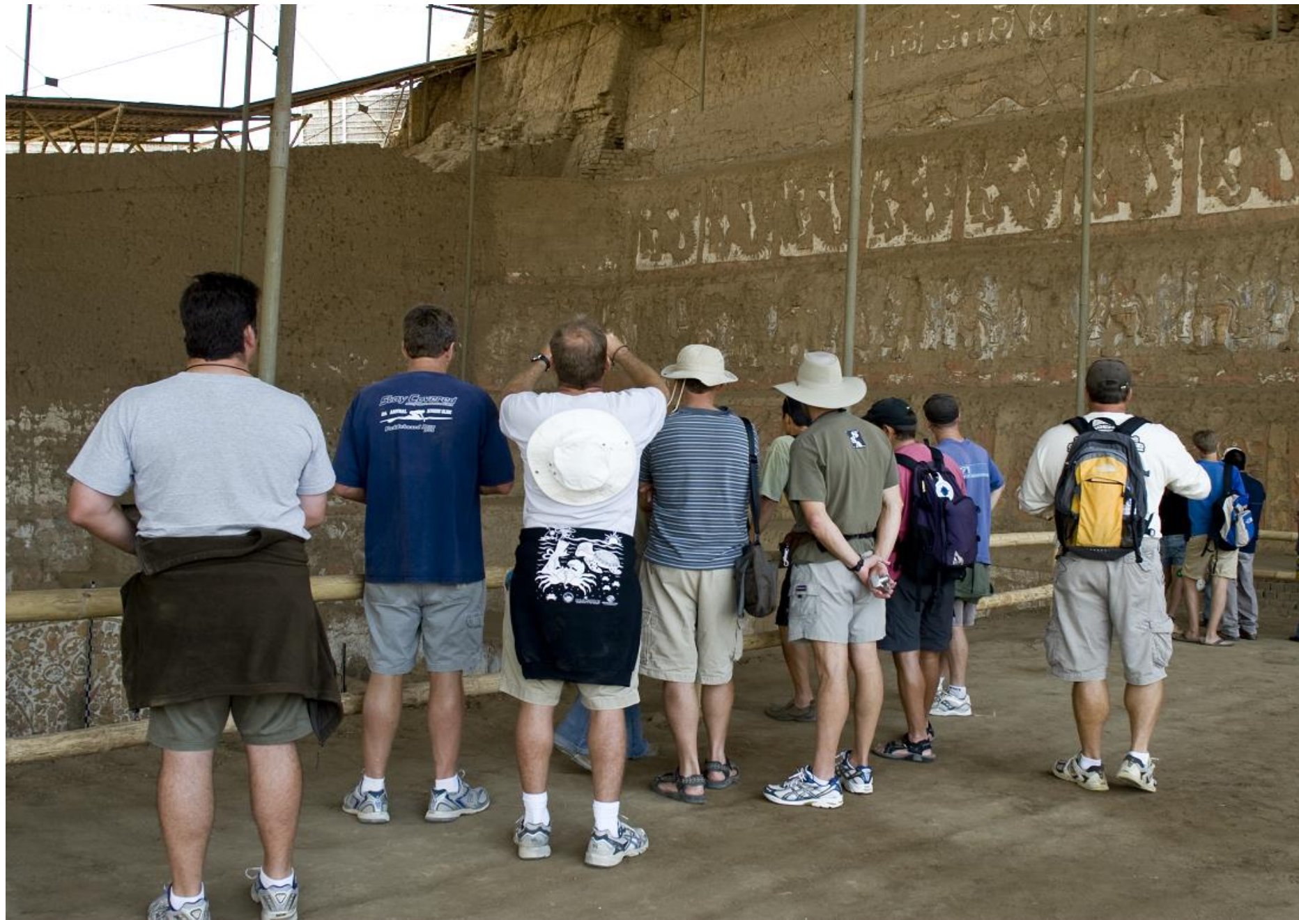
Temple of the Sun and Moon