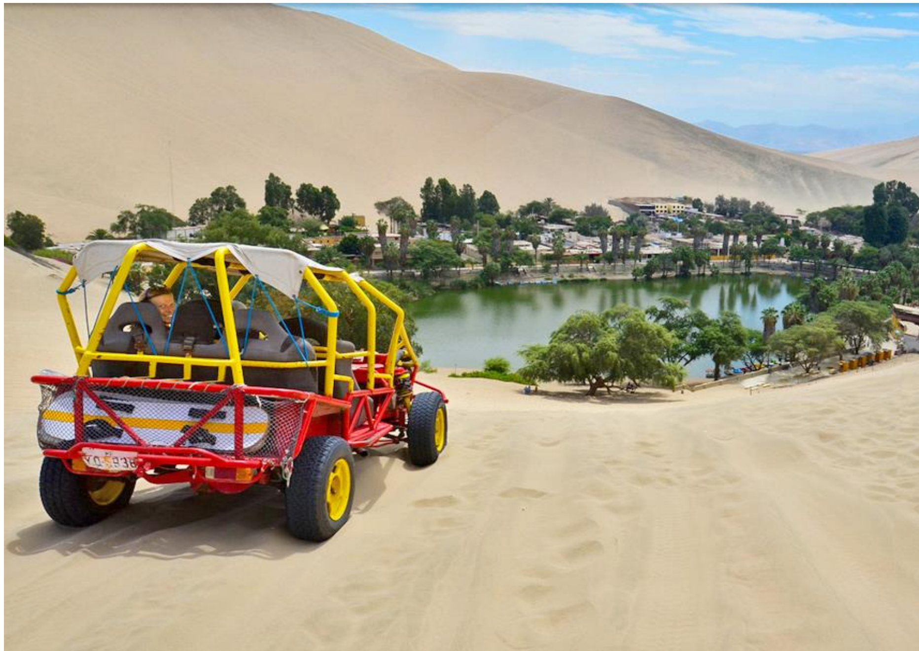
Dune Buggies - Ica