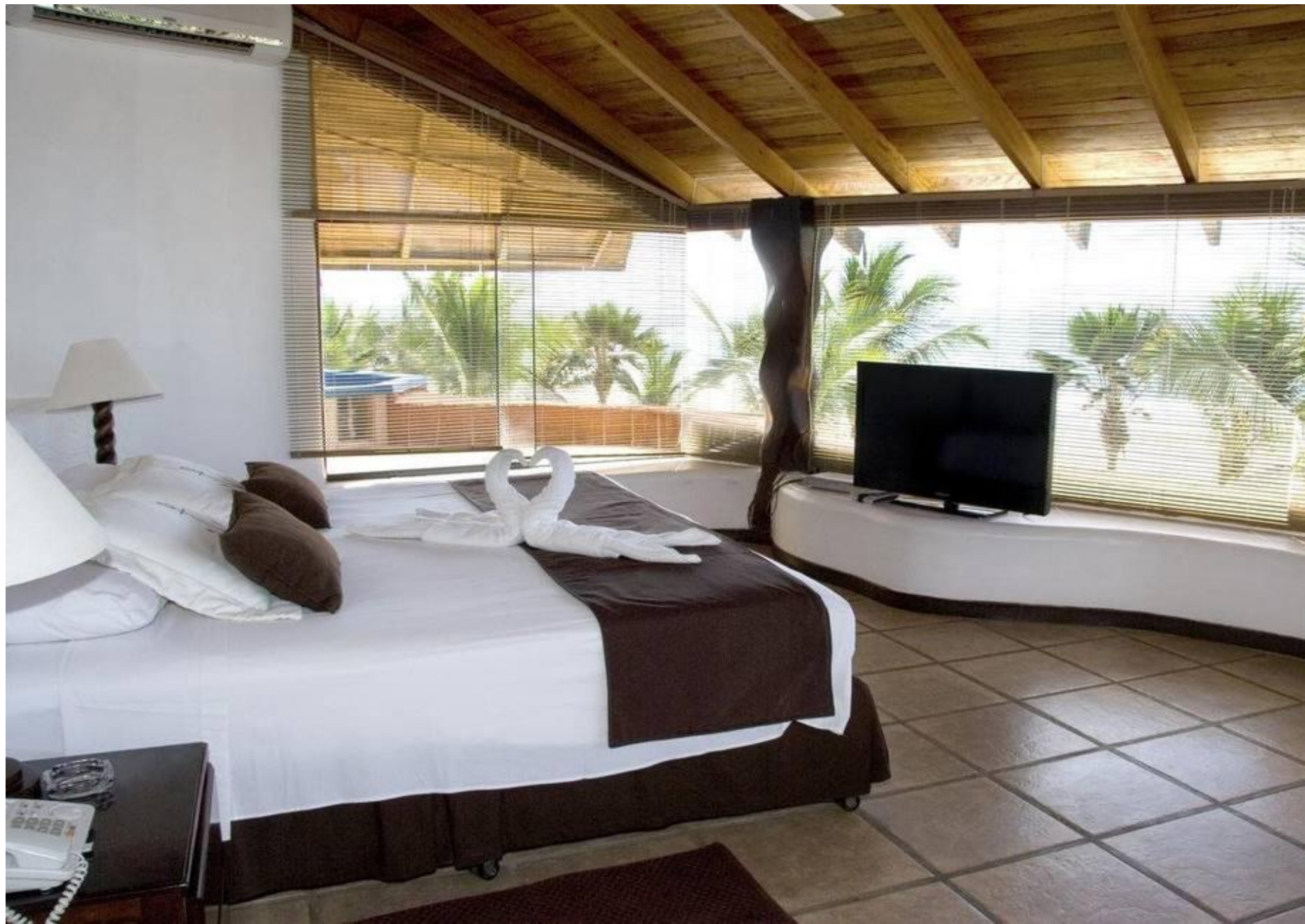
Punta Sal Suites & Bungalows - Tumbes