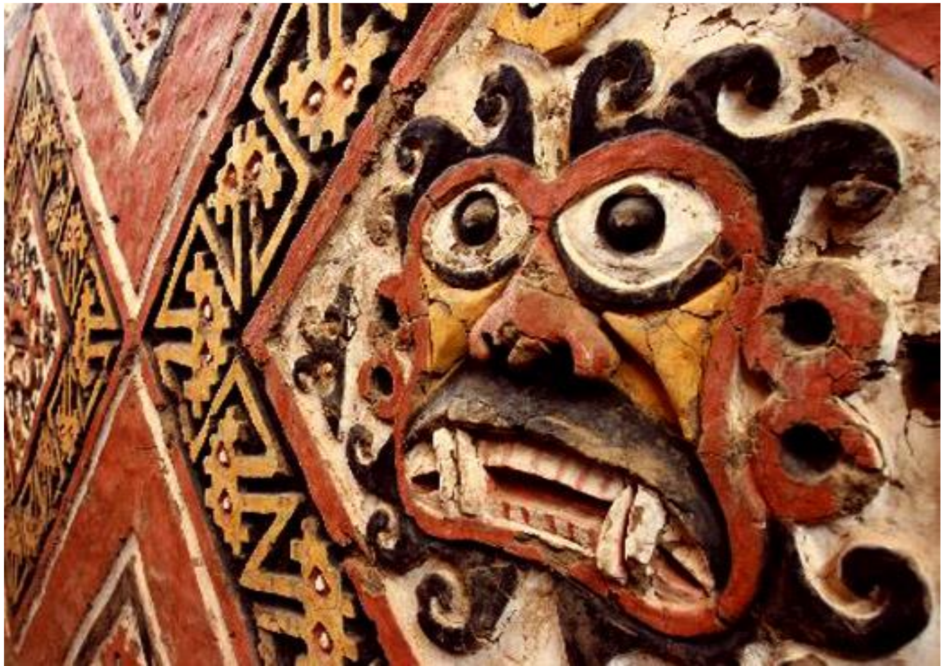
Temple of the Moon and Sun