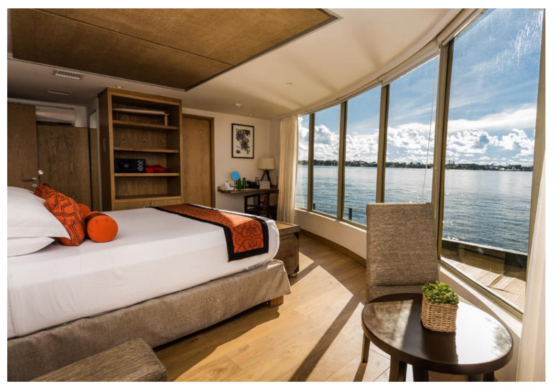
60 Metropolitan Touring