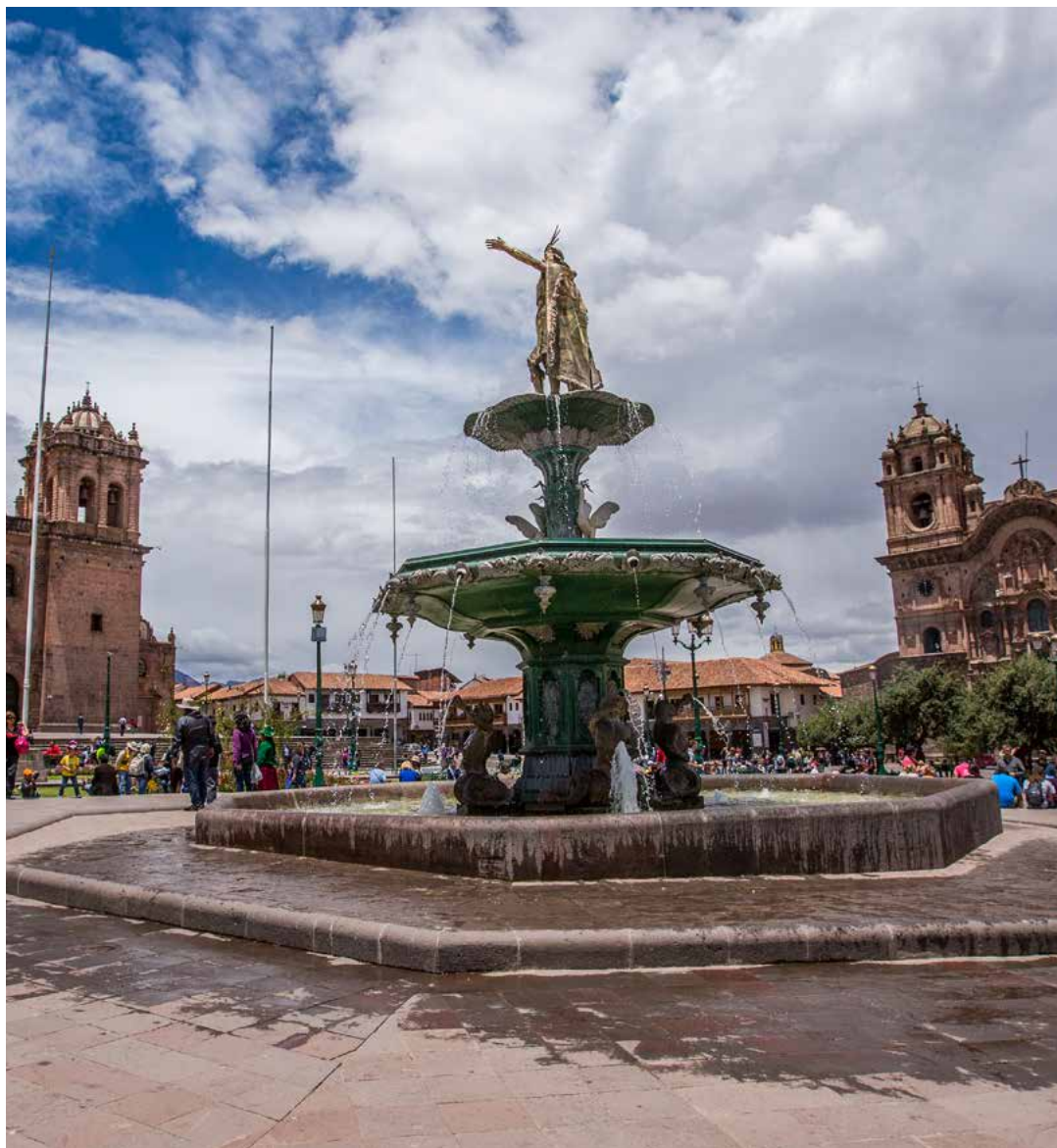
Plaza de Armas - Cusco