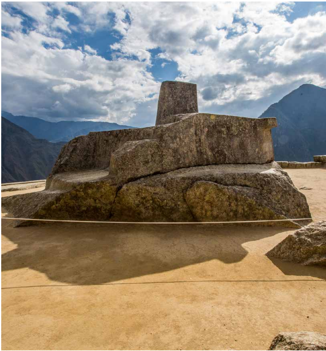
Sacred Sun Dial