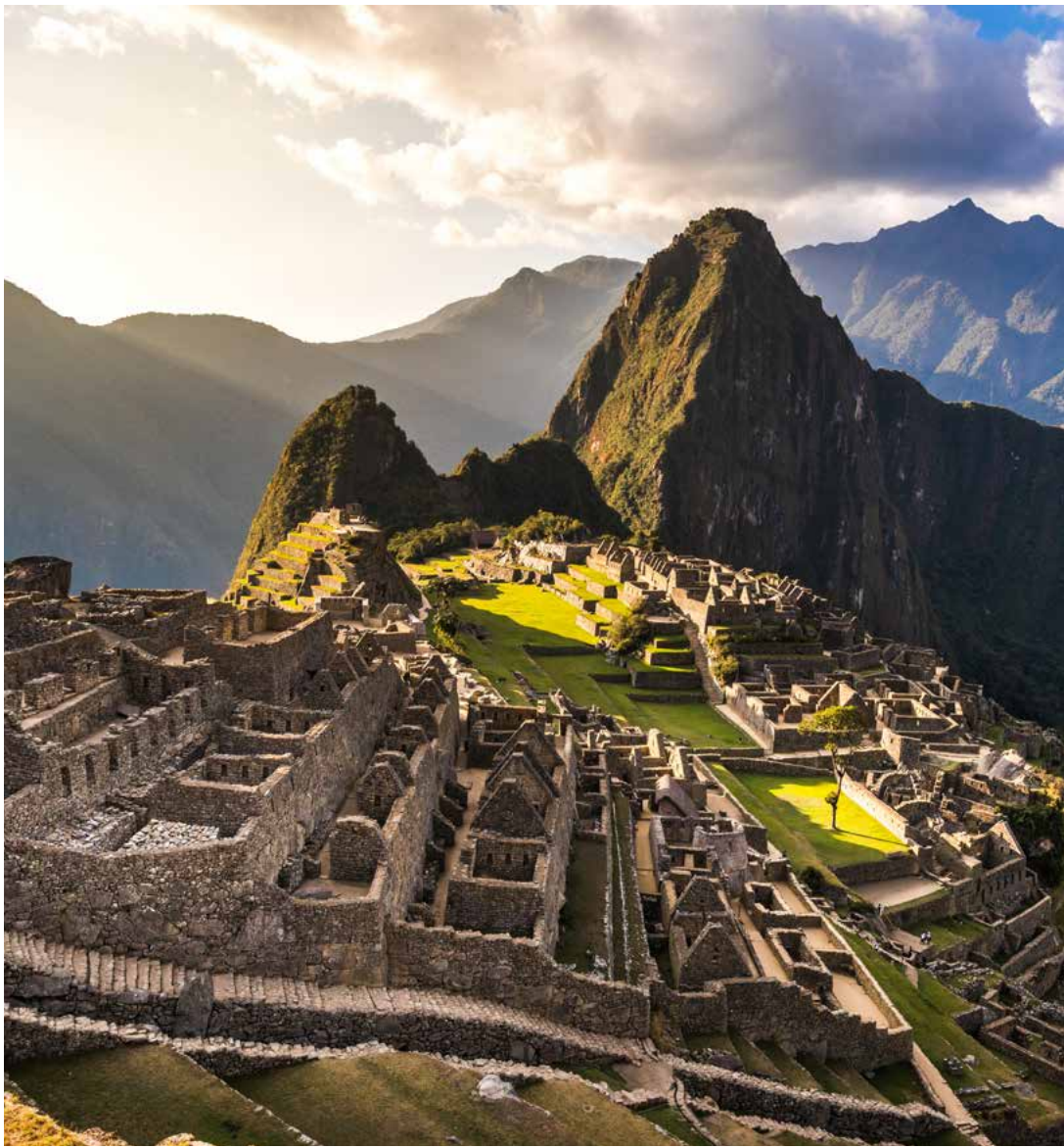
Machu Picchu Citadel